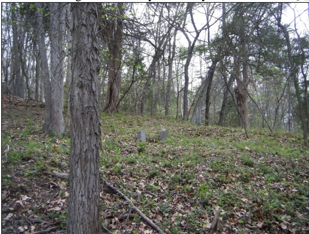
Photograph of 46-HM-226, looking northwest.