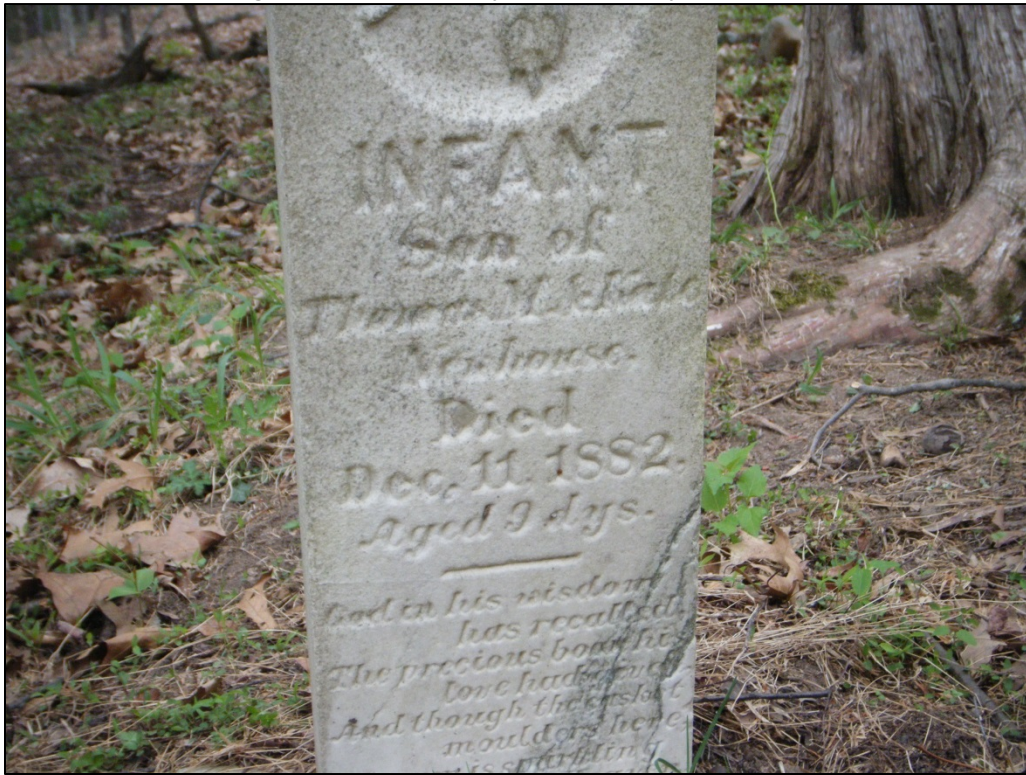
Photograph of an infant headstone encountered at 46-HM-226.