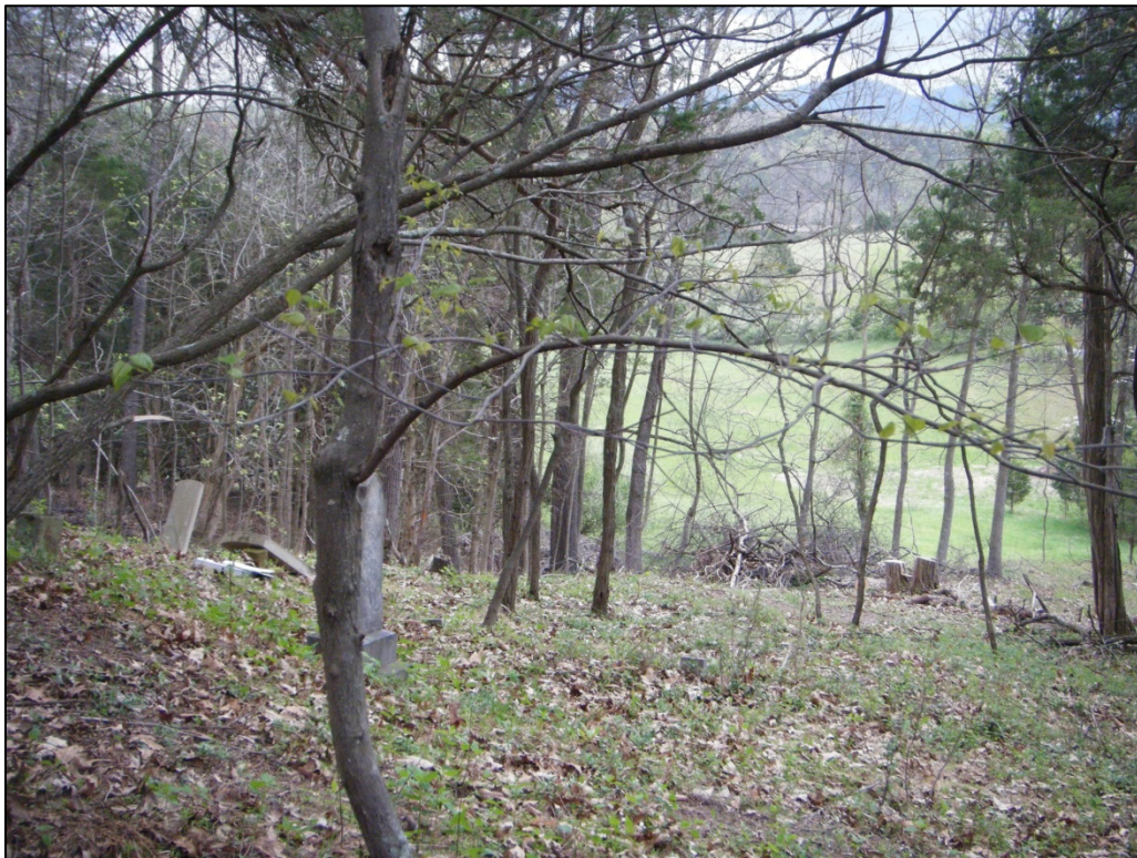
Photograph of 46-HM-226.