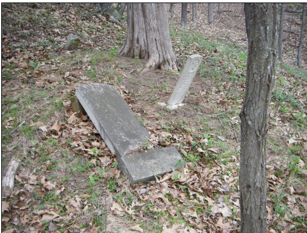
Photograph of fallen and tilted headstones documented at 46-HM-226.