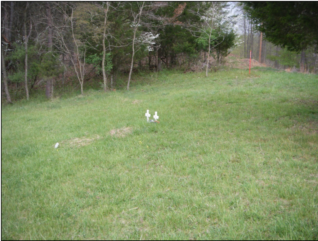
Photograph of 46-HM-227, looking south.