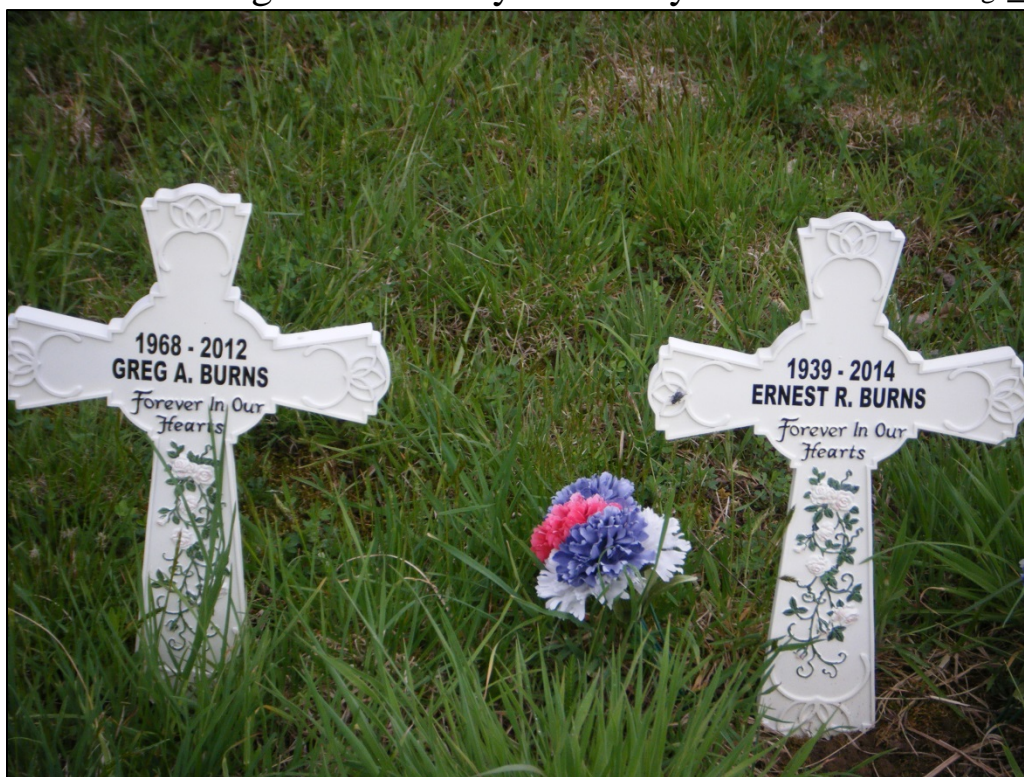
Photograph of the markers documented at 46-HM-227.