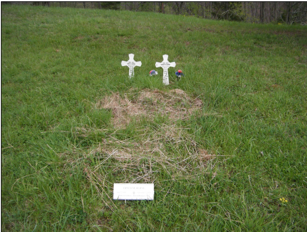
Photograph of 46-HM-227, looking west.