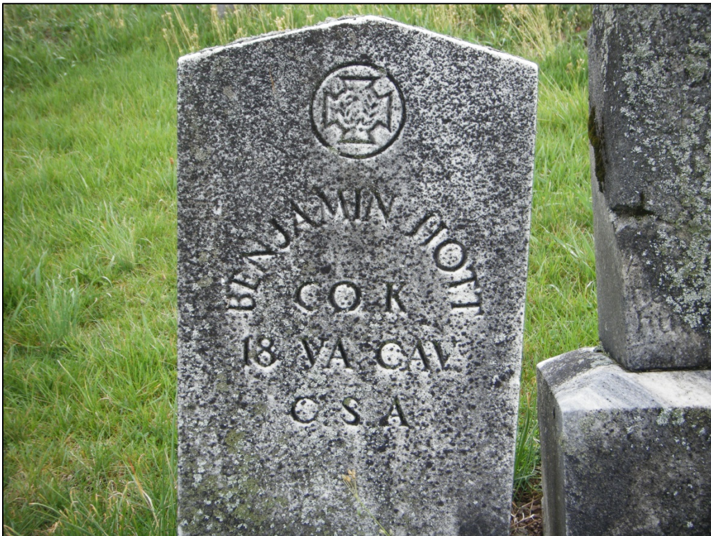
Photograph of a headstone of a Confederate veteran encountered at 46-HM-229.