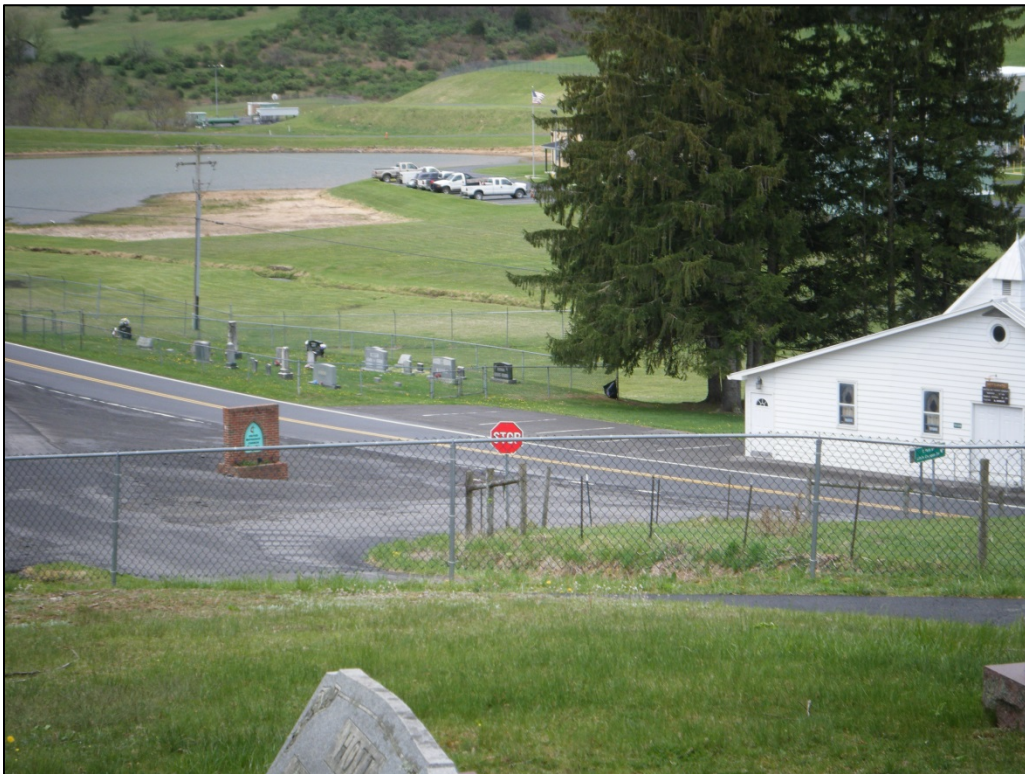
Photograph of the newer section of 46-HM-229, looking southwest.