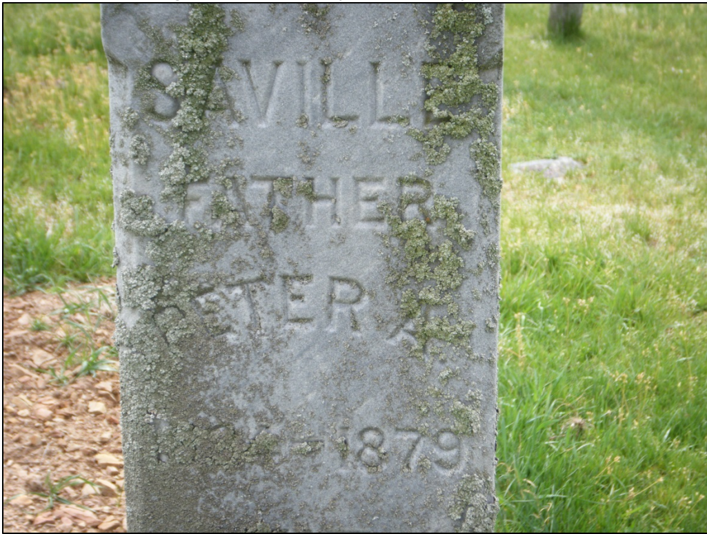
Photograph of a headstone documented at 46-HM-229.