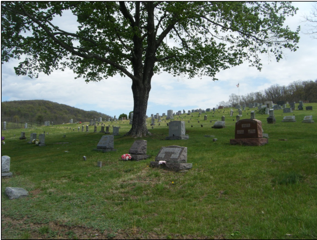
Photograph of 46-HM-229, looking northeast.