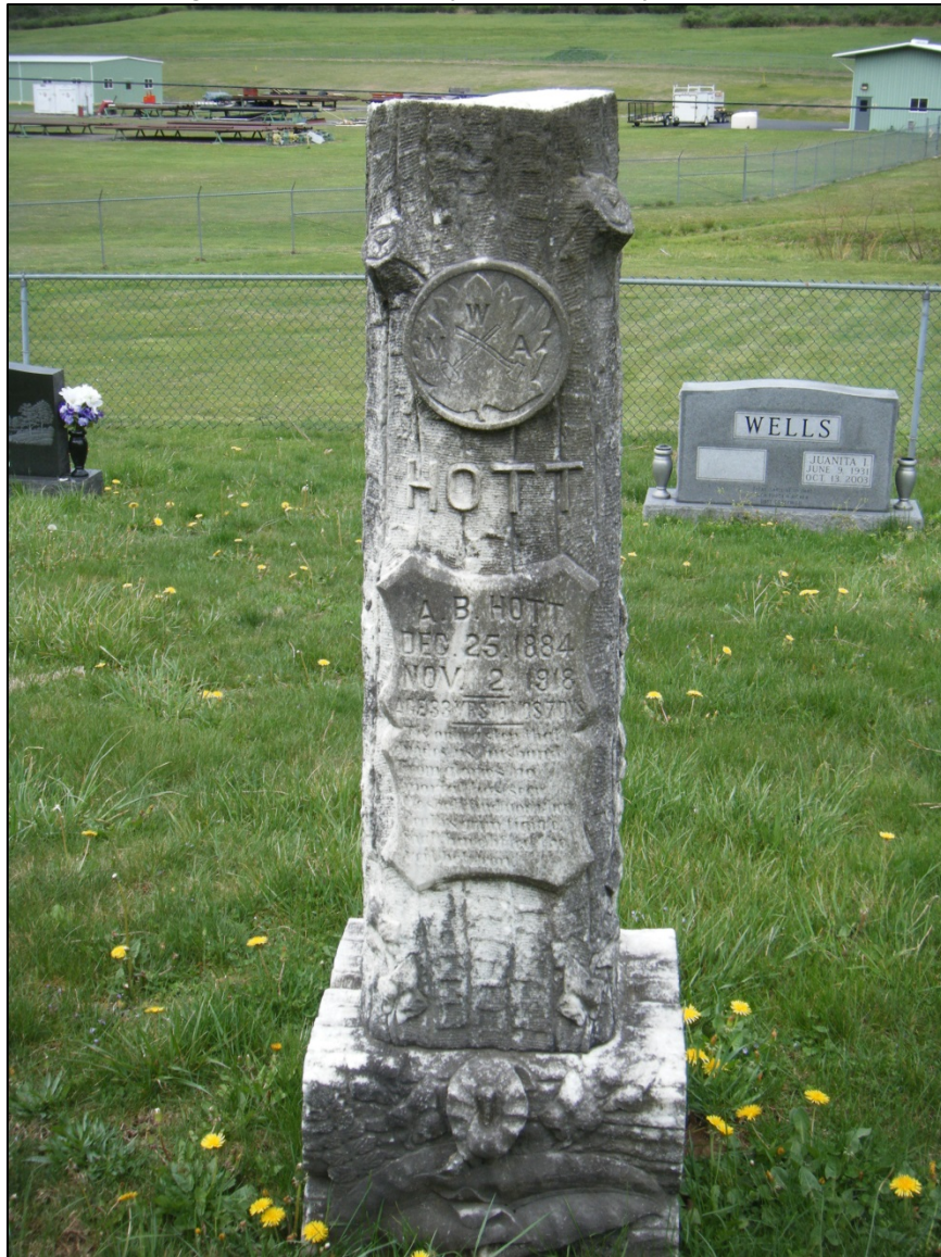
Photograph of a monument documented at 46-HM-229.