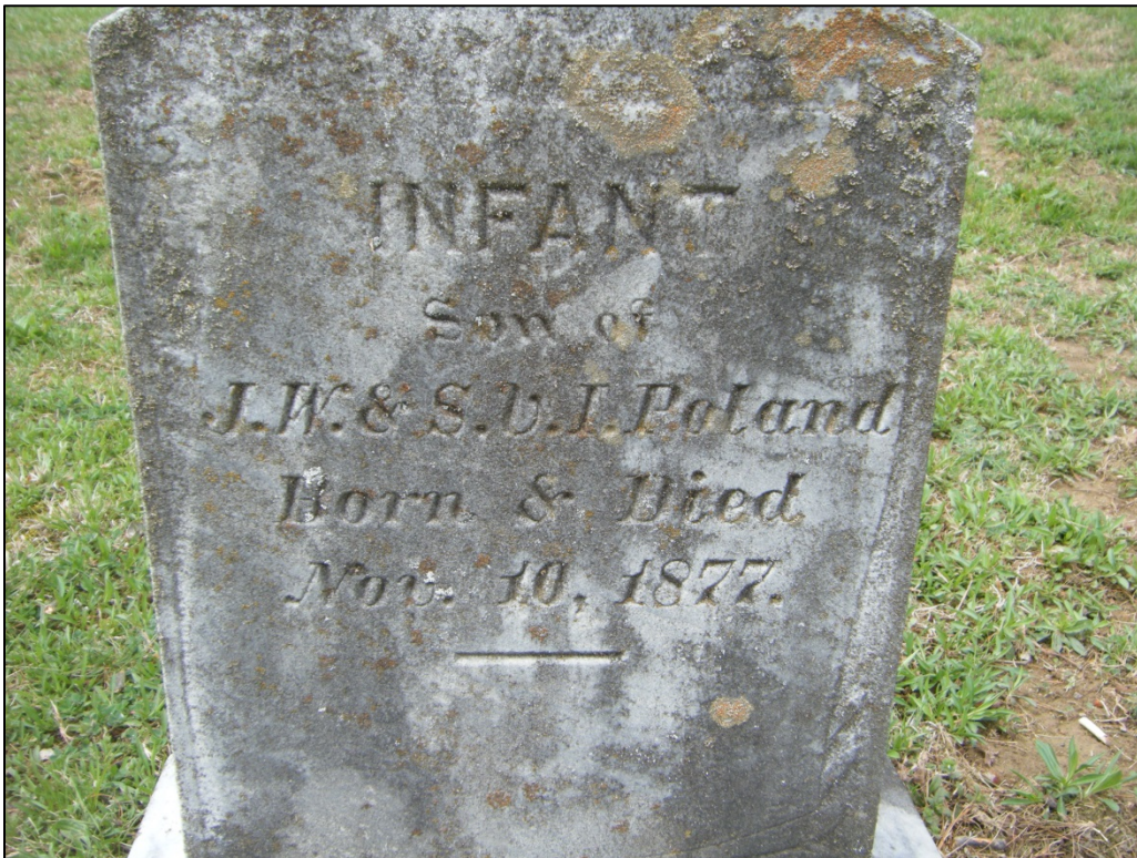
Photograph of an infant headstone encountered at 46-HM-231.