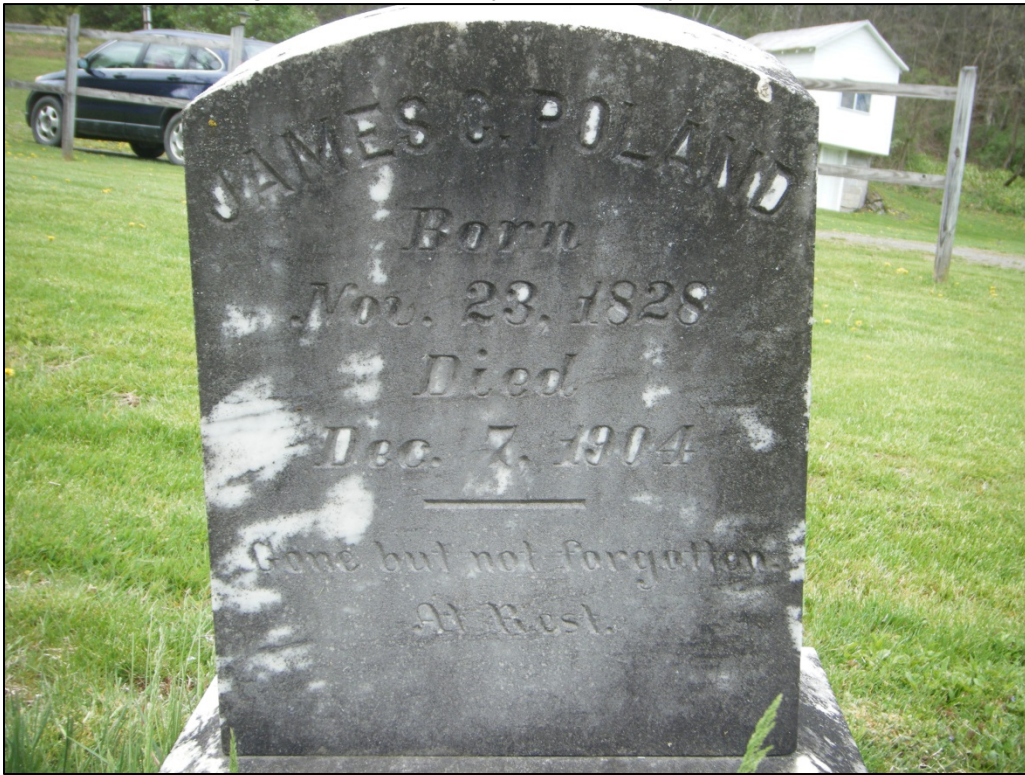
Photograph of a headstone documented at 46-HM-231.