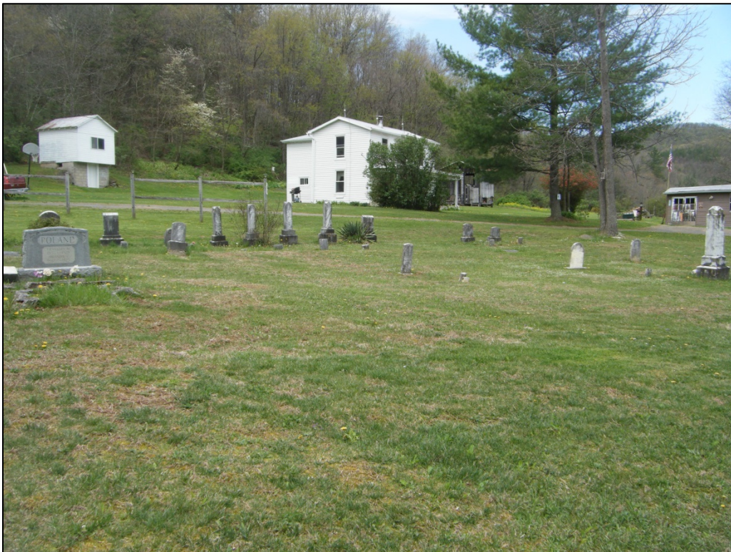
Photograph of 46-HM-231, looking northwest.