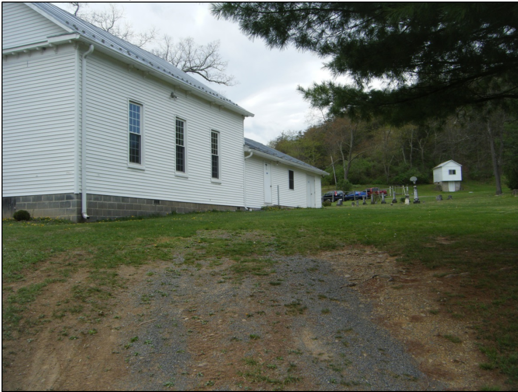
Photograph of 46-HM-231, looking west.