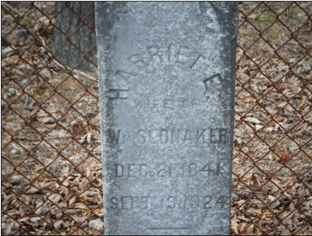
Photograph of a headstone encountered at 46-HM-234.