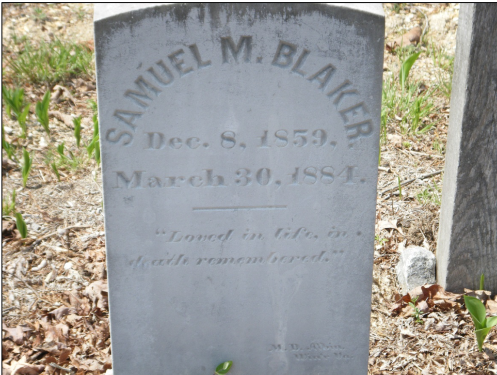
Photograph of a headstone documented at 46-HM-234.