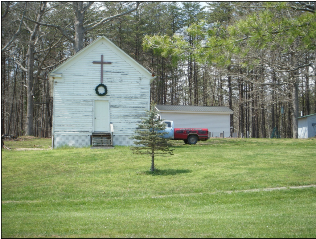
Photograph of 46-HM-234, looking west.