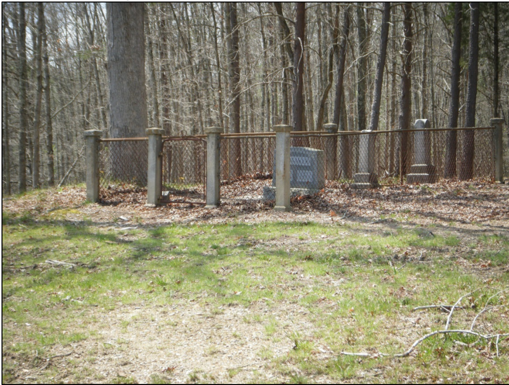
Photograph of another section of 46-HM-234, looking southwest.