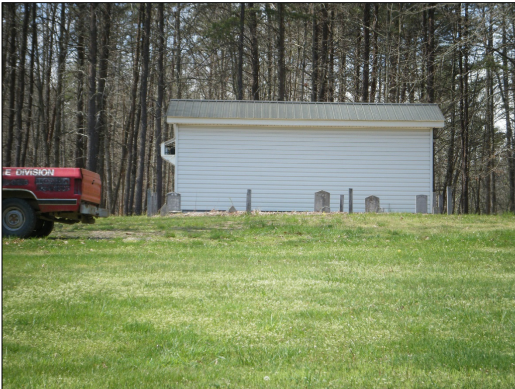
Photograph of 46-HM-234, looking west.