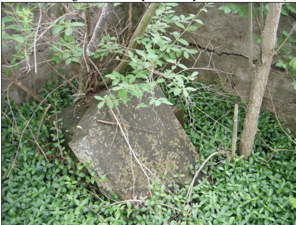
Photograph of a tilted and badly eroded headstone documented at 46-HM-239.