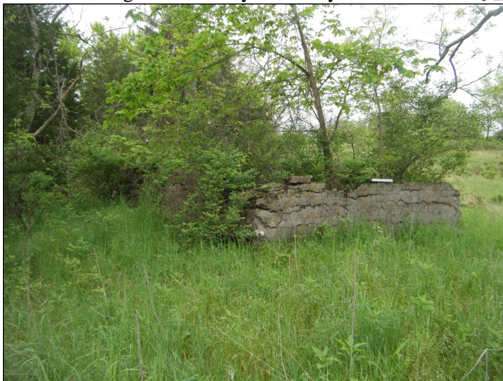
Photograph of 46-HM-239, looking south.