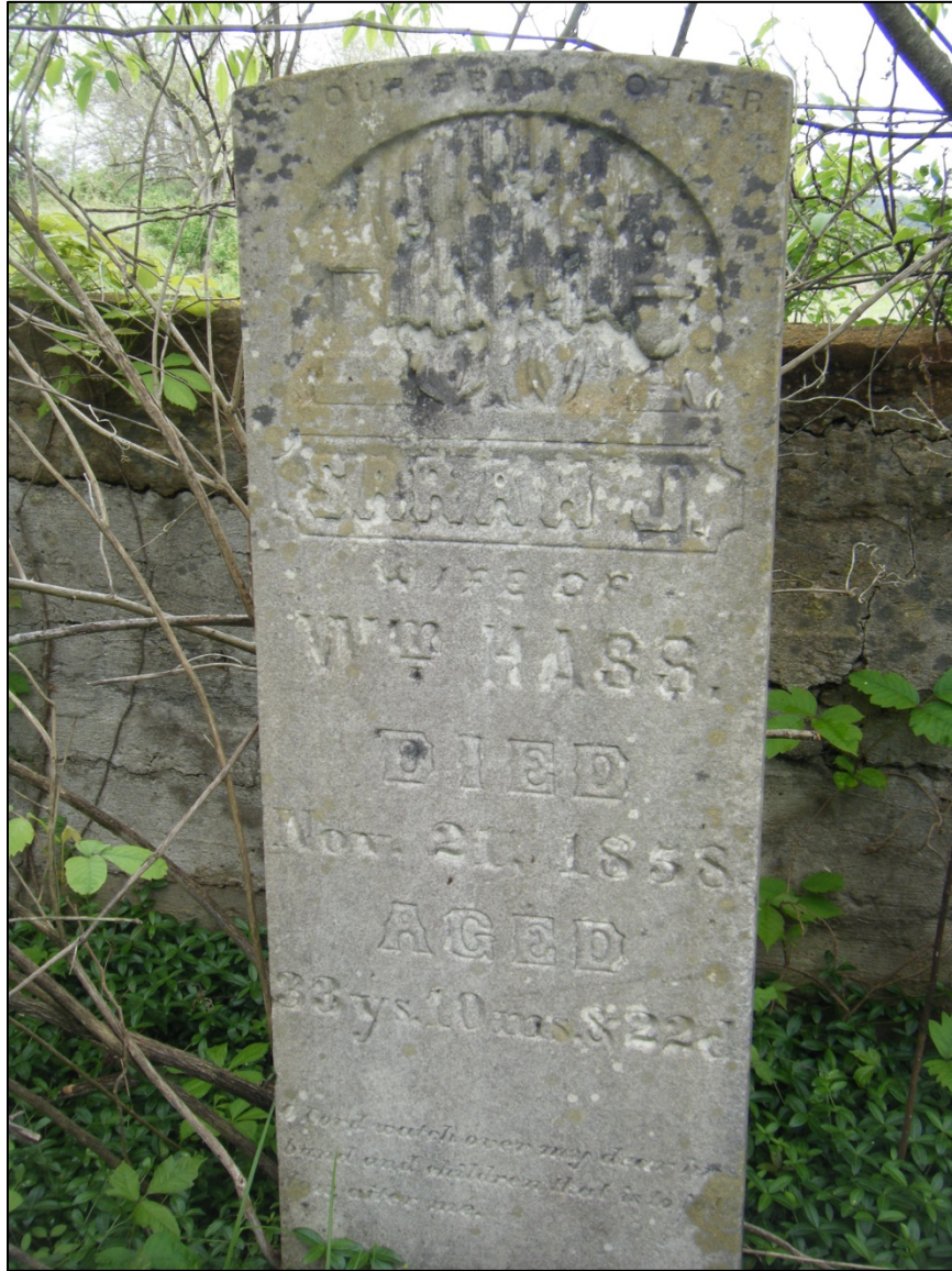
Photograph of a headstone encountered at 46-HM-239.