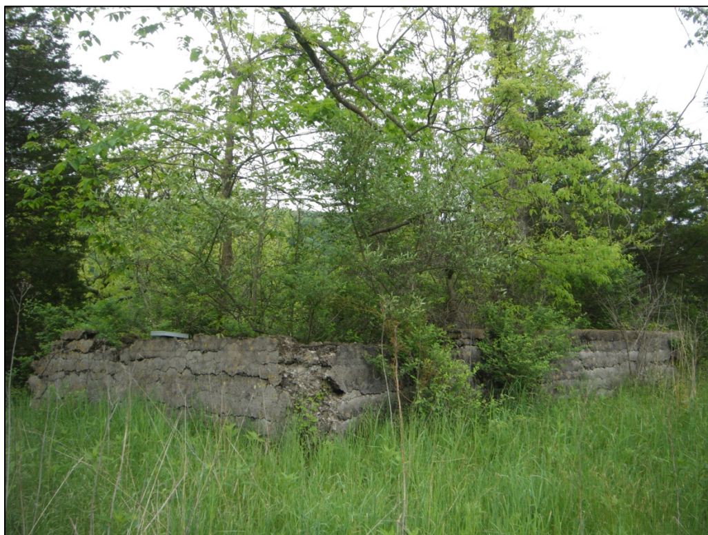
Photograph of 46-HM-239, looking southeast.