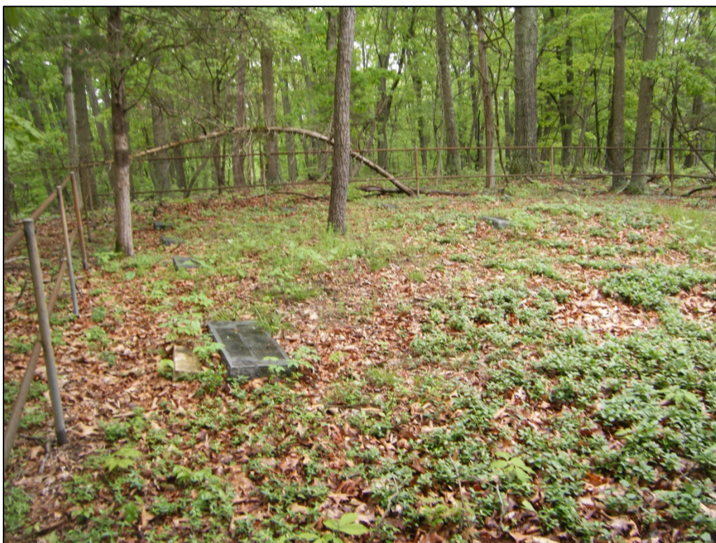
Photograph of 46-HM-242, looking west.