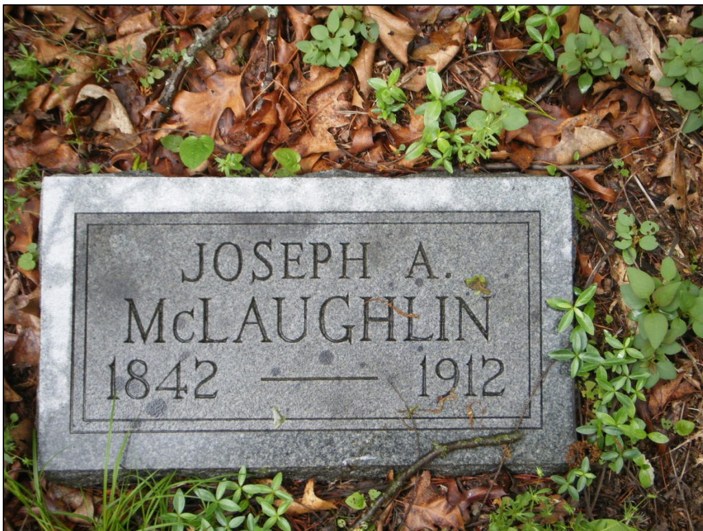
Photograph of a headstone documented at 46-HM-242.