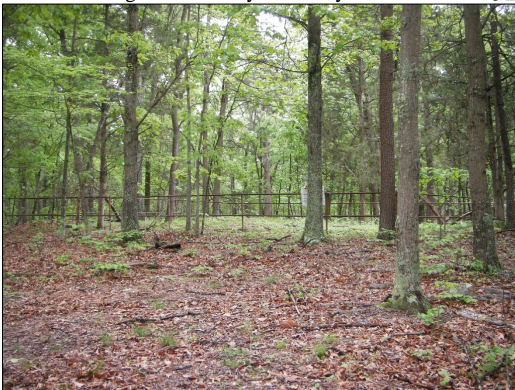
Photograph of 46-HM-242, looking north.