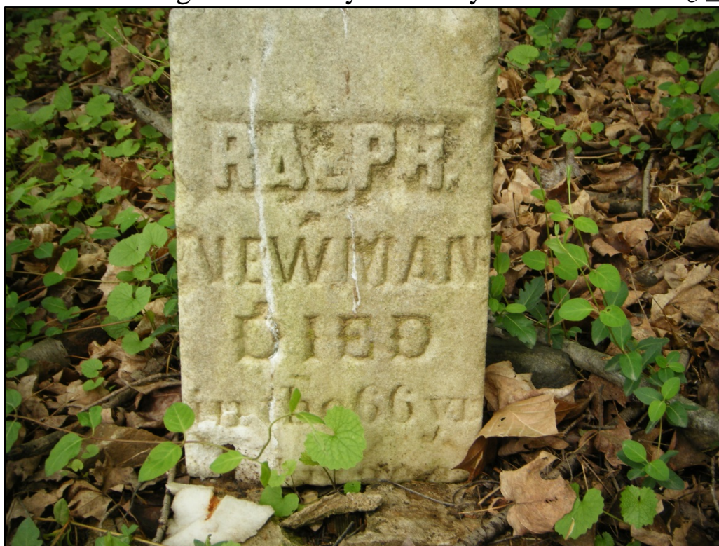
Photograph of a headstone documented at 46-HM-243.