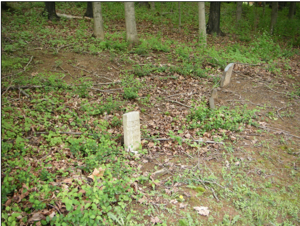
Photograph of 46-HM-243, looking east.