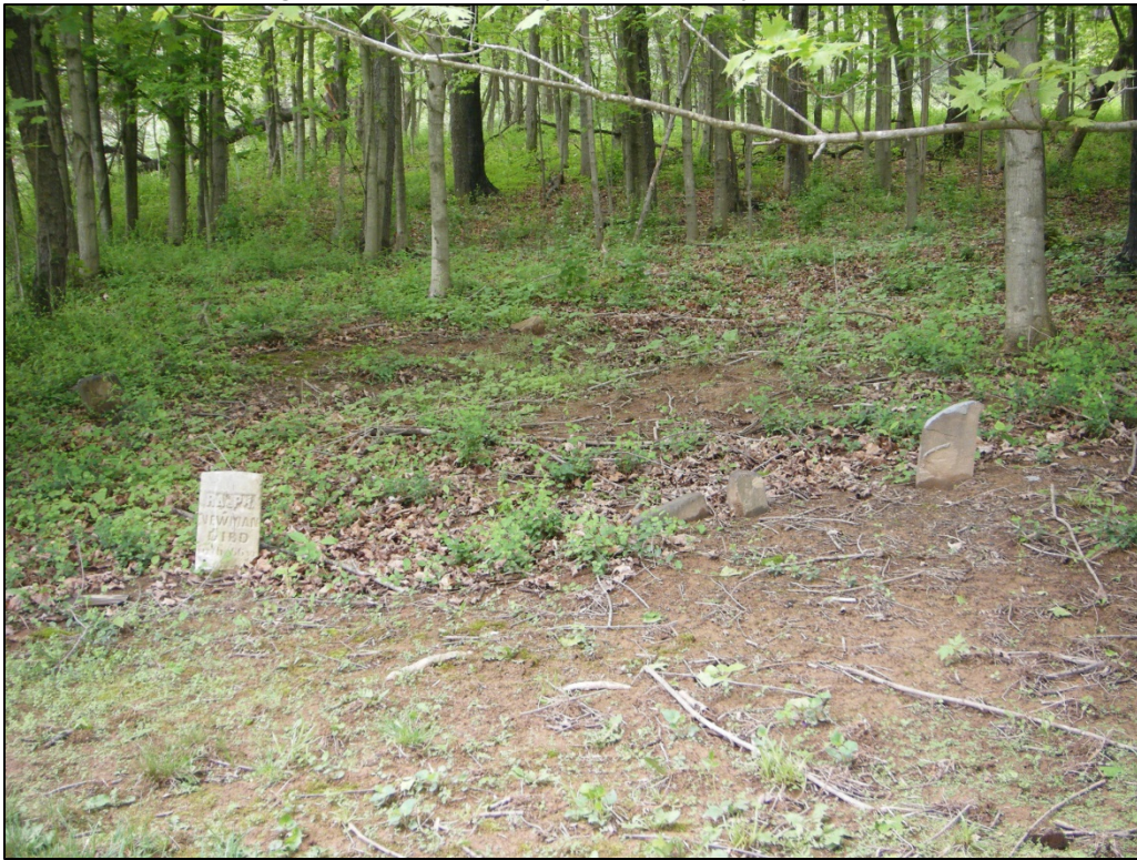
Photograph of 46-HM-243, looking north.