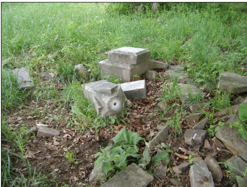
Photograph of 46-HM-245 showing fallen and damaged headstone, looking southwest.