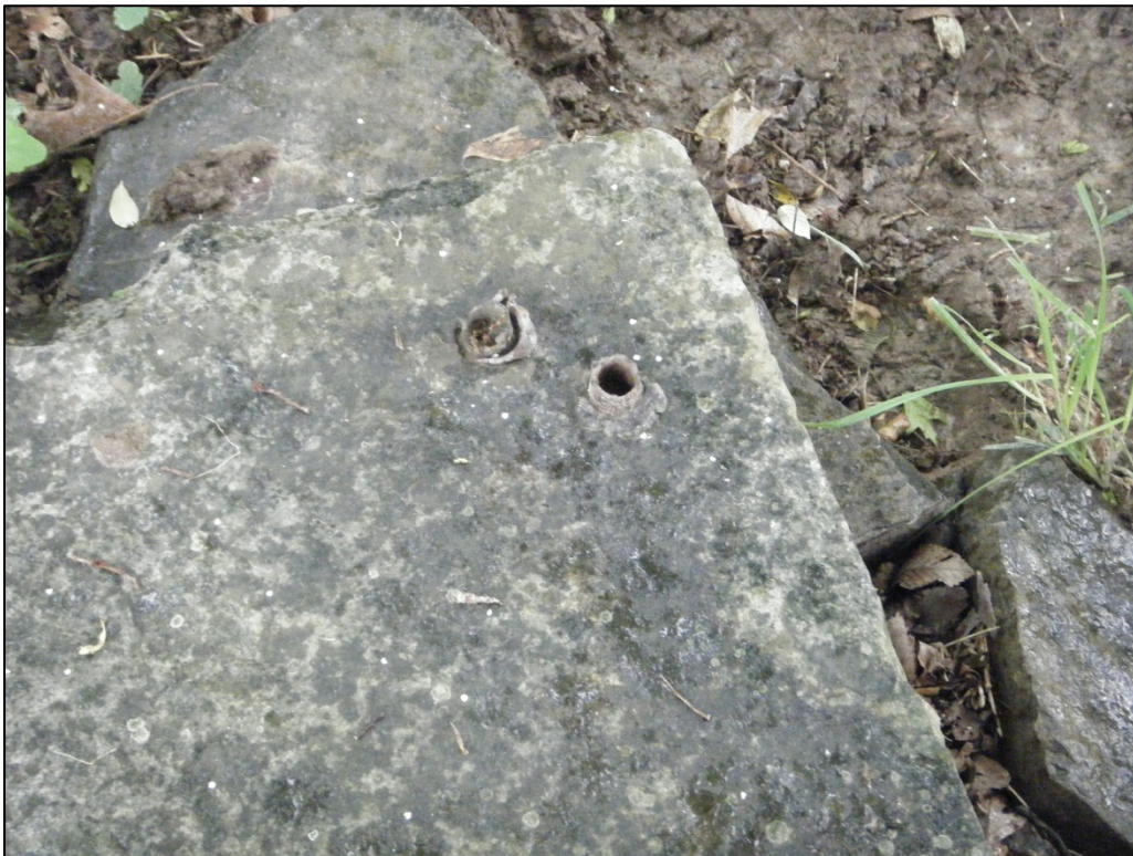
Photograph of the damaged stand encountered at 46-HM-245.