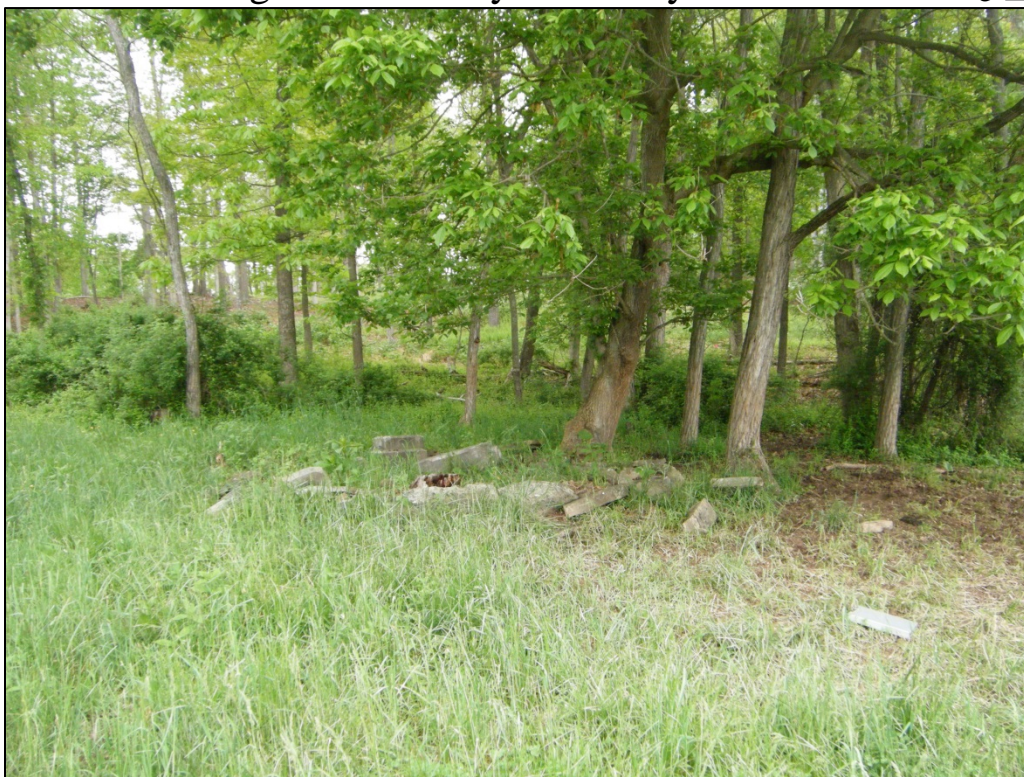
Photograph of 46-HM-245, looking west.