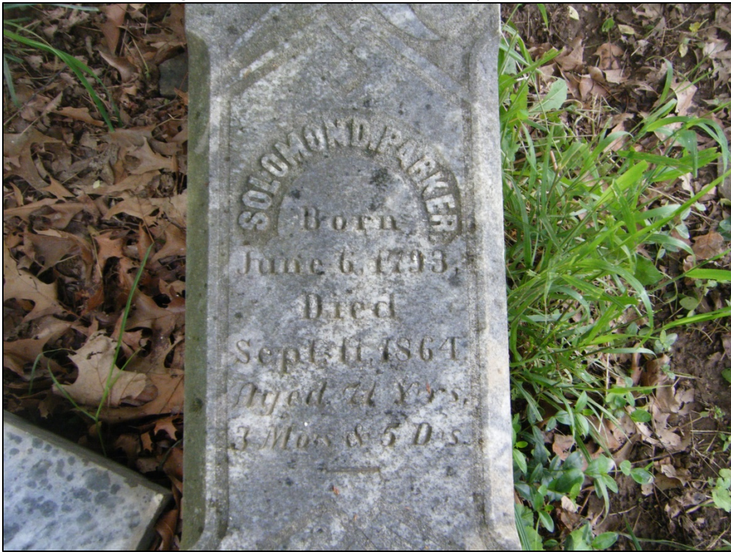
Photograph of the inscription on the headstone at 46-HM-245.