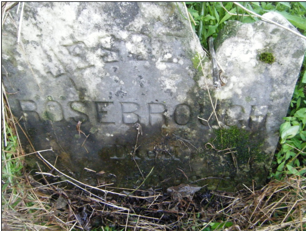
Photograph of a broken headstone encountered at 46-HM-247.