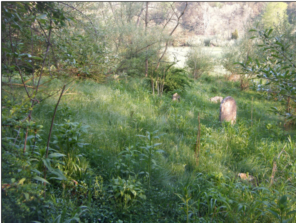
Photograph of the overgrowth at 46-HM-247.