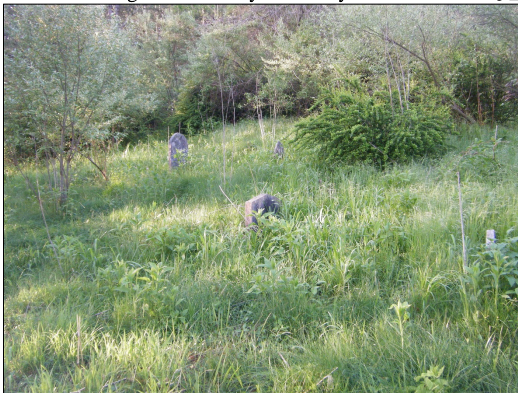
Photograph of 46-HM-247, looking northwest.