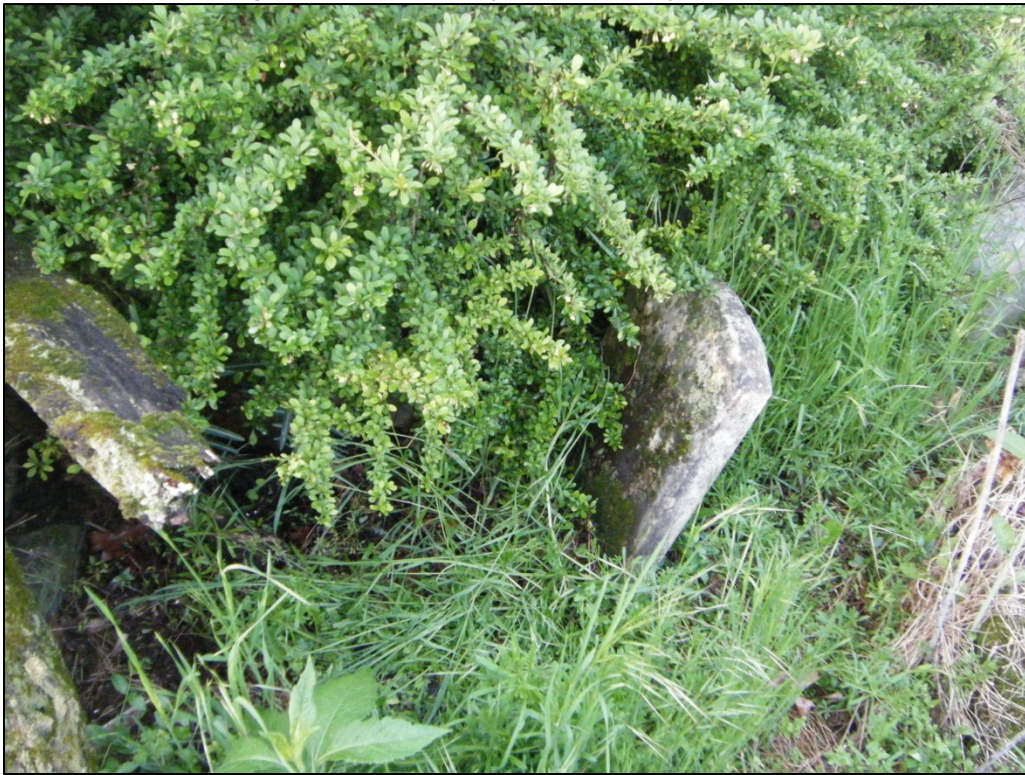
Photograph of tilted, fallen, and broken headstones documented at 46-HM-247.