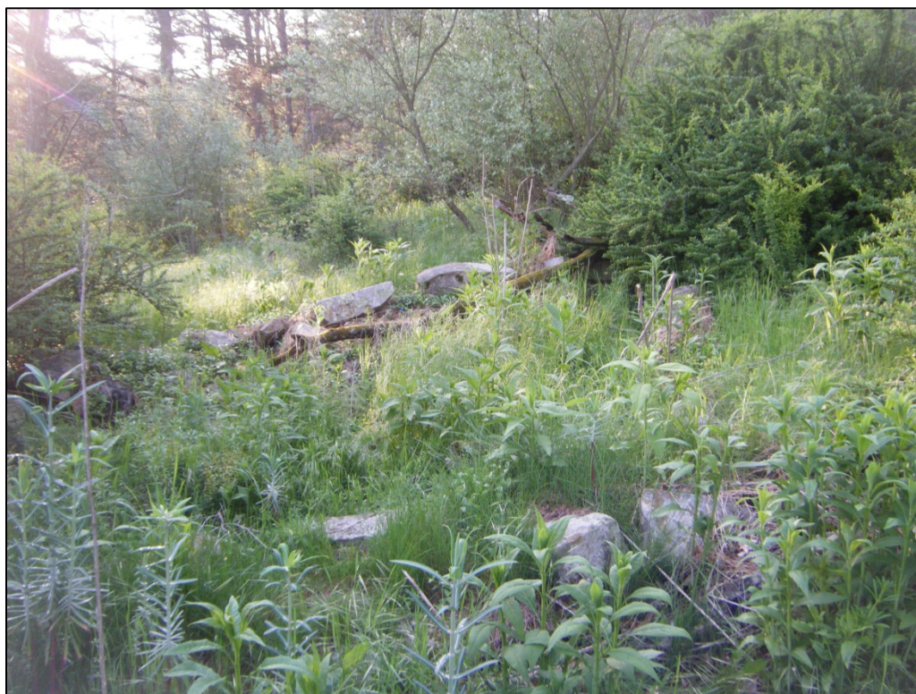
Photograph of 46-HM-247, looking west.