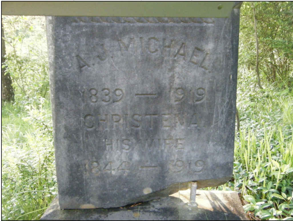
Photograph of a broken headstone encountered at 46-HM-247.