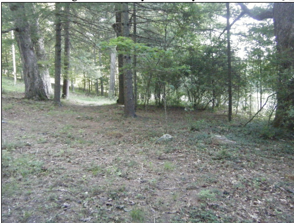
Photograph of 46-HM-253, looking south.