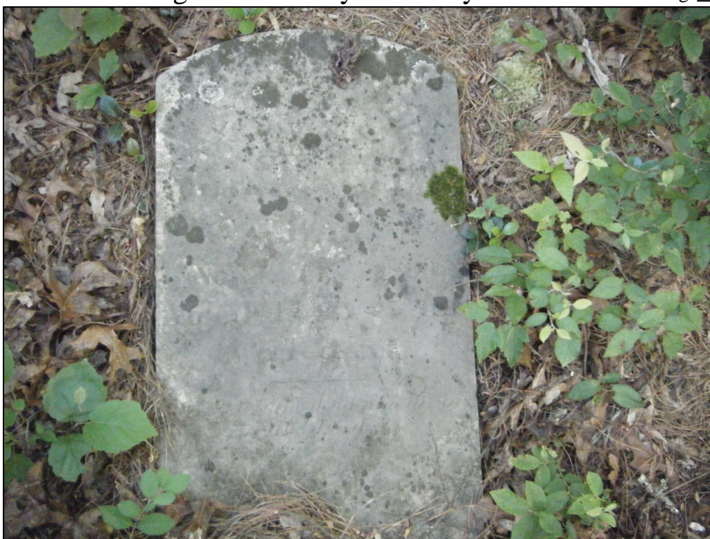
Photograph of a fallen headstone encountered at 46-HM-253.