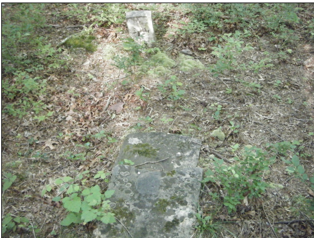
Photograph of disturbance encountered at 46-HM-253.