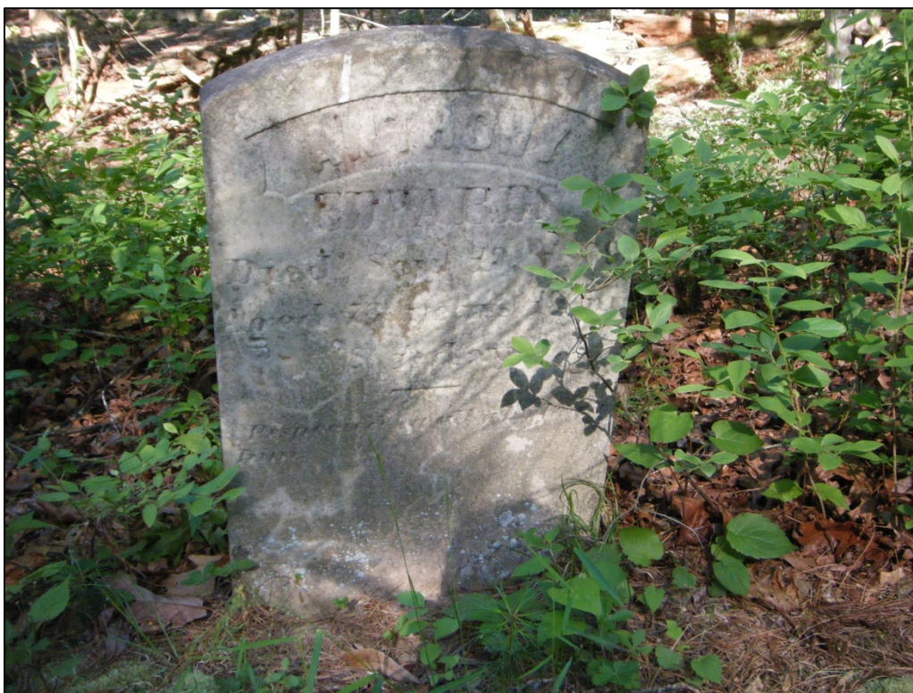
Photograph of an eroded headstone documented at 46-HM-253.