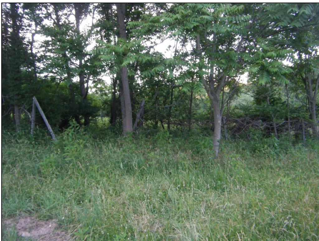
Photograph of 46-HM-254, looking east.