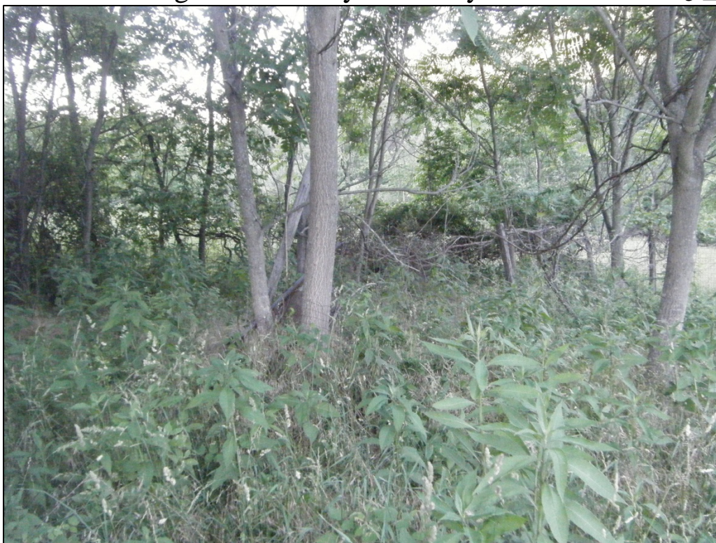
Photograph of 46-HM-254, looking southeast.