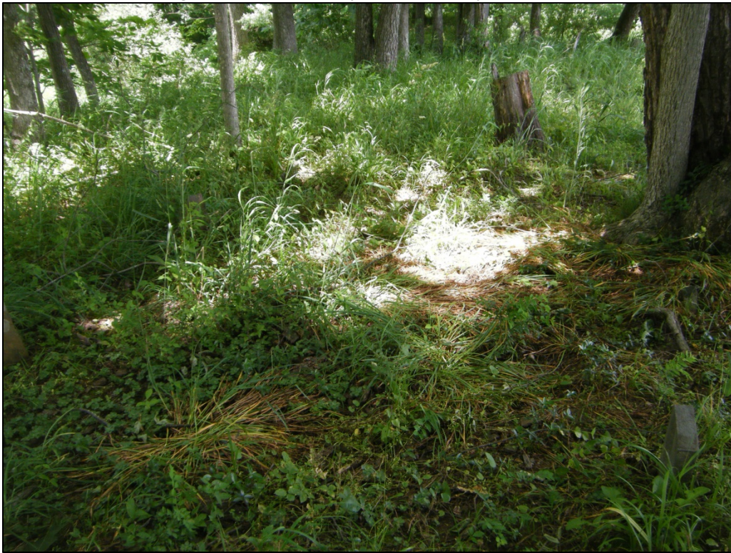
Photograph of possible grave depressions outside of fenced boundary of 46-HM-257, looking west.