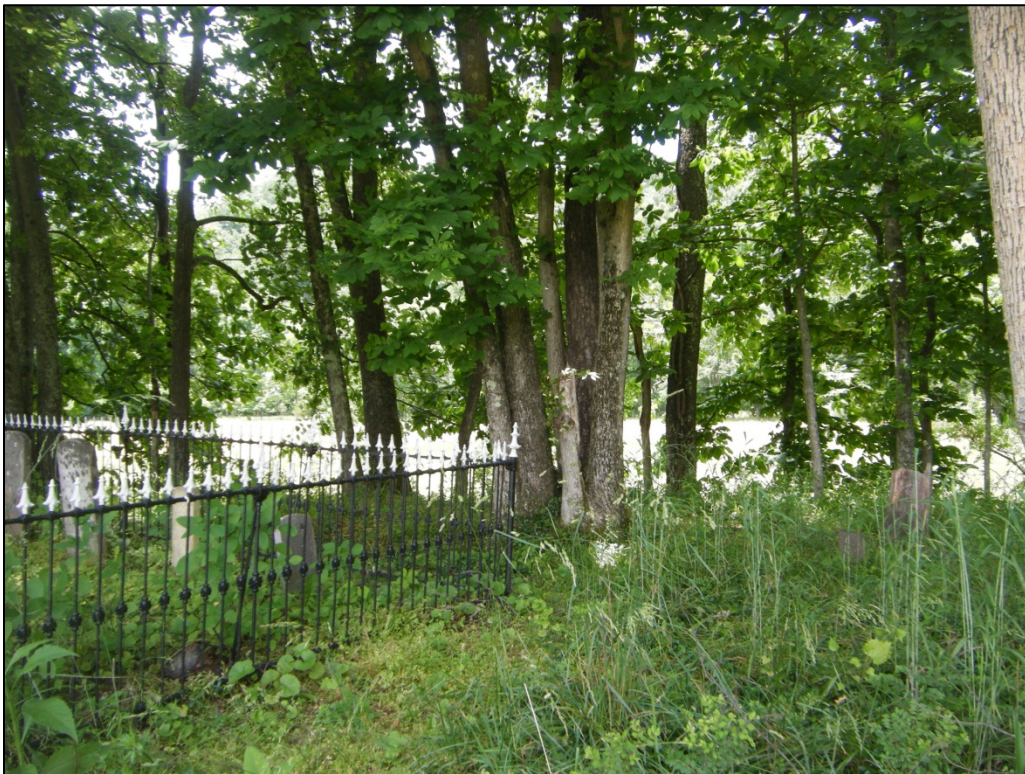
Photograph of 46-HM-257 looking southwest.