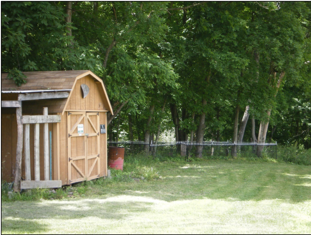
Photograph of 46-HM-257, looking west.