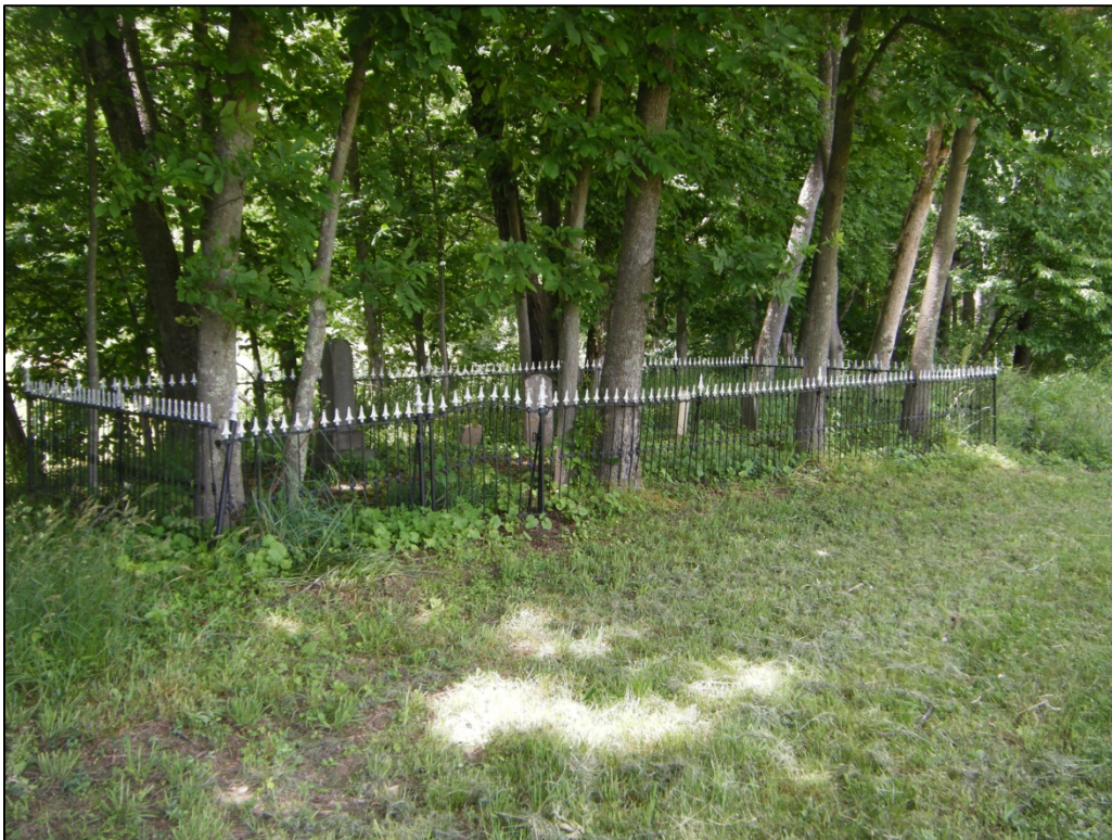
Photograph of 46-HM-257, looking northwest.