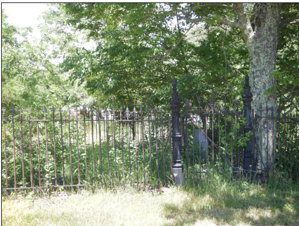
Photograph of 46-HM-258, looking northeast.