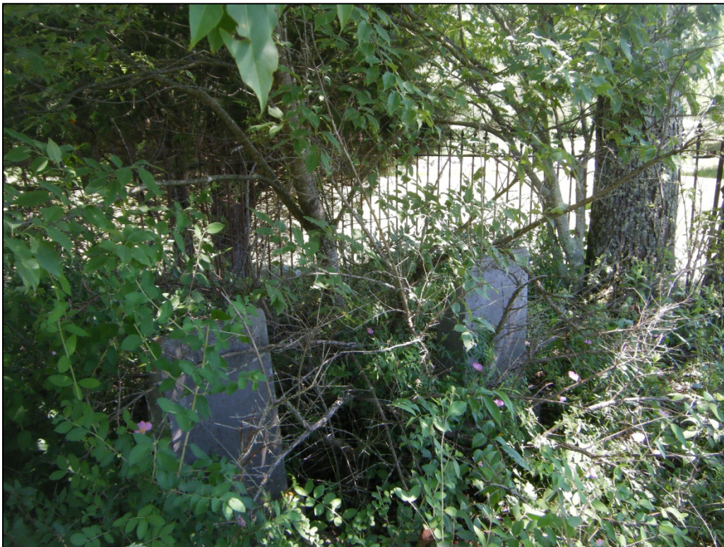
Photograph of headstones and overgrowth encountered at 46-HM-258.