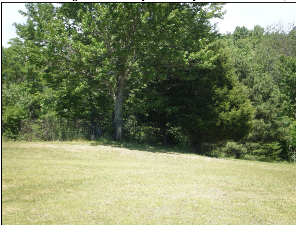
Photograph of 46-HM-258, looking north.