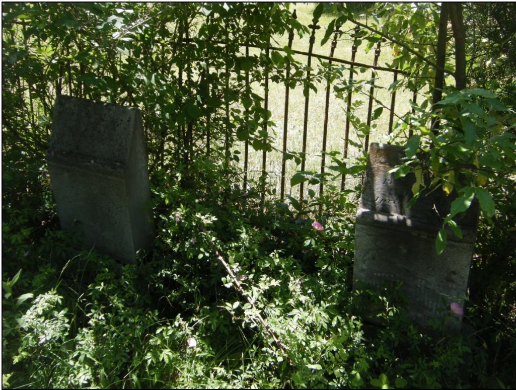
Photograph of headstones documented at 46-HM-258.