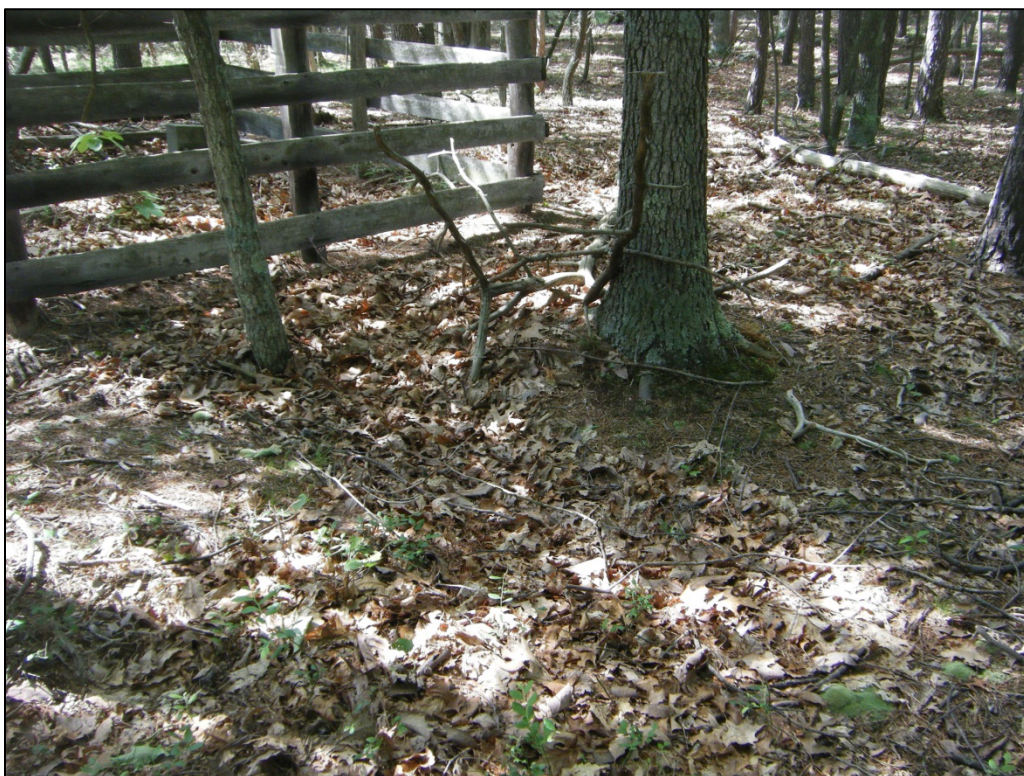
Photograph of possible grave depression outside of the fenced boundary of 46-HM-259, looking north.