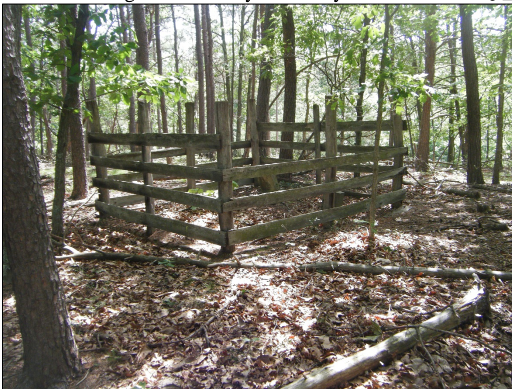
Photograph of 46-HM-259, looking southwest.