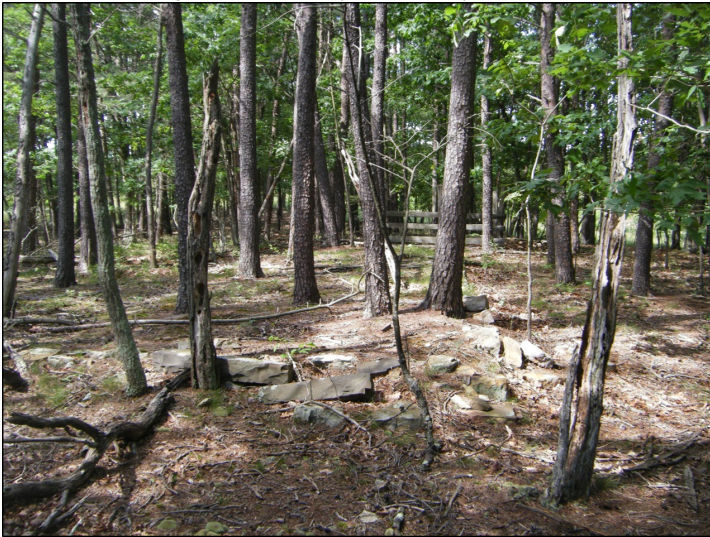
Photograph of church remnant next to 46-HM-259, looking northeast.