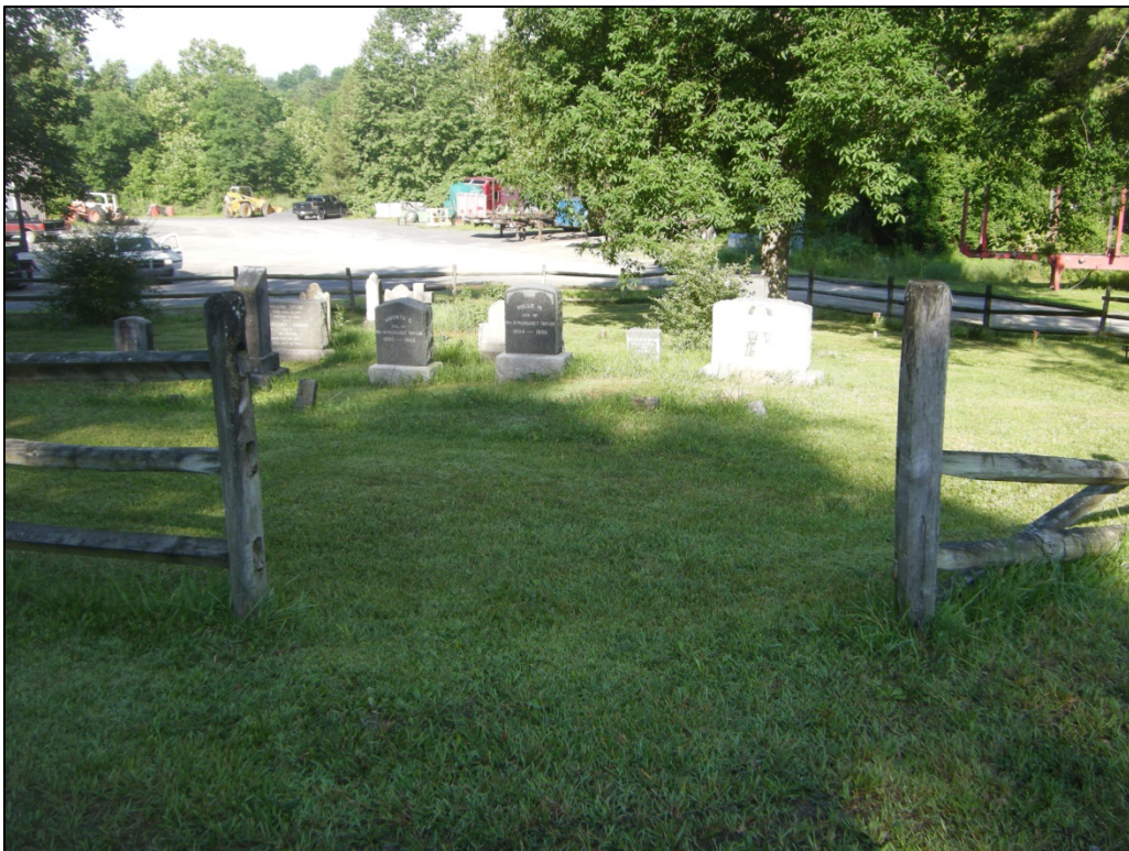
Photograph of 46-HM-260, looking southwest.