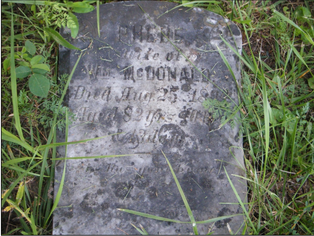
Photograph of a fallen headstone documented at 46-HM-260.