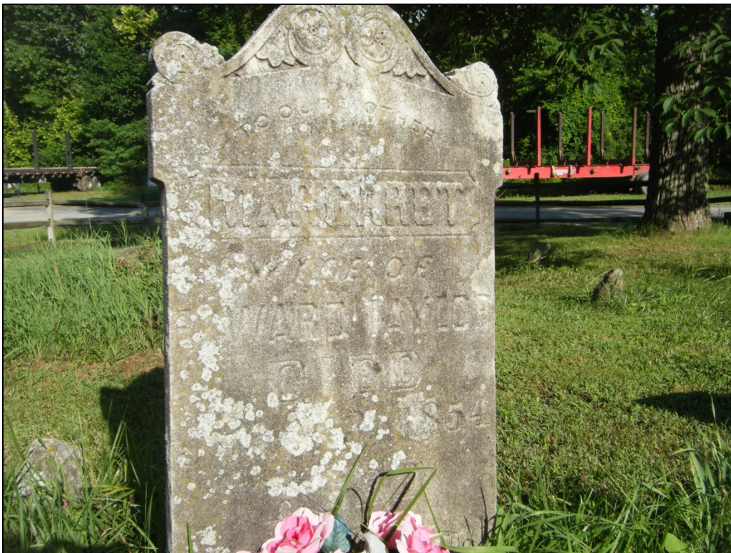
Photograph of a headstone encountered at 46-HM-260.