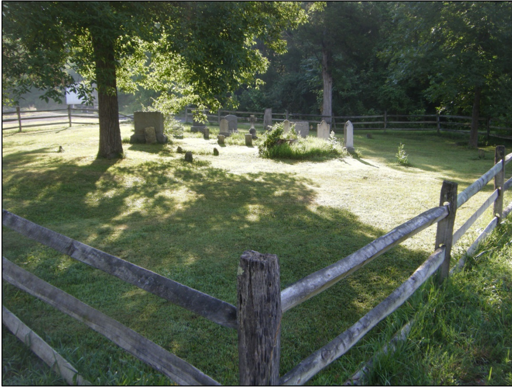
Photograph of 46-HM-260, looking northwest.