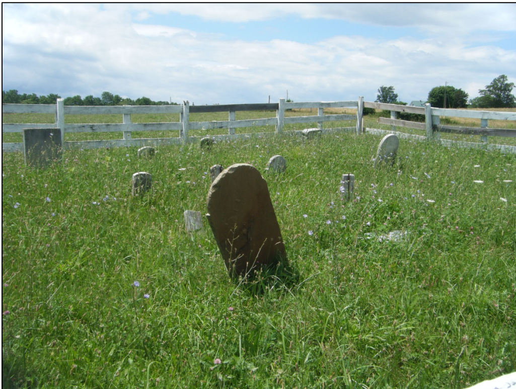
Photograph of 46-HM-264, looking northwest.