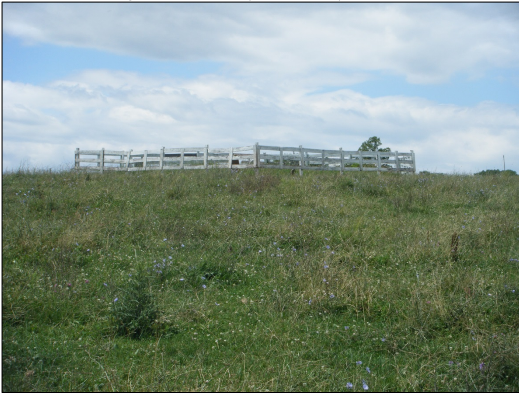
Photograph of 46-HM-264, looking northwest.