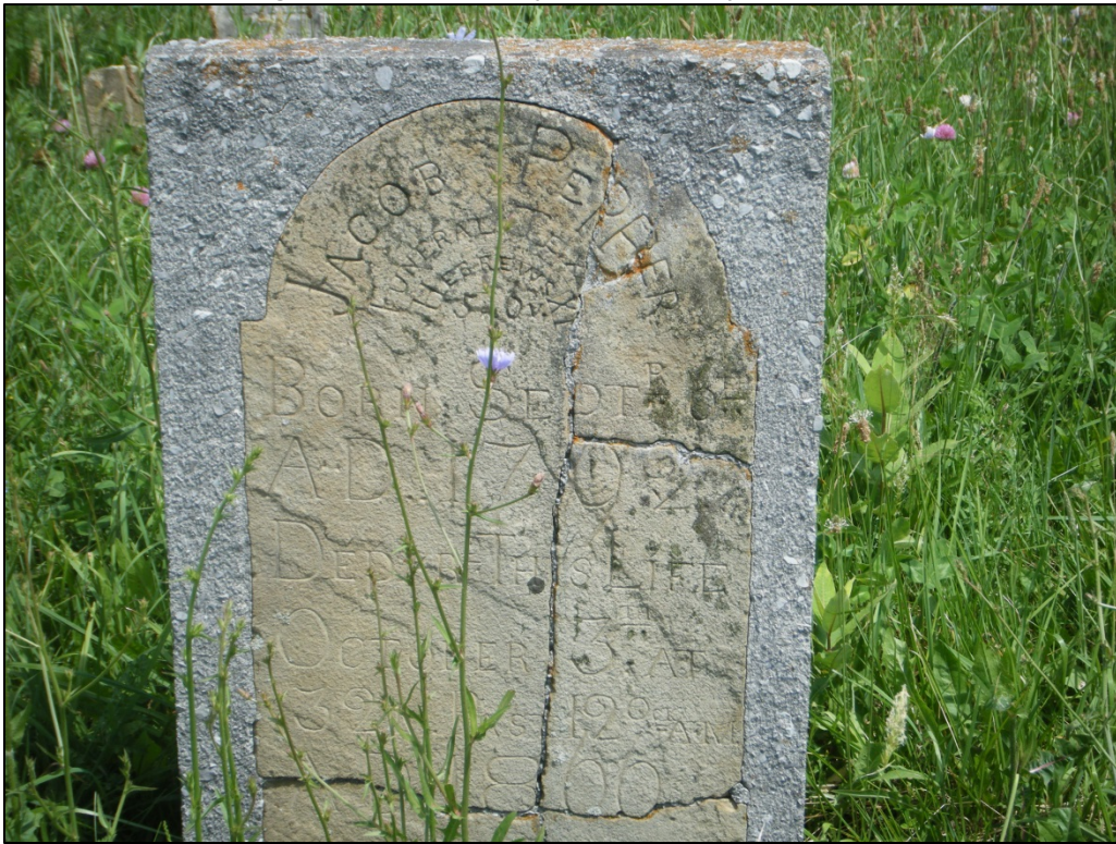
Photograph of a headstone documented at 46-HM-264.