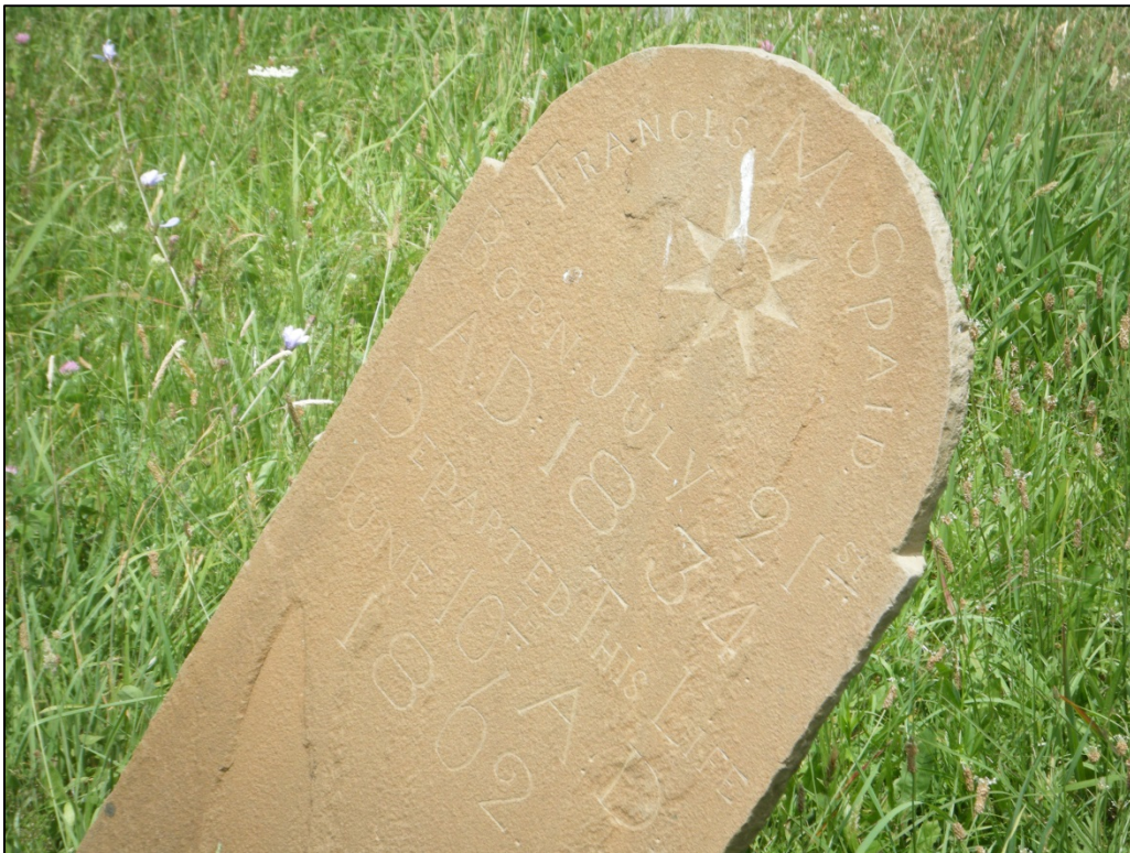
Photograph of a tilted headstone encountered at 46-HM-264.