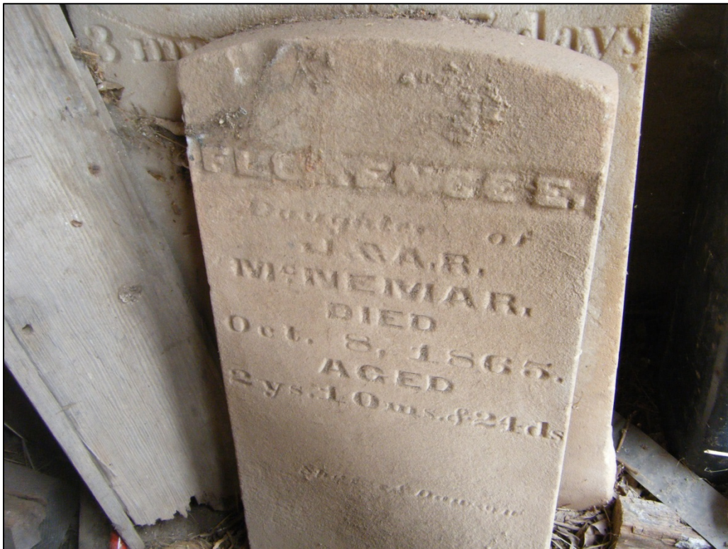
Photograph of a headstone that had been removed from 46-HM-266.