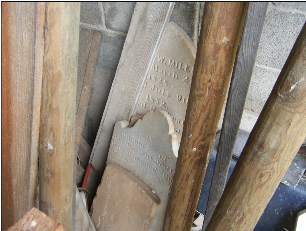
Photograph of the headstones removed from 46-HM-266.