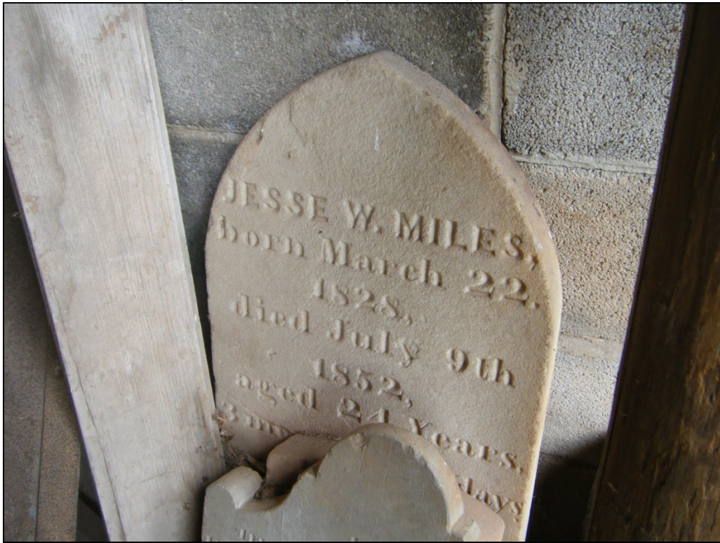
Photograph of a headstone that had been removed from 46-HM-266.