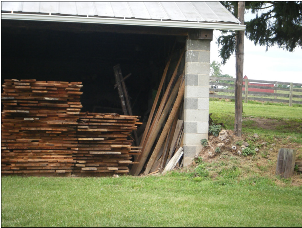
Photograph of possible location (near tree and barn) of 46-HM-266, looking south.