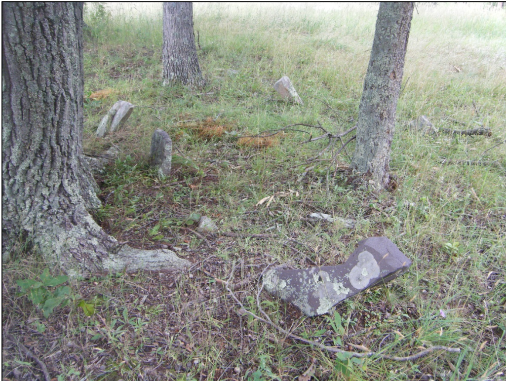
Photograph of a broken headstone as well as fieldstone markers documented at 46-HM-267.