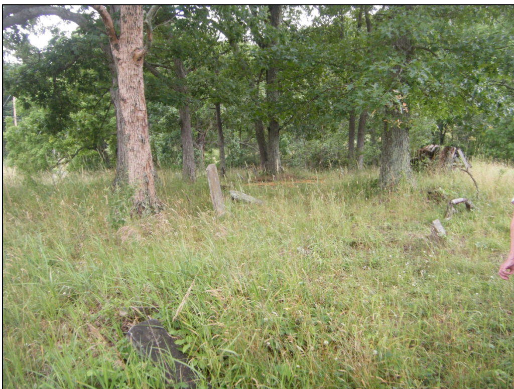
Photograph of 46-HM-267, looking east.