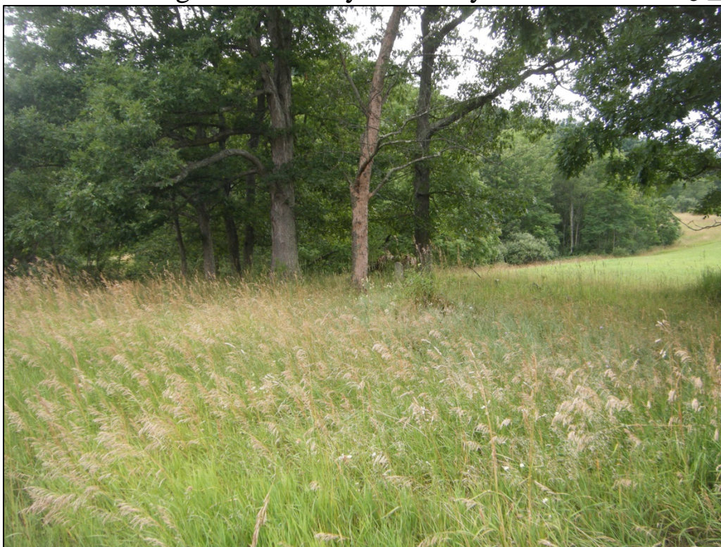
Photograph of 46-HM-267, looking southeast.