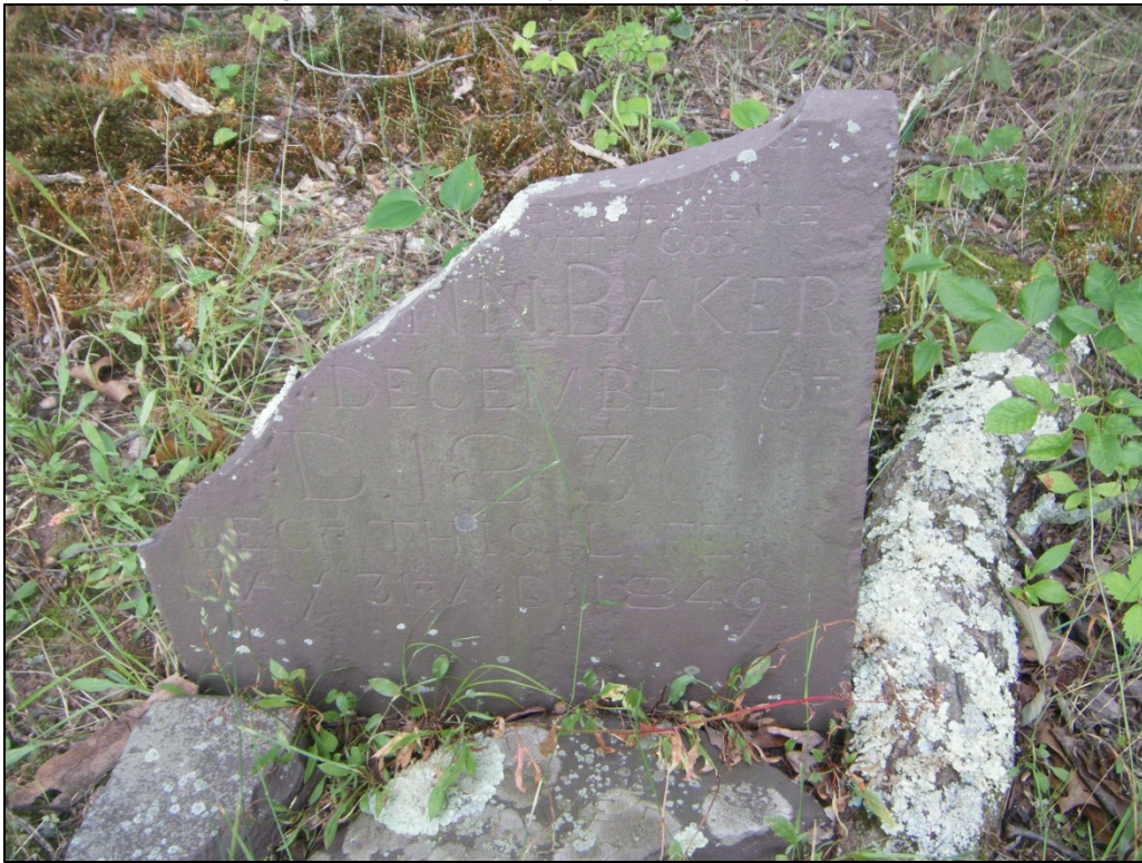
Photograph of a broken headstone documented at 46-HM-267.