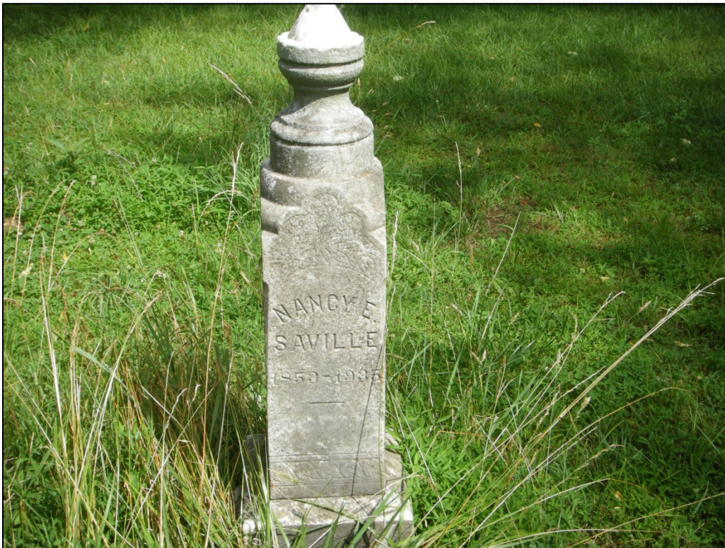
Photograph of a headstone/monument documented at 46-HM-268.