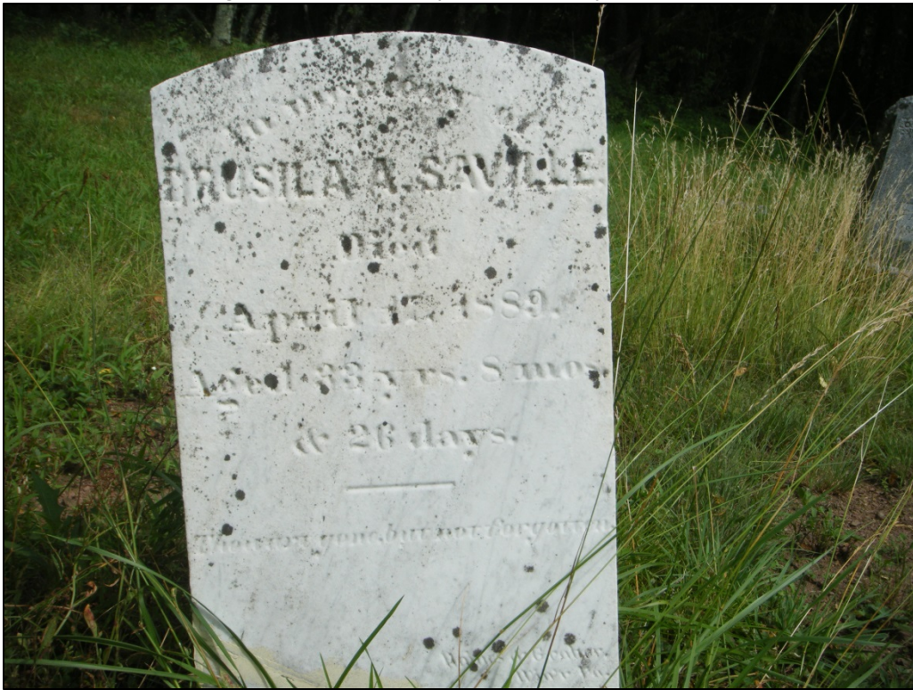
Photograph of an eroding headstone documented at 46-HM-268.