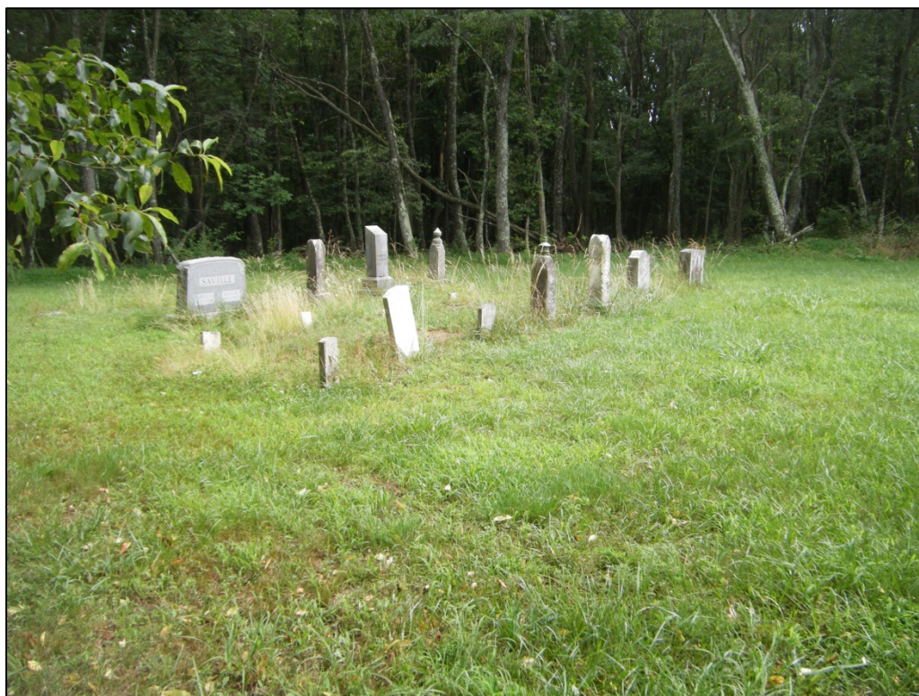
Photograph of 46-HM-268, looking southeast.