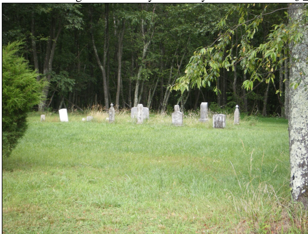
Photograph of 46-HM-268, looking east.