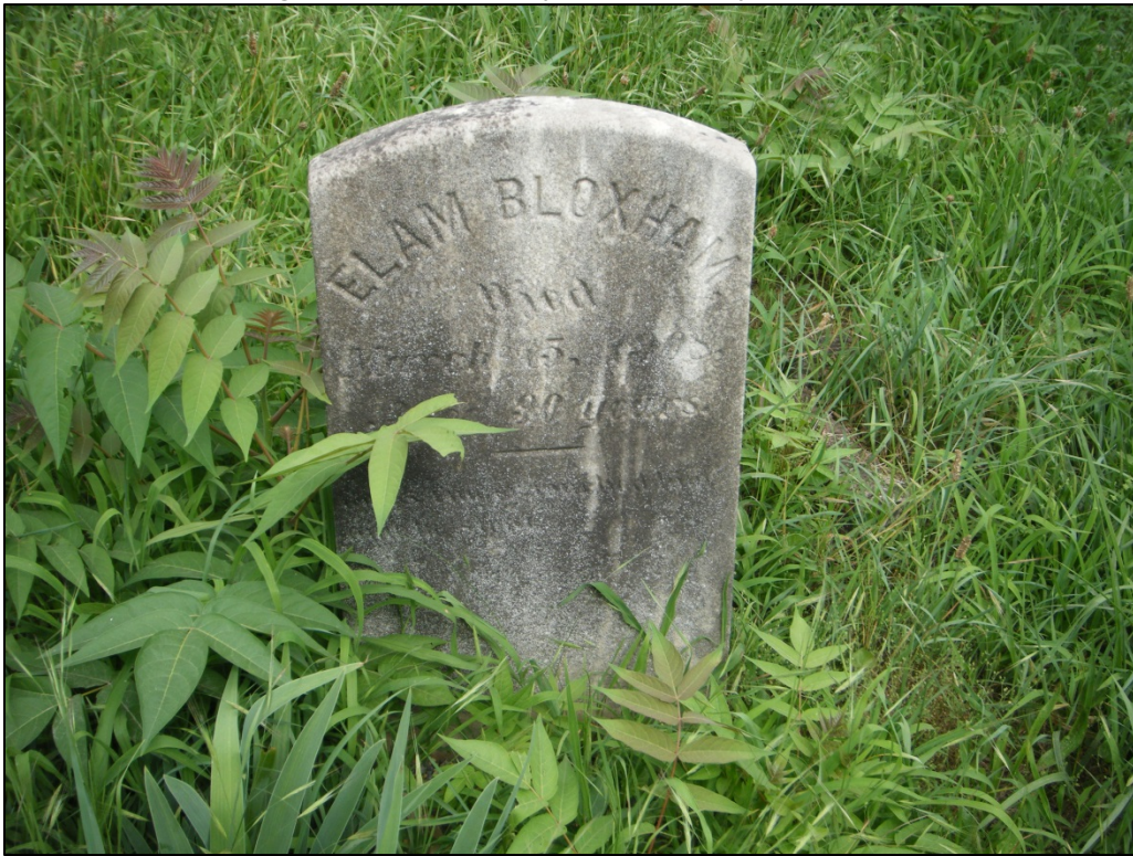
Photograph of a headstone documented at 46-HM-269.