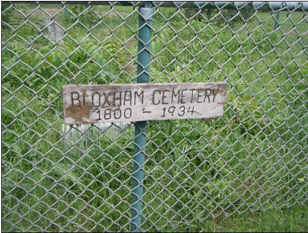
Photograph of the sign at the entrance of 46-HM-269, looking north.