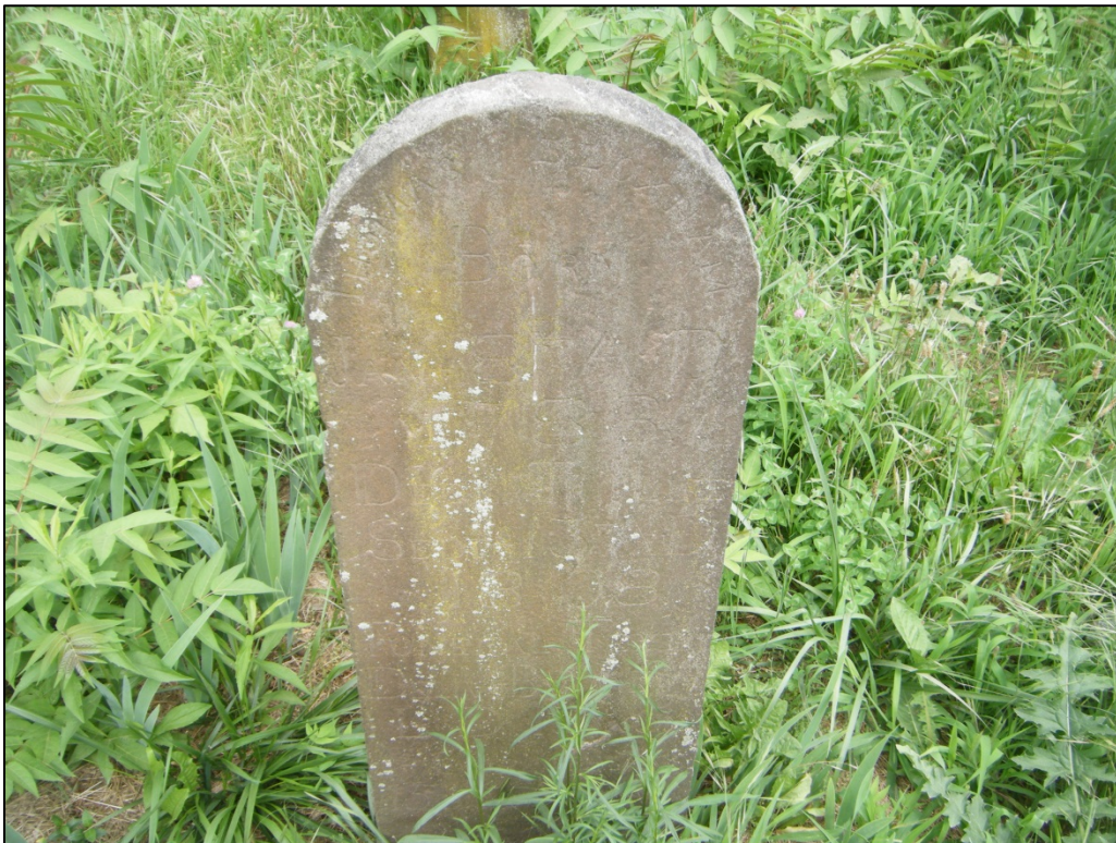
Photograph of an eroded headstone encountered at 46-HM-269.