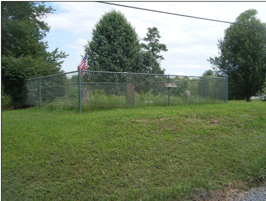
Photograph of 46-HM-269, looking north.