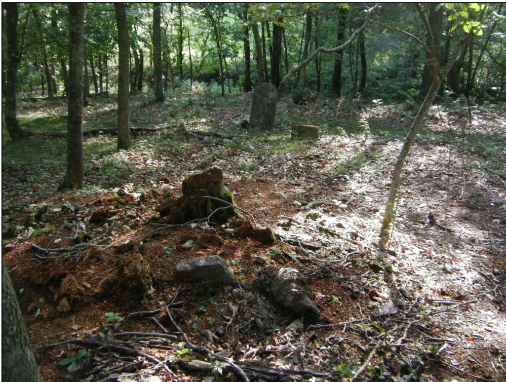
Photograph of 46-HM-271 showing fieldstone markers and possible grave depression.