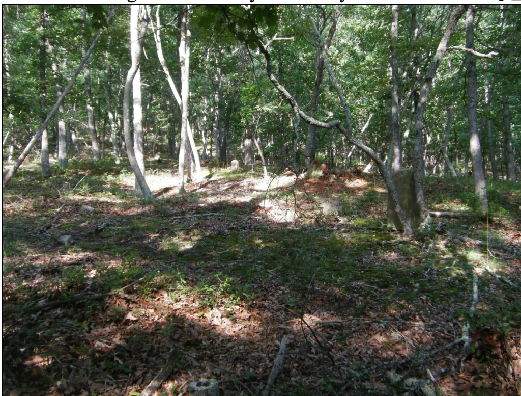
Photograph of 46-HM-271, looking northeast.