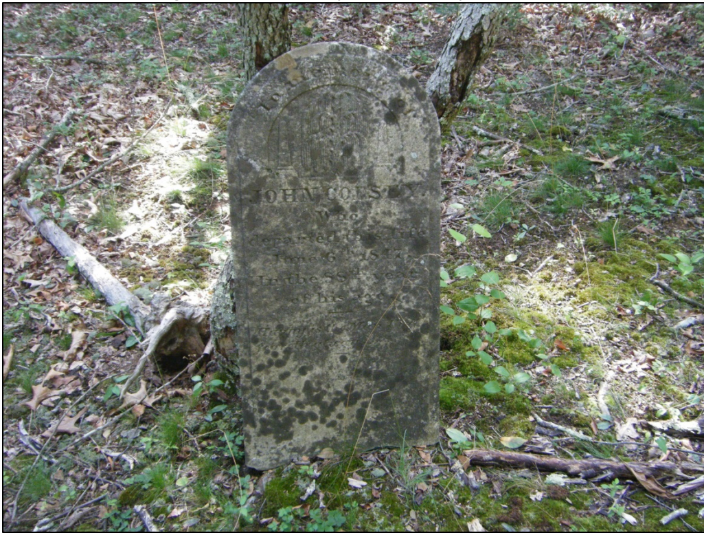
Photograph of a headstone documented at 46-HM-271.