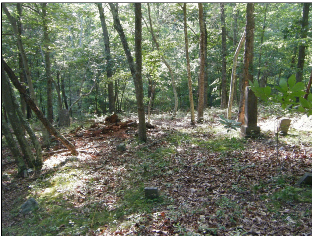
Photograph of 46-HM-271, looking southwest.