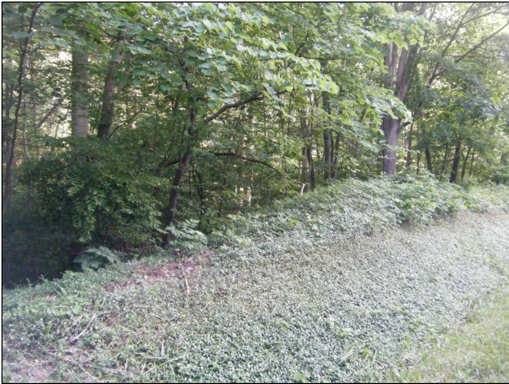
Photograph of the reported location of 46-HM-273, looking southwest.