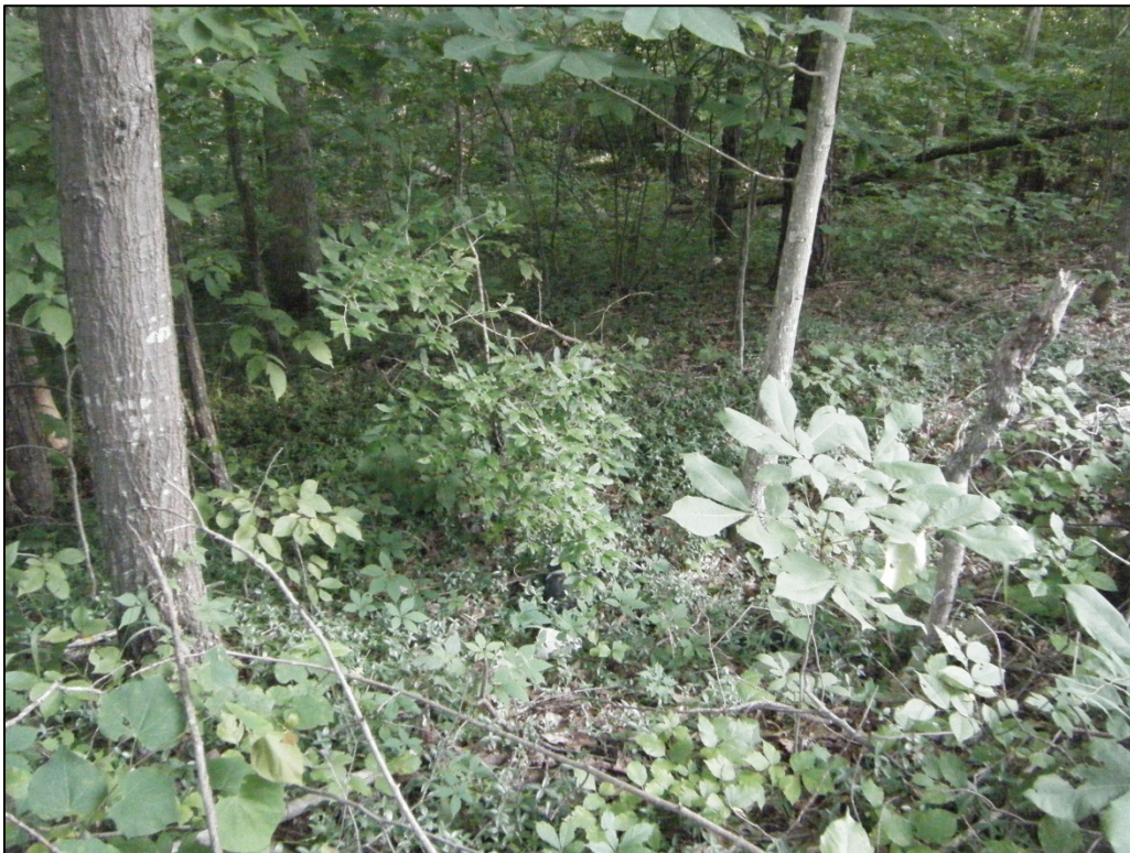
Photograph of possible grave depressions at 46-HM-273, looking west.