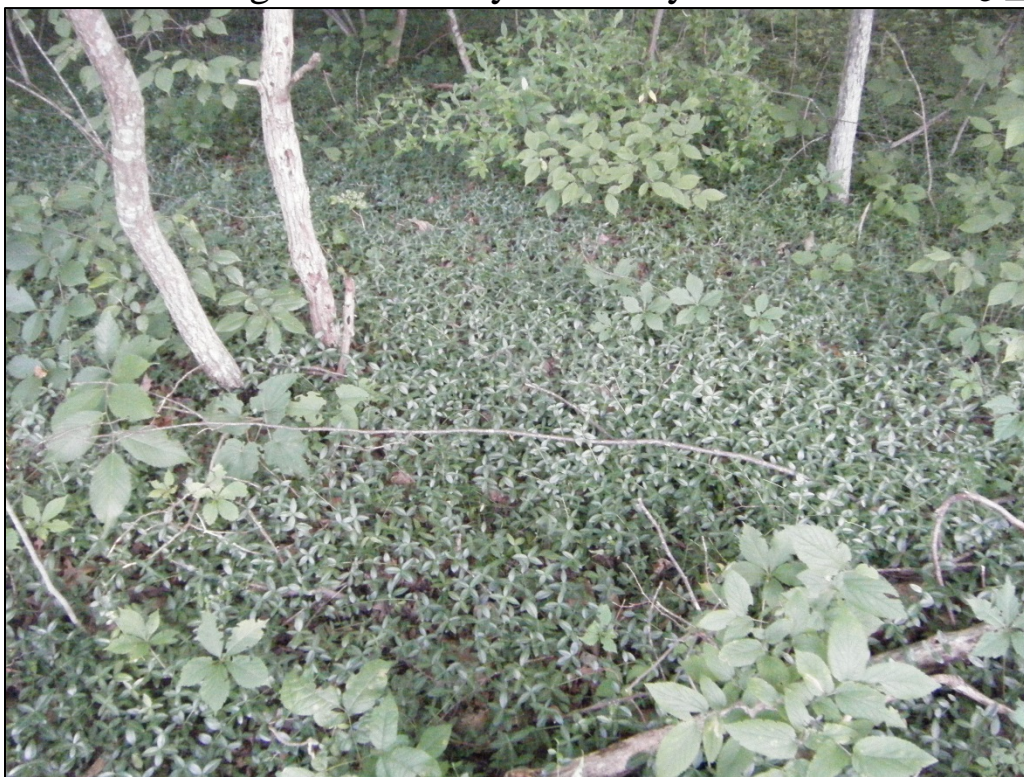
Photograph of possible grave depressions in the periwinkle encountered at 46-HM-273.