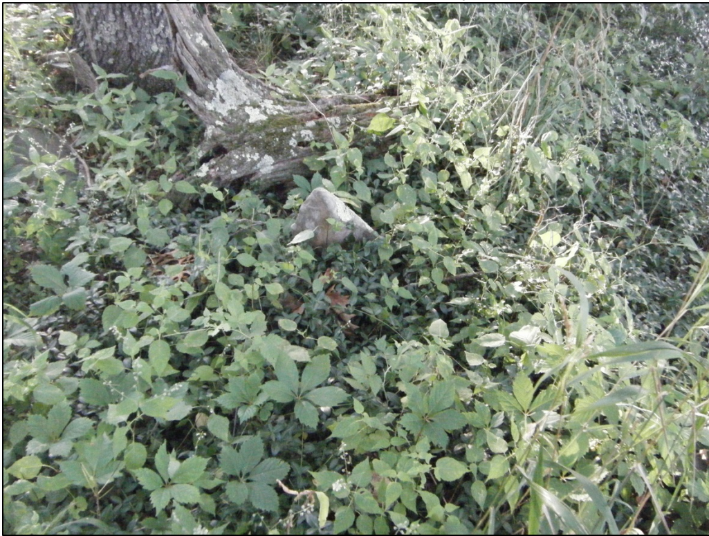
Photograph of a fieldstone marker encountered at 46-HM-274.