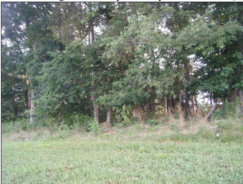
Photograph of 46-HM-274, looking west.