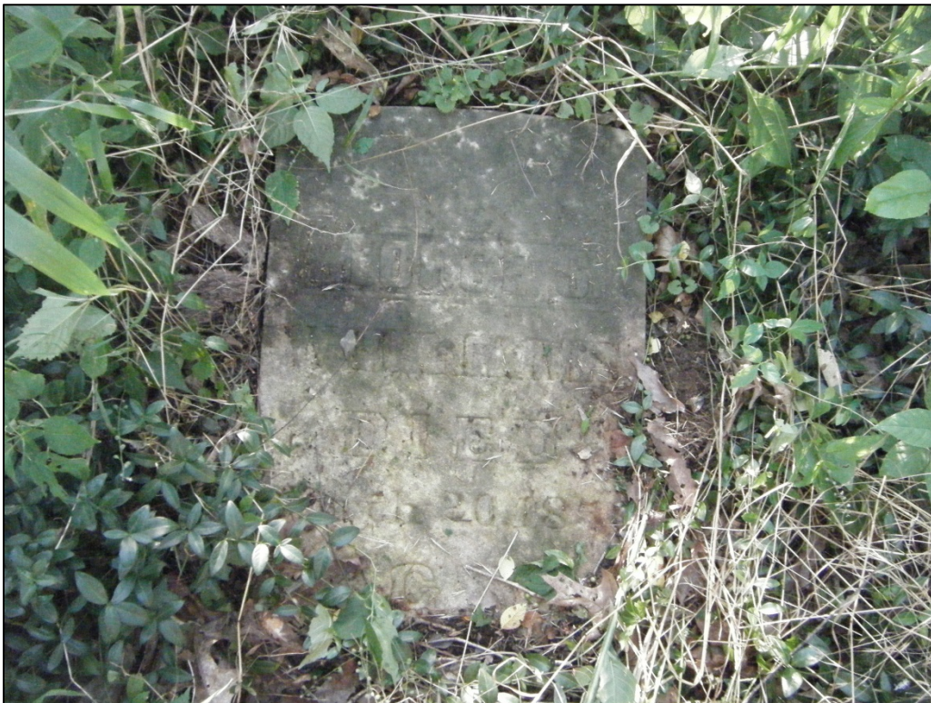
Photograph of a fallen and broken headstone documented at 46-HM-274.