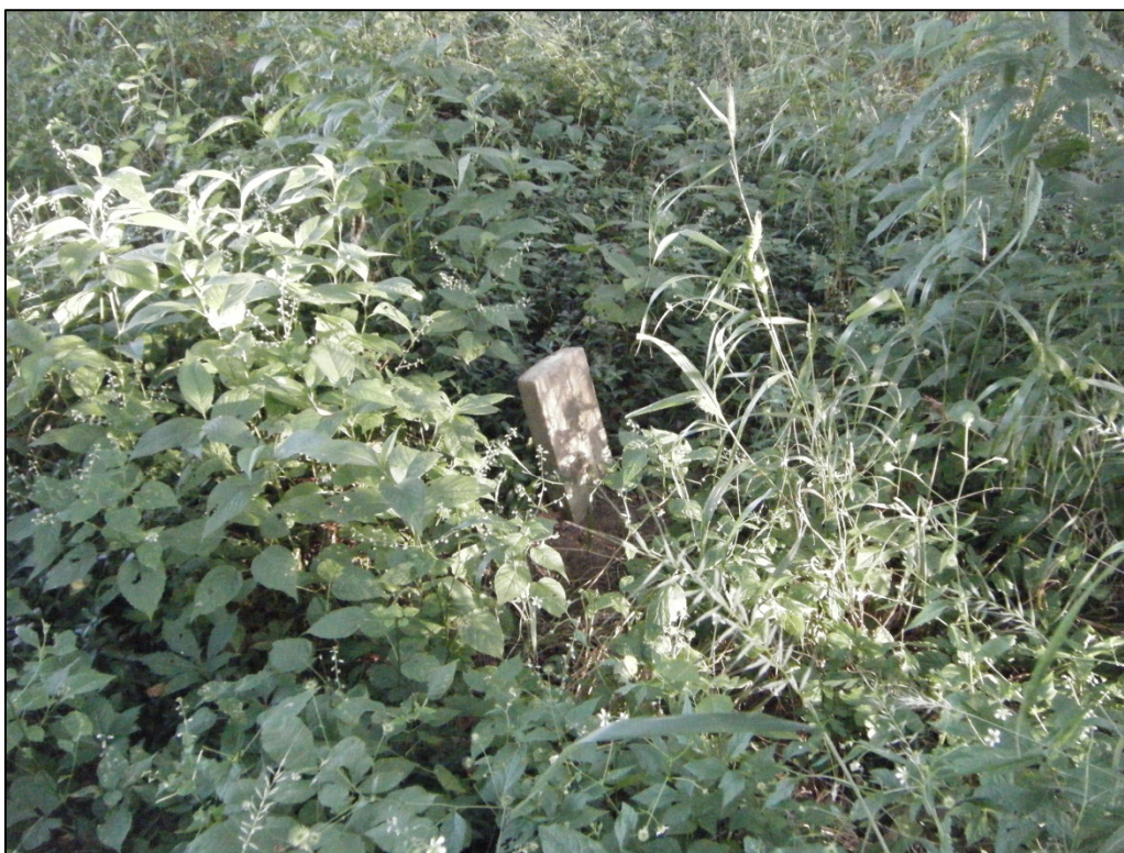
Photograph of a tilted headstone and overgrowth documented at 46-HM-274.