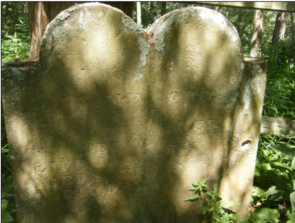
Photograph of a double headstone documented at 46-HM-276.