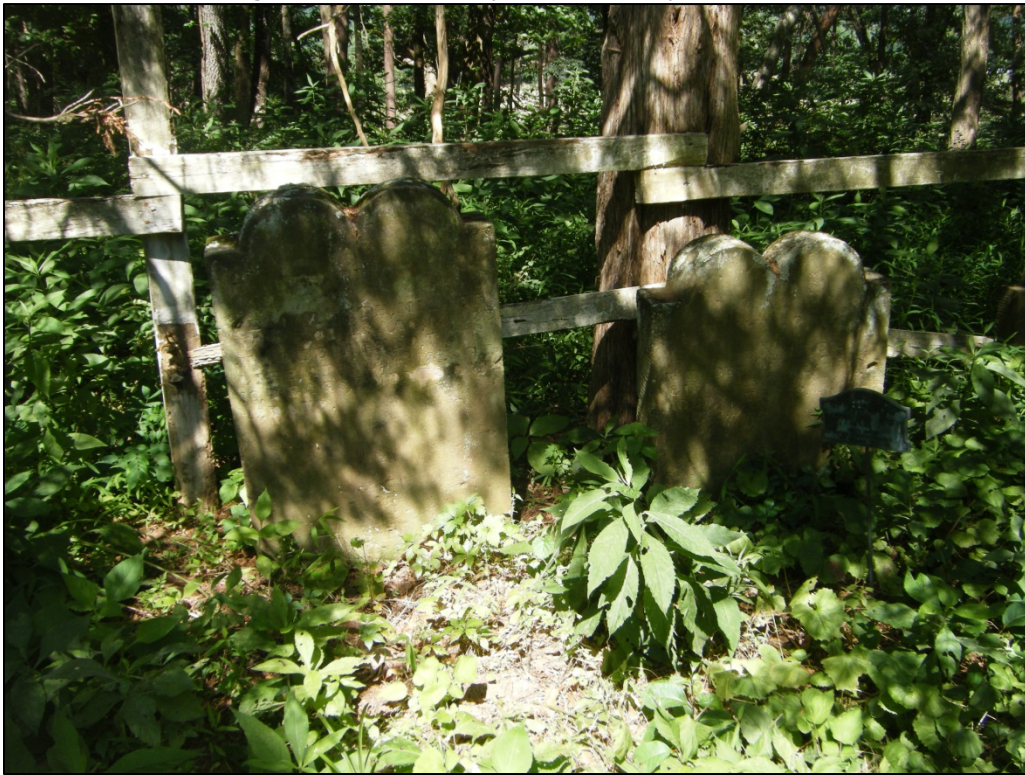
Photograph of a couple of headstone documented at 46-HM-276, looking west.