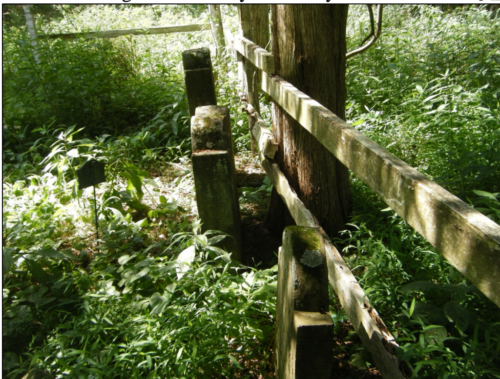
Photograph of a row of headstones documented at 46-HM-276, looking south.