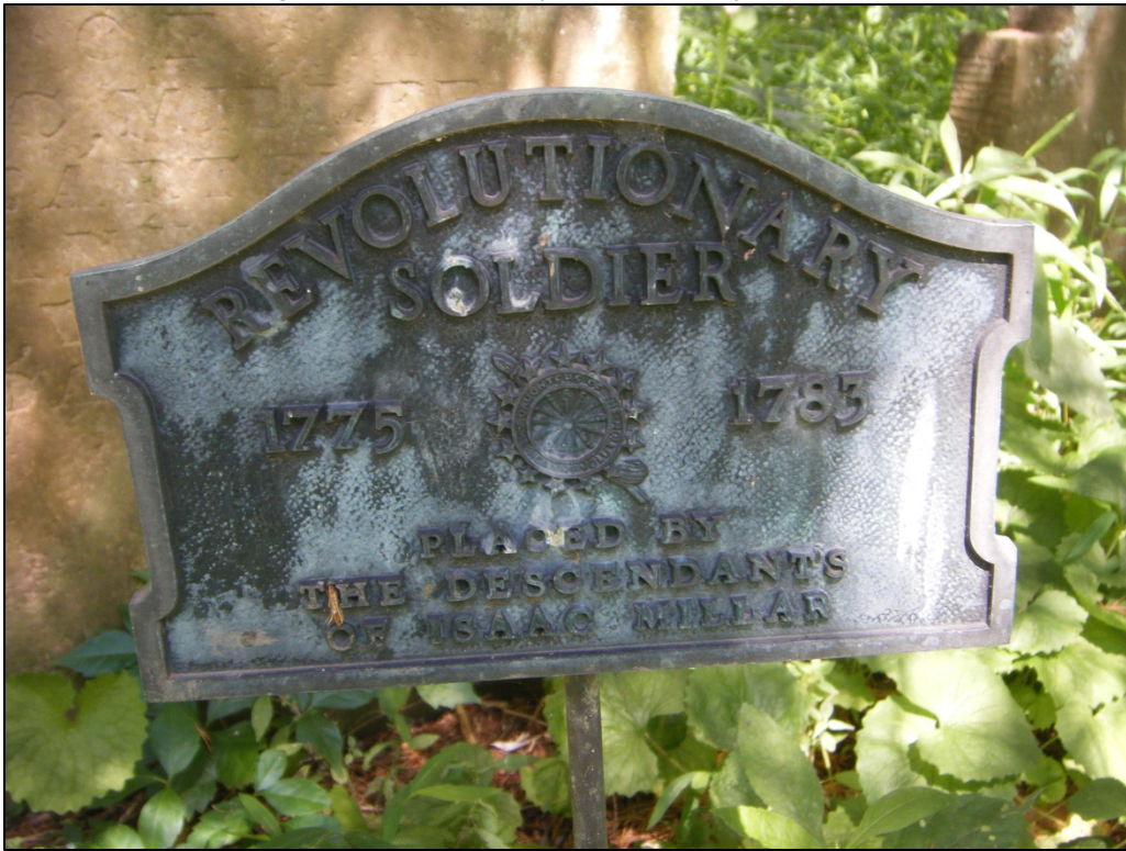
Photograph of a Revolutionary War marker documented at 46-HM-276.