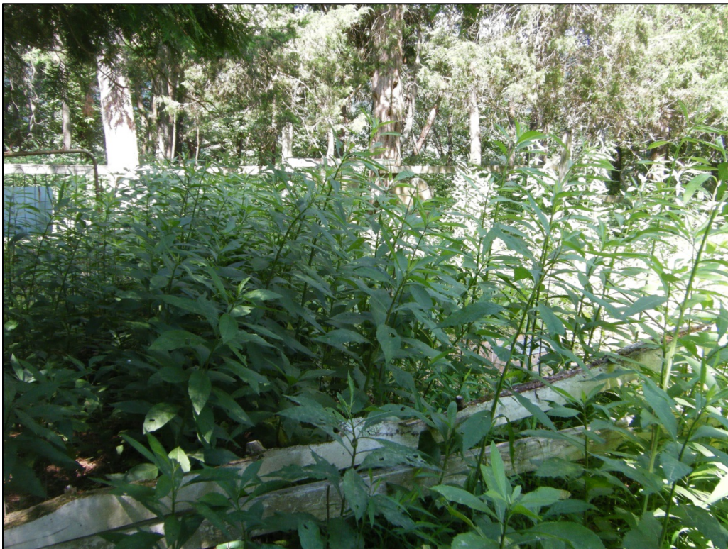
Photograph of 46-HM-276 showing overgrowth, looking northwest.