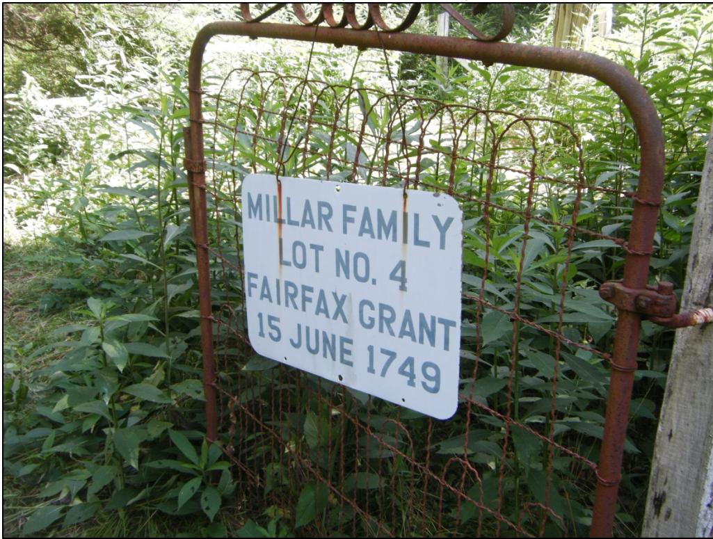
Photograph of the sign at the entrance gate to 46-HM-276, looking north.