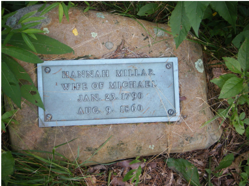
Photograph of a plaque documented at 46-HM-276.