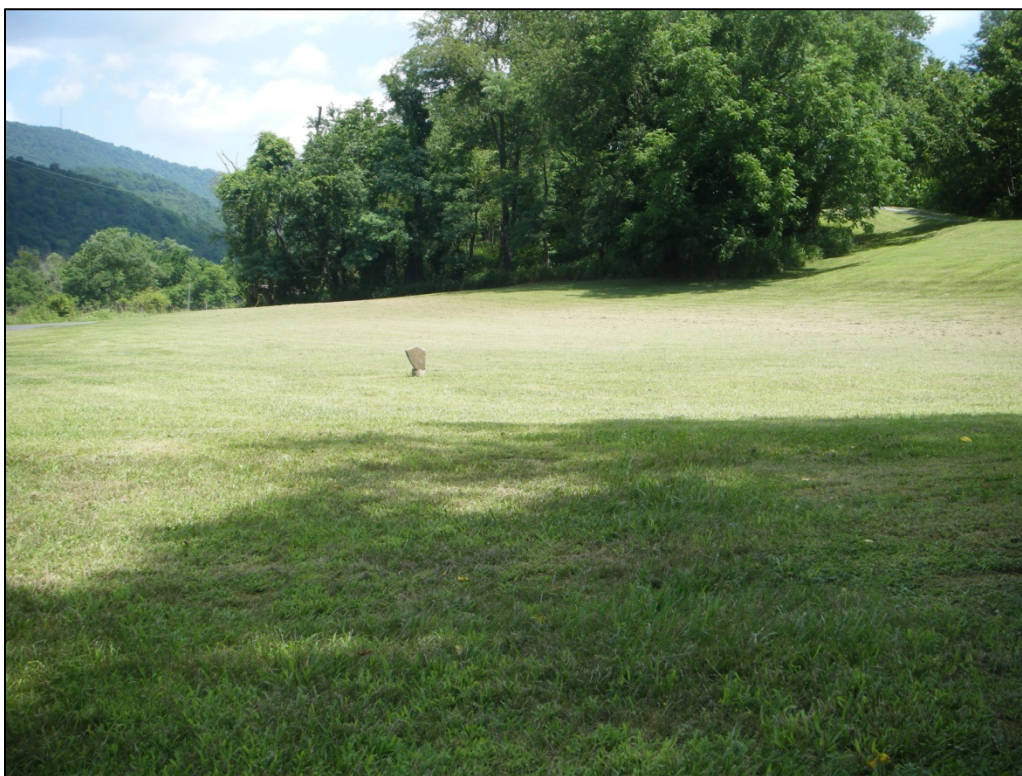
Photograph of 46-HM-277, looking north.