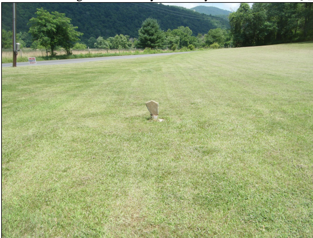
Photograph of 46-HM-277, looking northwest.