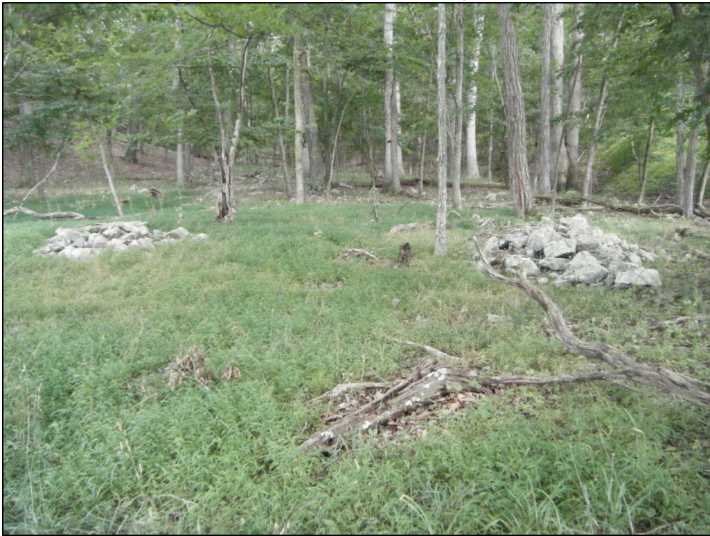
Photograph of 46-HM-283, looking southeast.