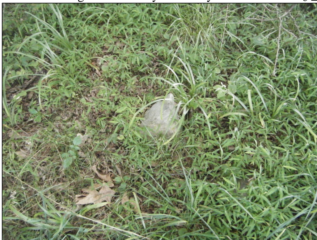
Photograph of a footstone documented at 46-HM-283.