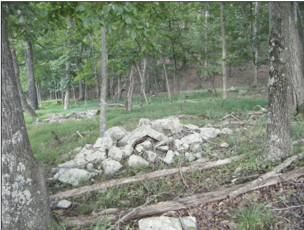
Photograph of the location of two possible graves at 46-HM-283, looking north.