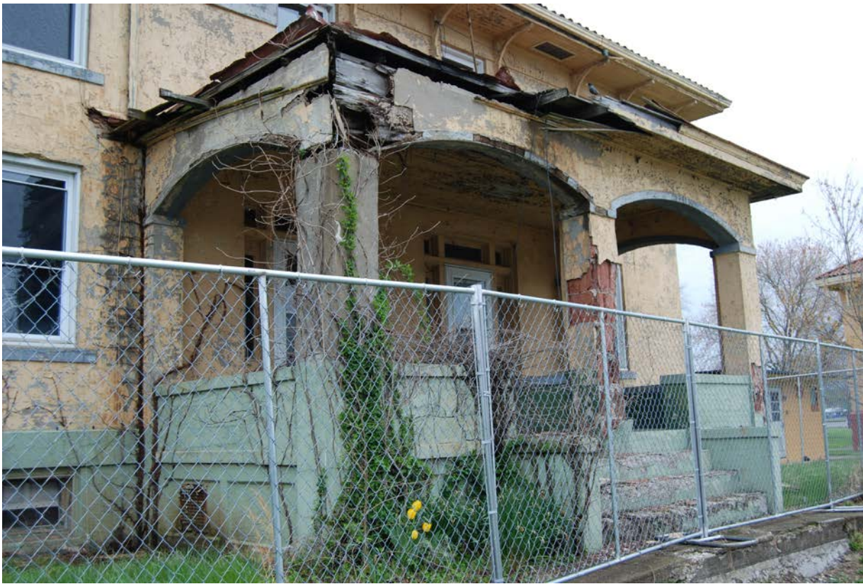
River facing porch (westward)