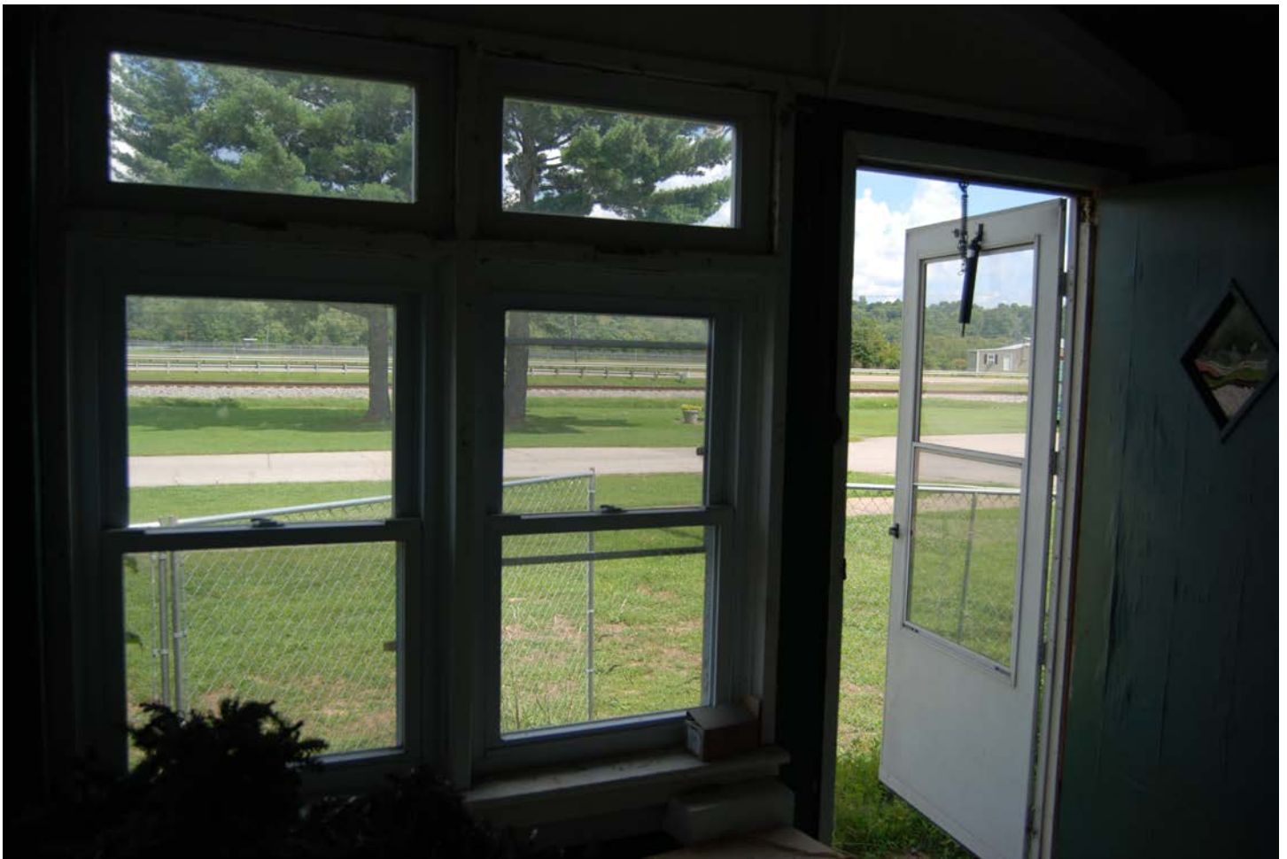
Northern unit eastern facing exit 1 st floor