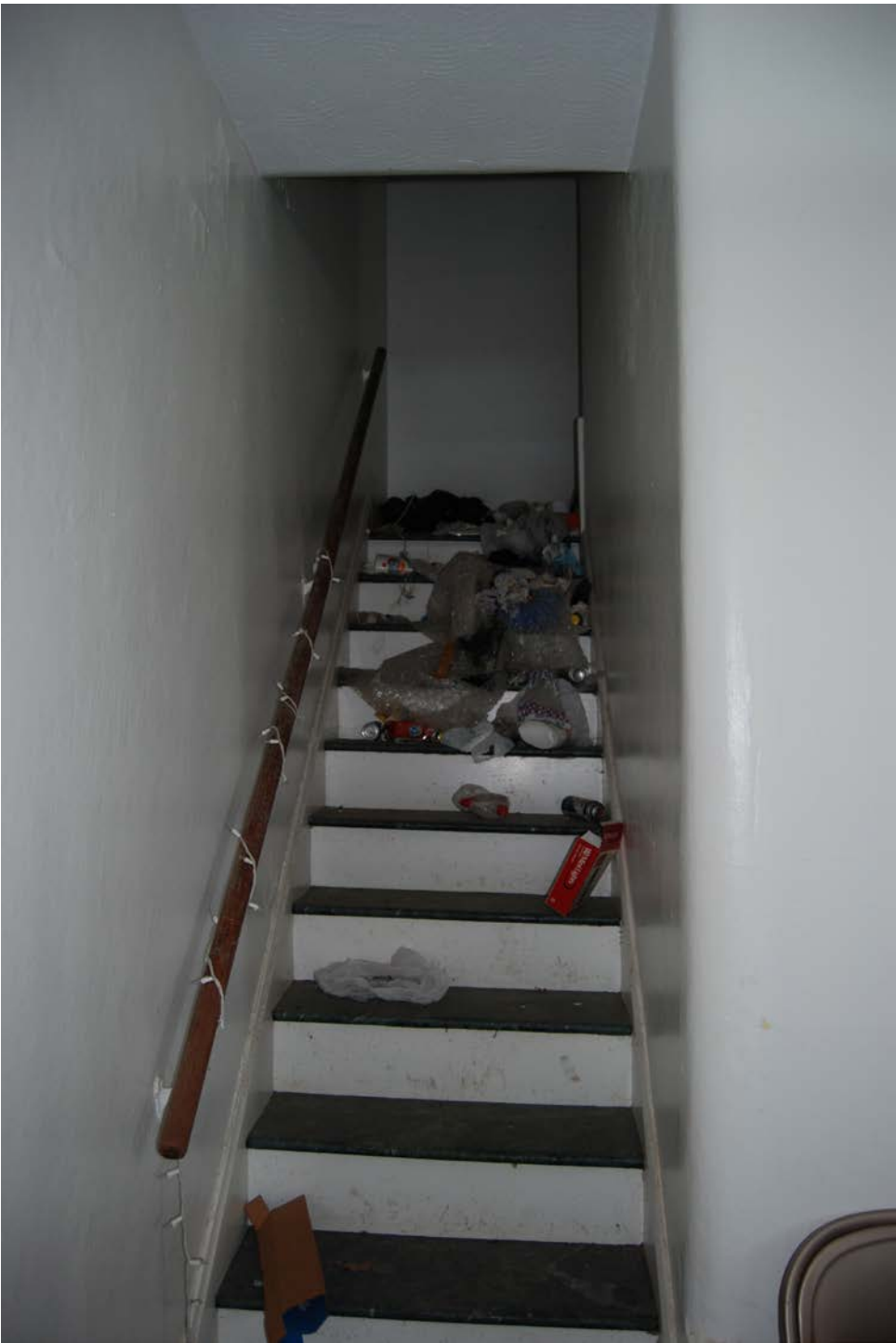
Staircase to second floor (southern unit)