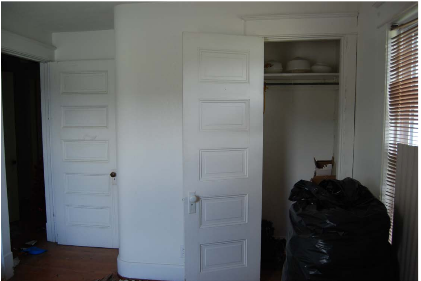
Bedroom 2 facing river and south (southern unit)