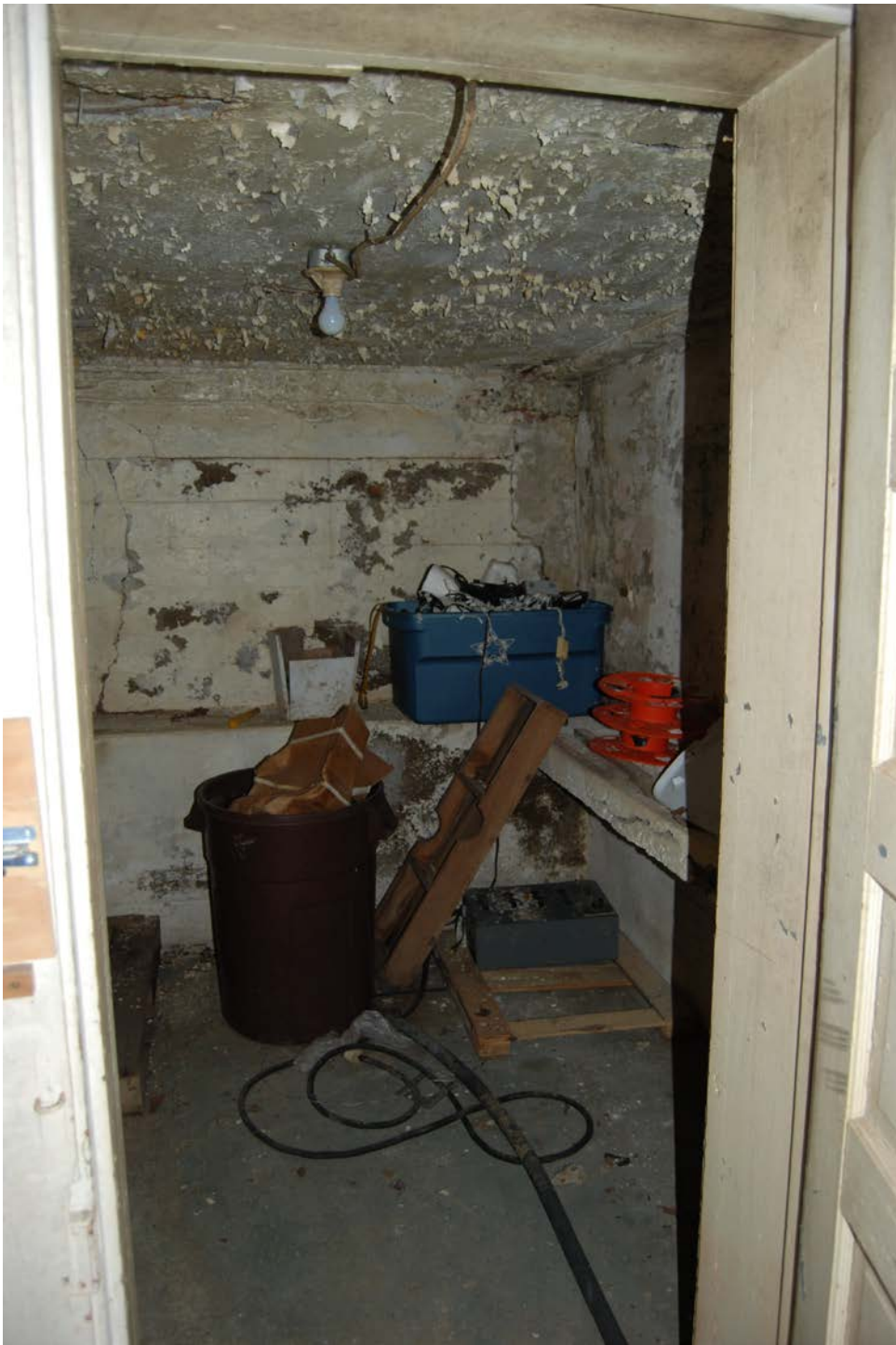
Basement storage under the westward facing porch in southern unit