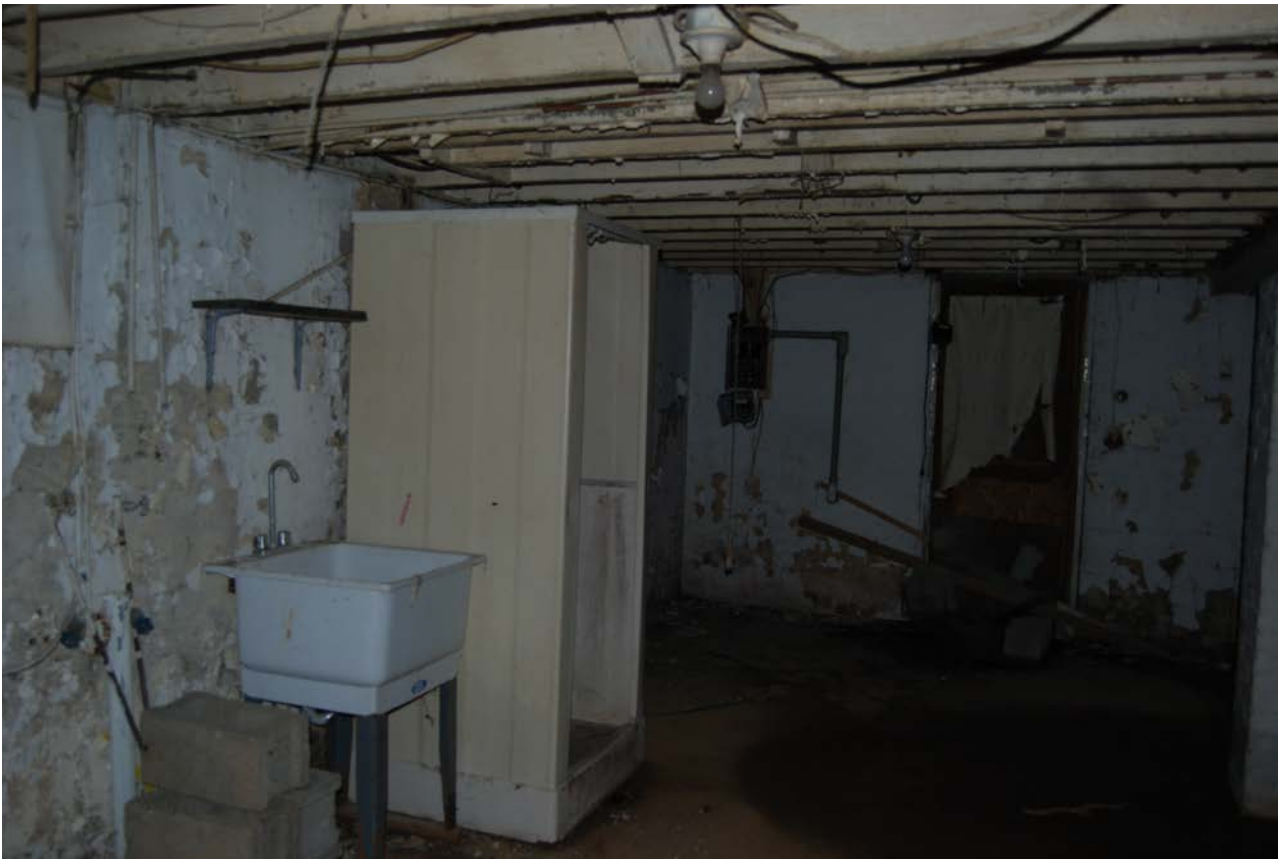
East wall of basement in northern unit