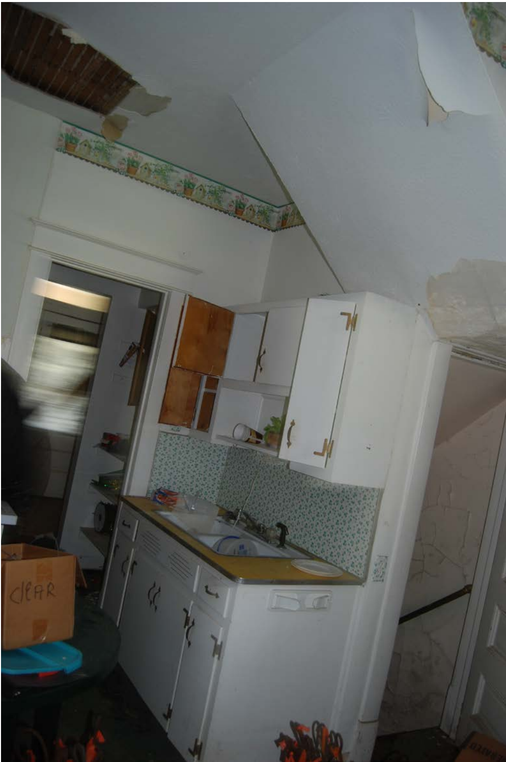
First floor kitchen southern unit