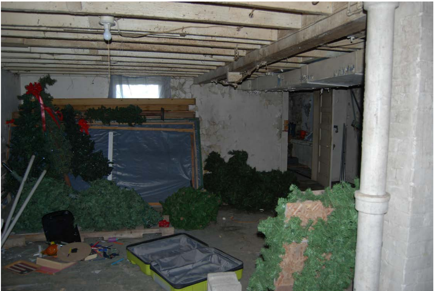
Basement facing south in southern unit