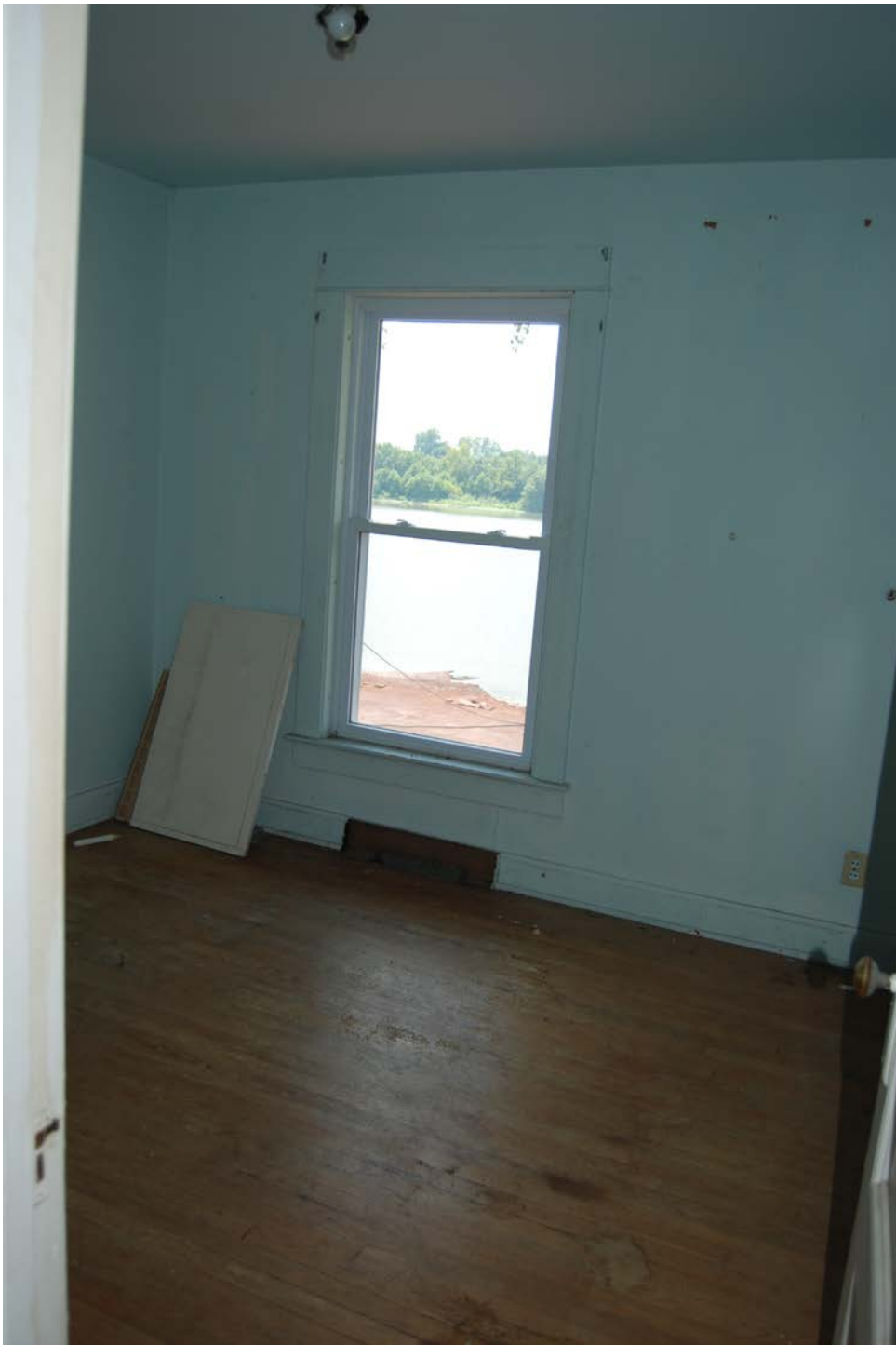
Bedroom 2 facing river in northern unit