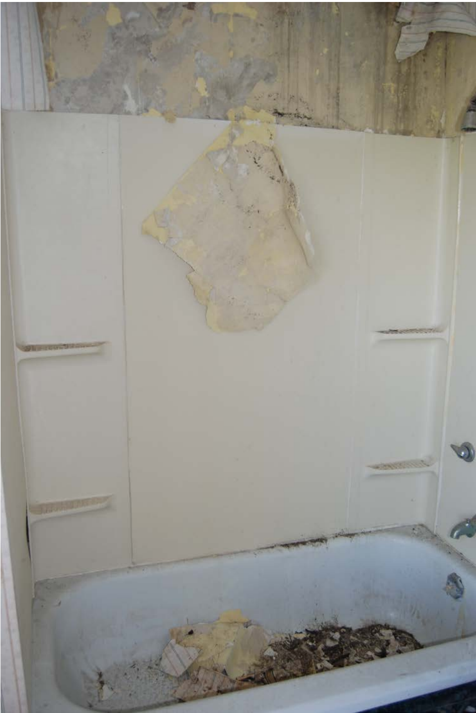
Bathroom facing east in northern unit