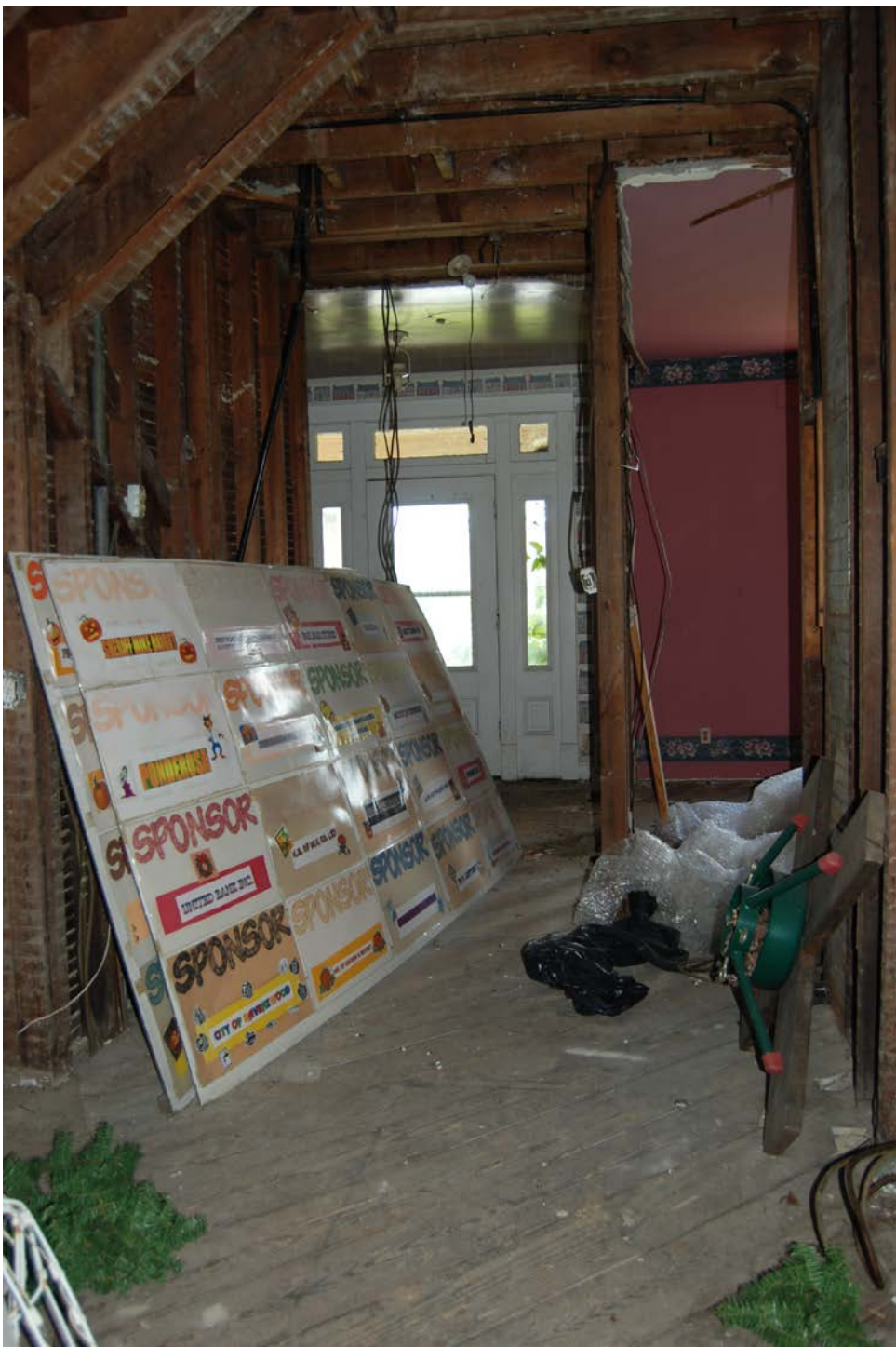
Kitchen area stripped of hardwood floors in northern unit