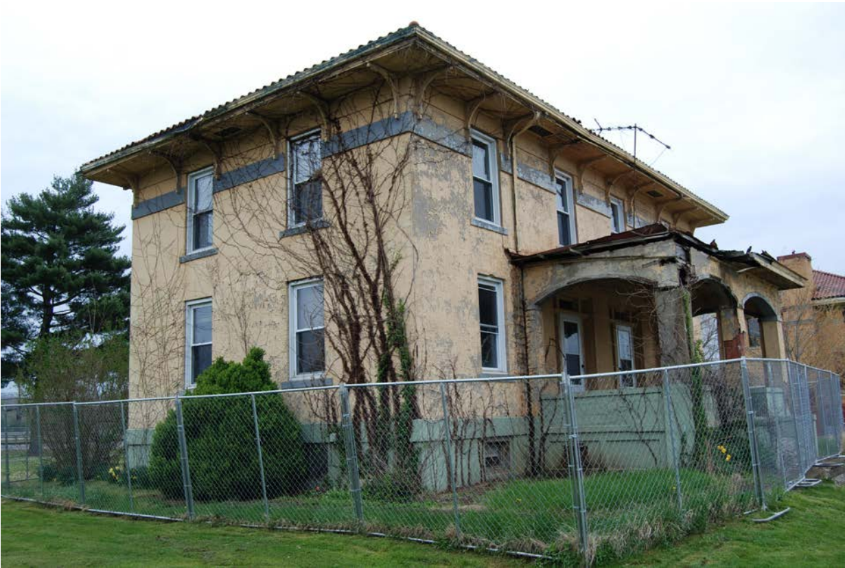
Northwest Corner (river facing)