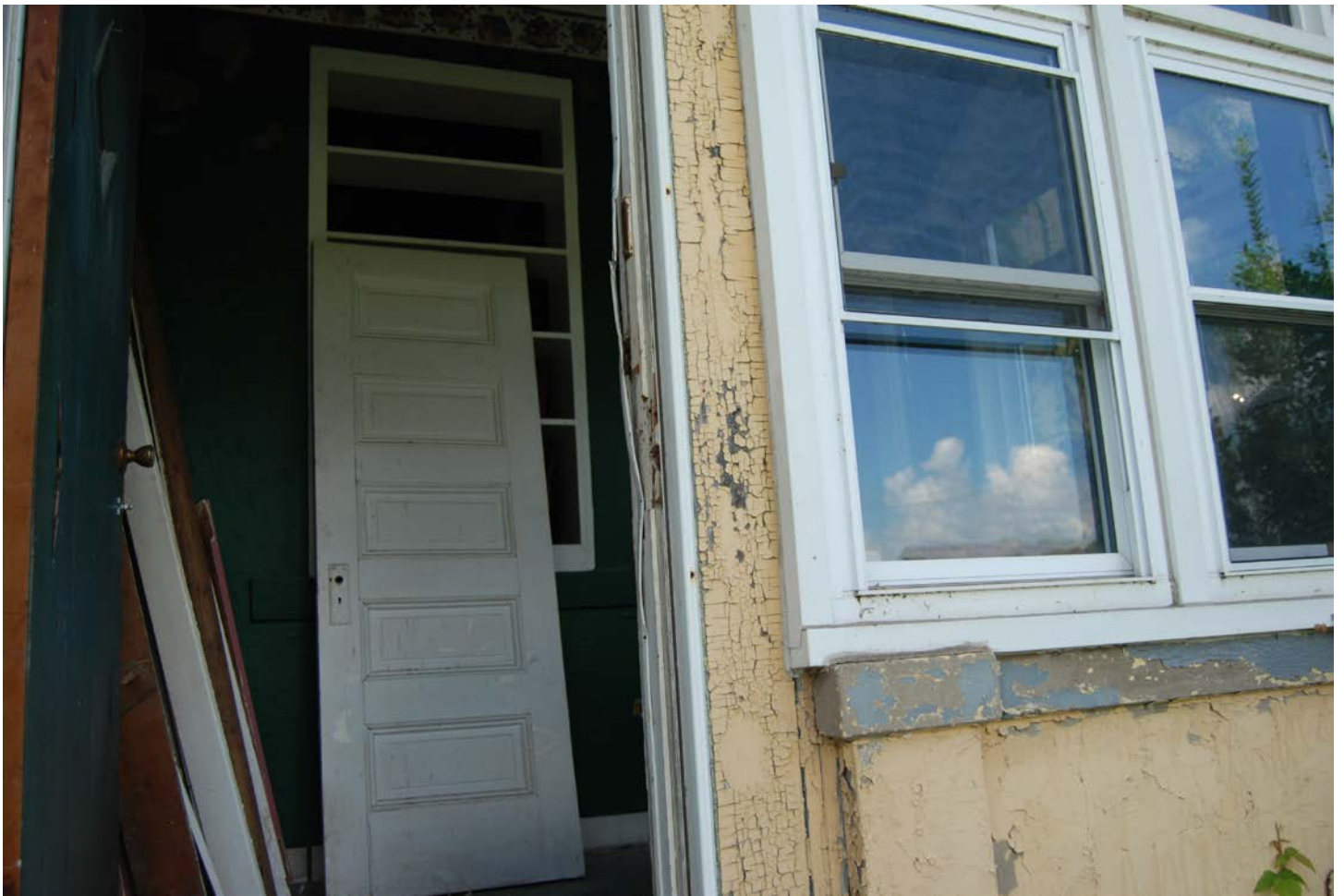
Entering northern unit from street side (east)