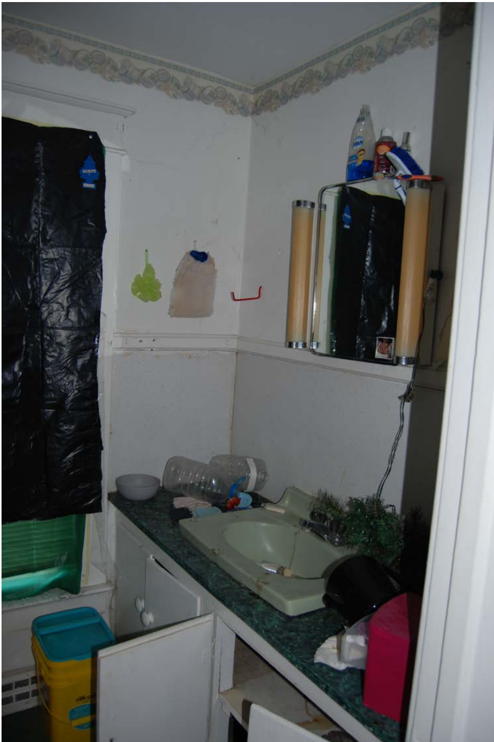
Second floor bath (southern unit)