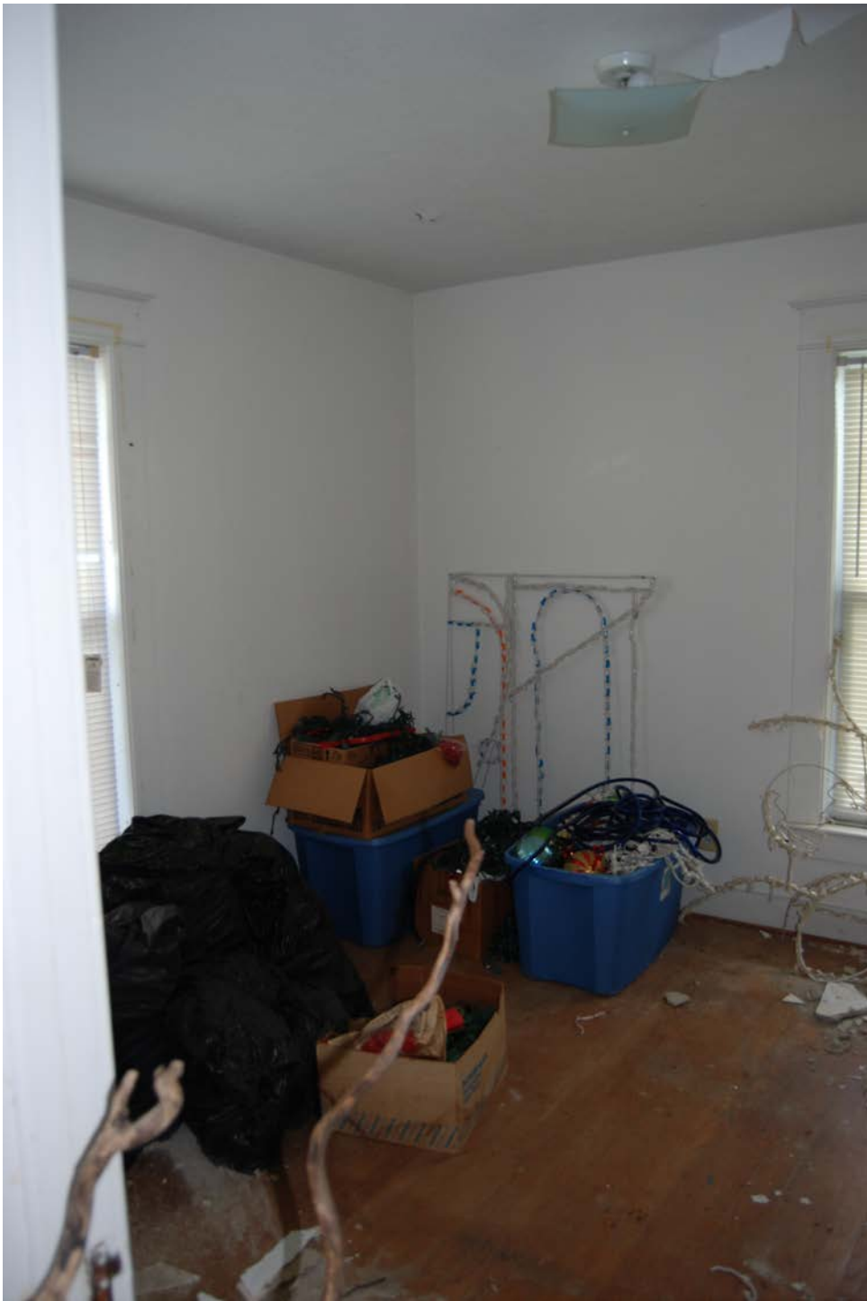
Bedroom 1 facing street southern unit