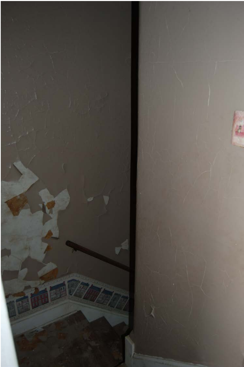
Looking down stairs from second floor in northern unit