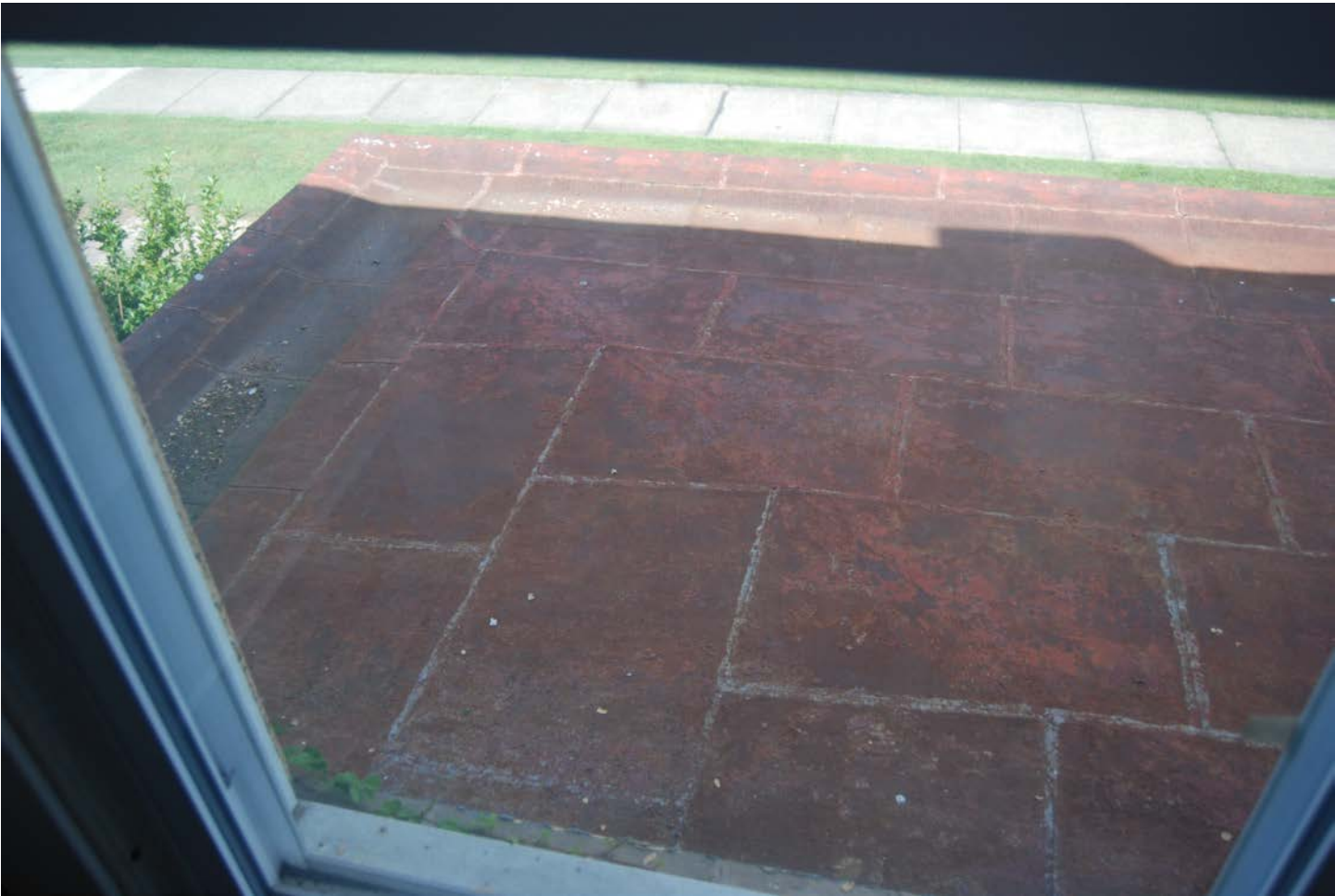
View of the roof of the river facing porch (taken from second floor) in northern unit