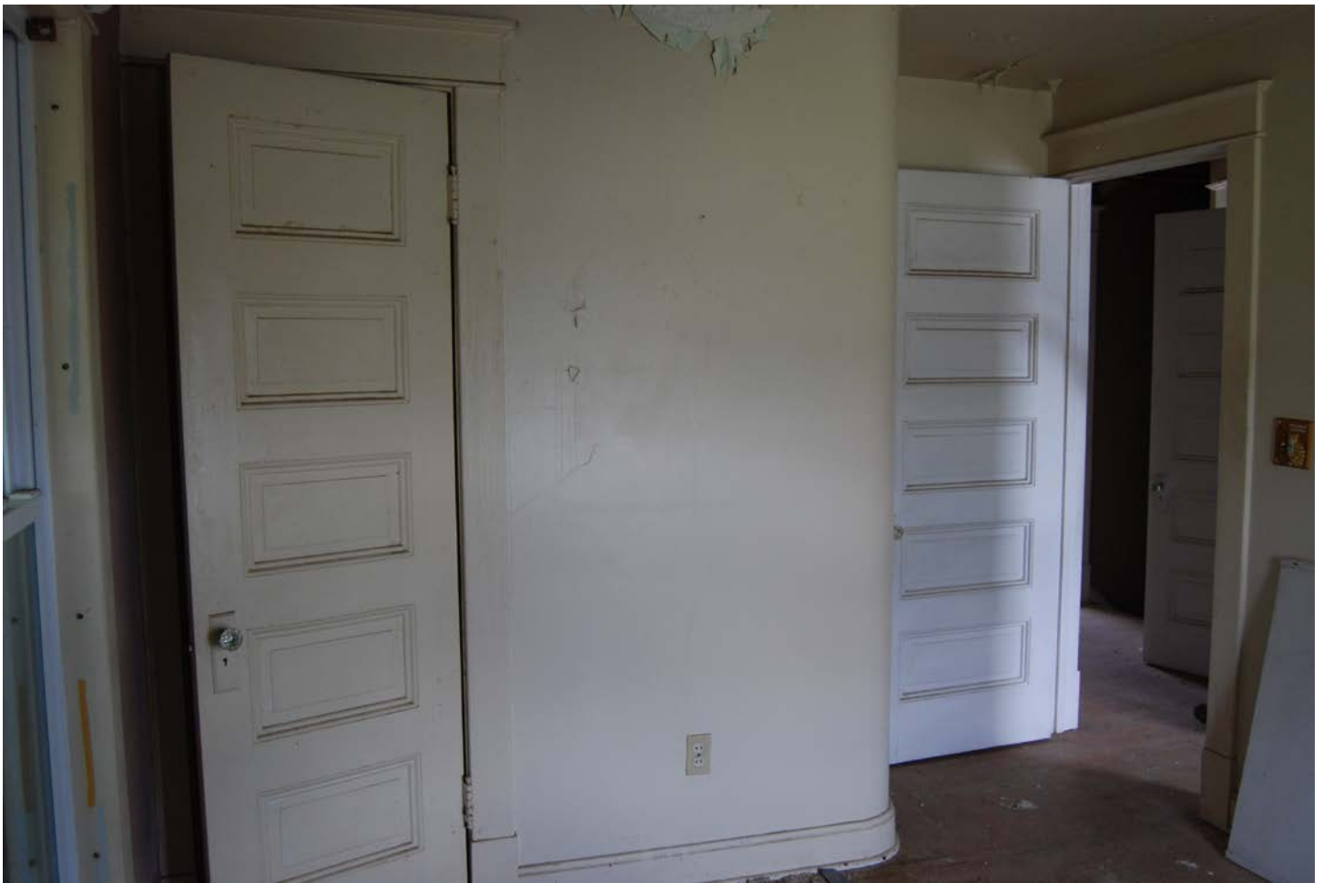
Bedroom 3 facing river in northern unit