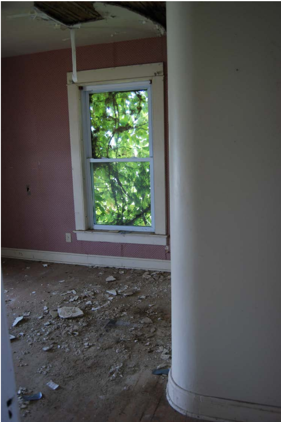
Bedroom 3 facing river in northern unit