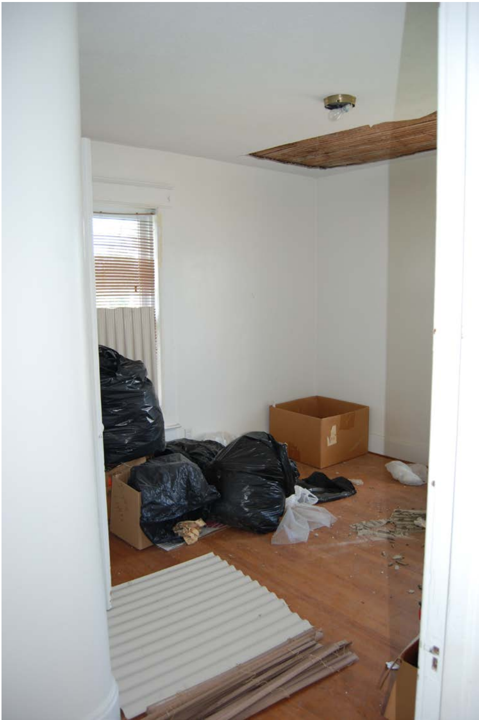
Bedroom 2 facing river southern unit