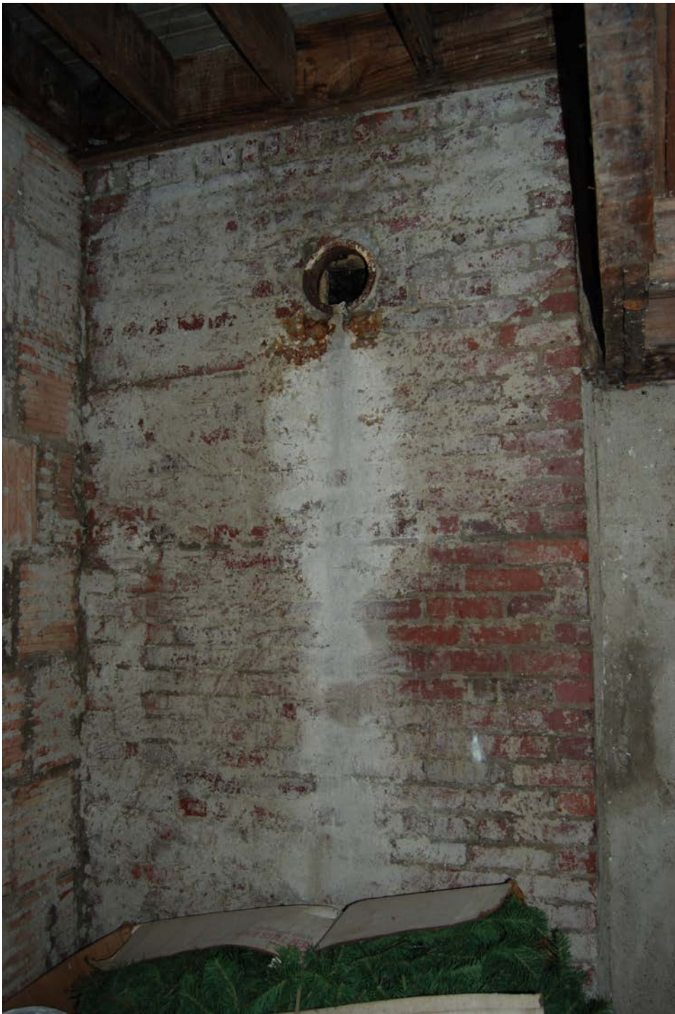
Chimney interior in northern unit on the first floor. Note glazed block exterior wall construction.