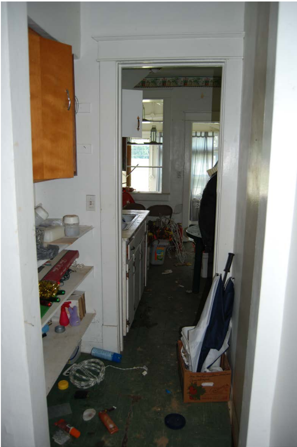
Pantry area to kitchen first floor southern unit