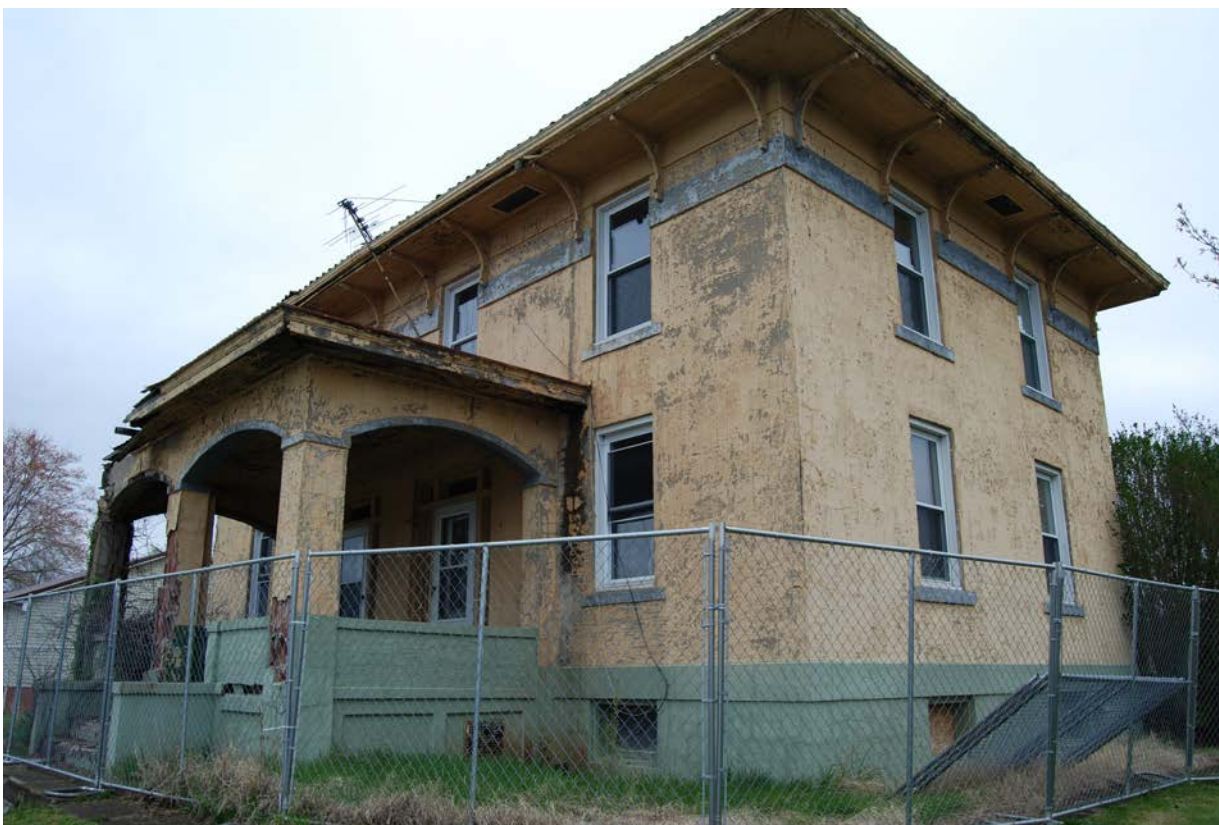
Southwest Corner (river facing)