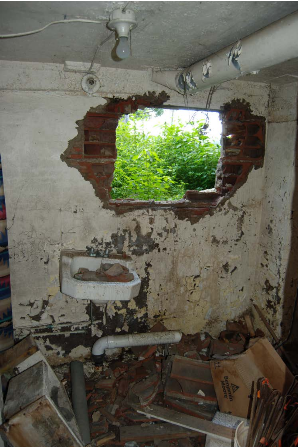
Basement facing street southern unit