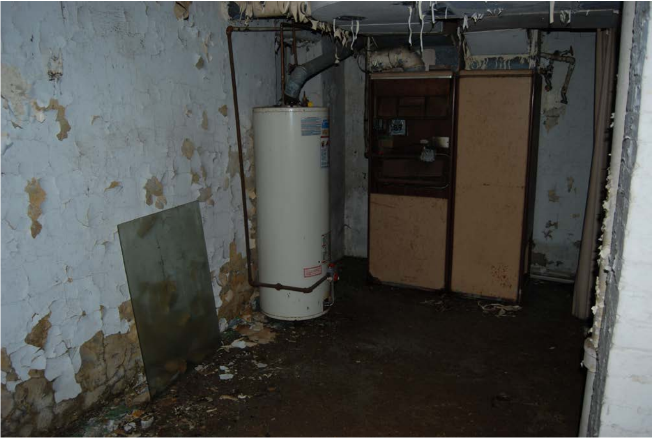
Basement east wall in northern unit