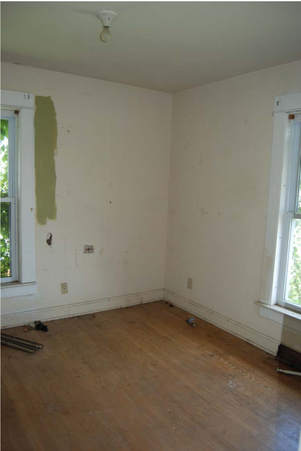
Bedroom 1 facing east in northern unit