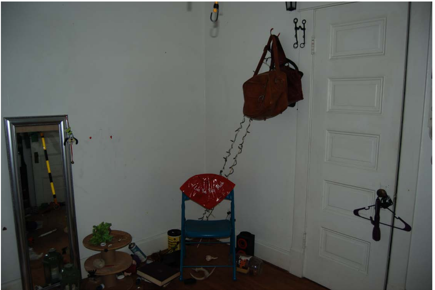
Bedroom 3 facing river southern unit