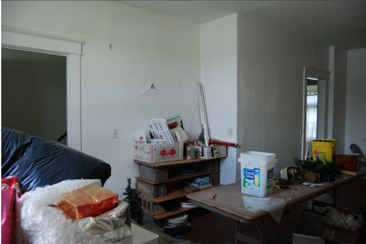
First floor living (southern unit)