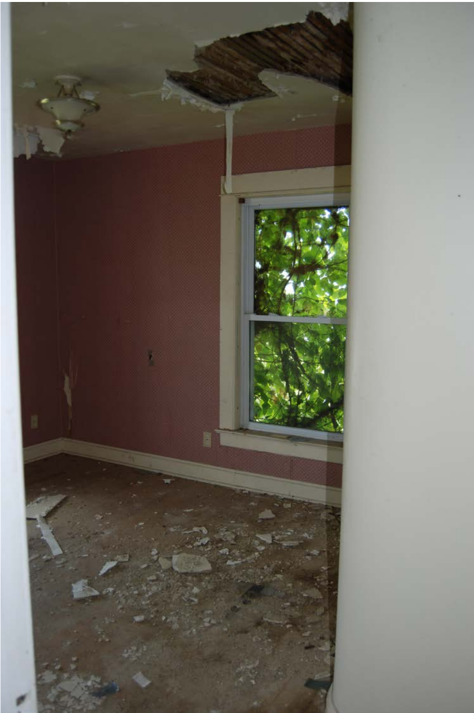
Bedroom 3 facing river in northern unit