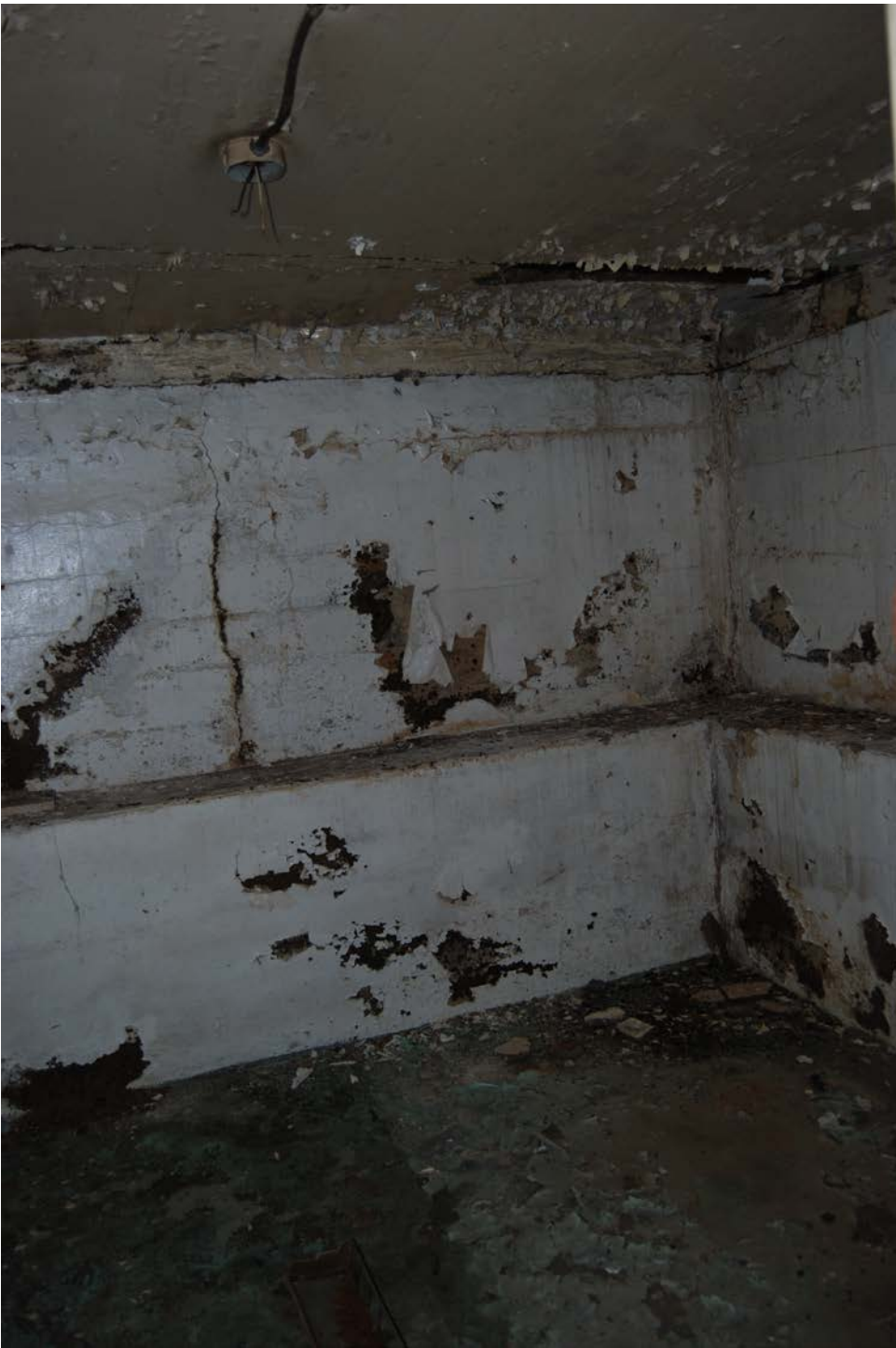
Storage room in basement under the river facing porch (northern unit)