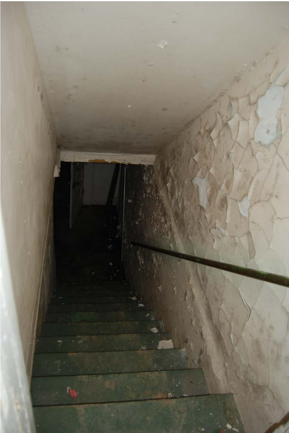
Basement stairs southern unit