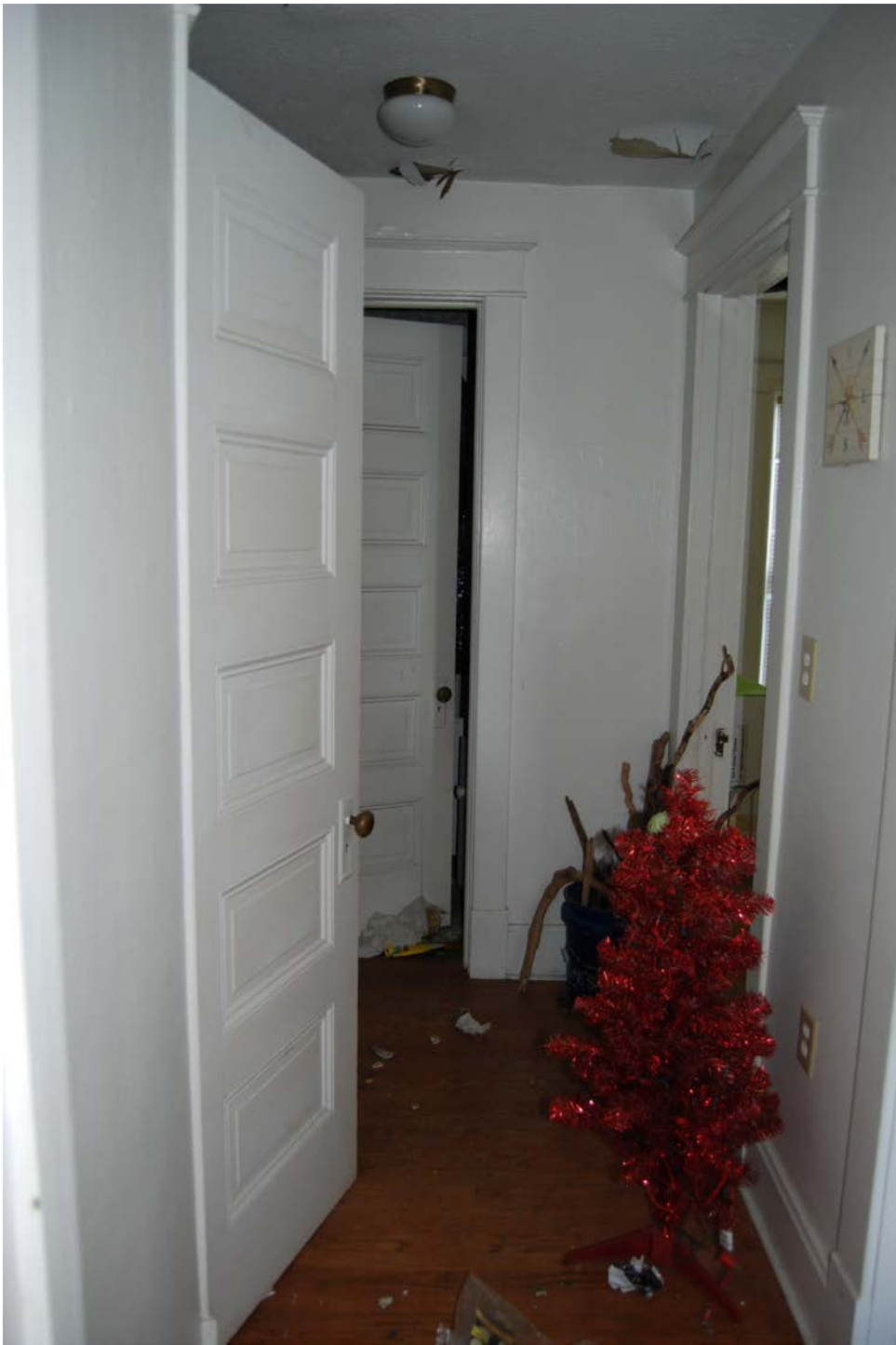
Second story hall (southern unit)