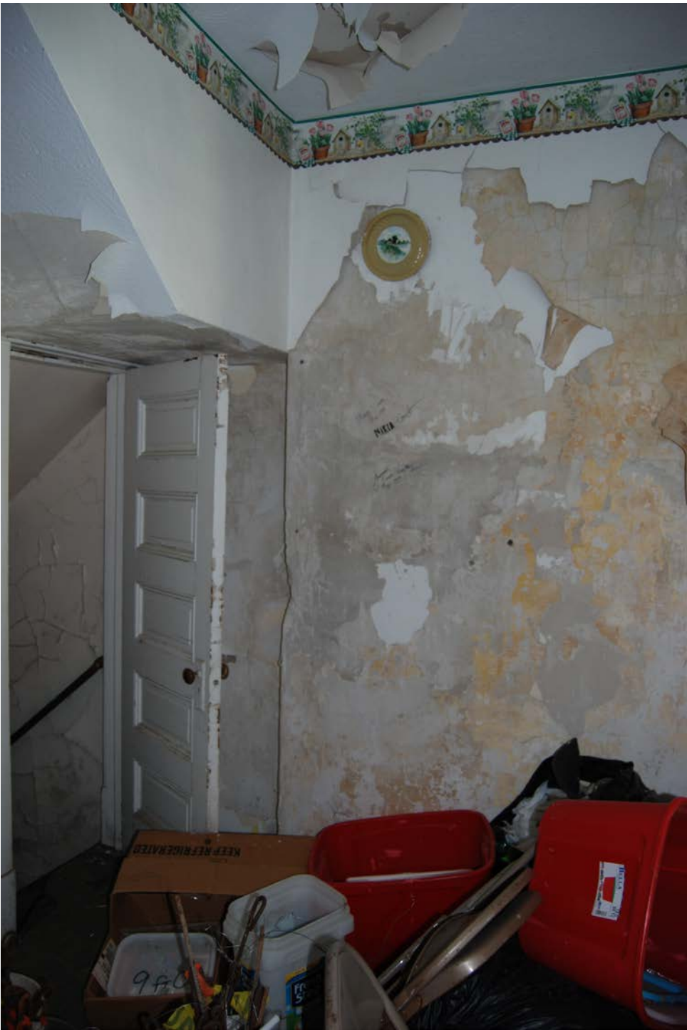
First floor dining area to basement steps (southern unit)