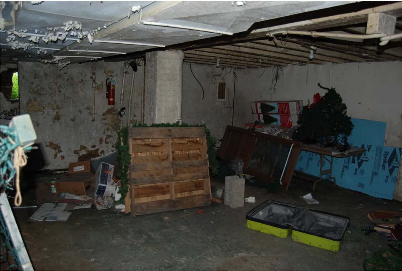
Basement southern unit facing street