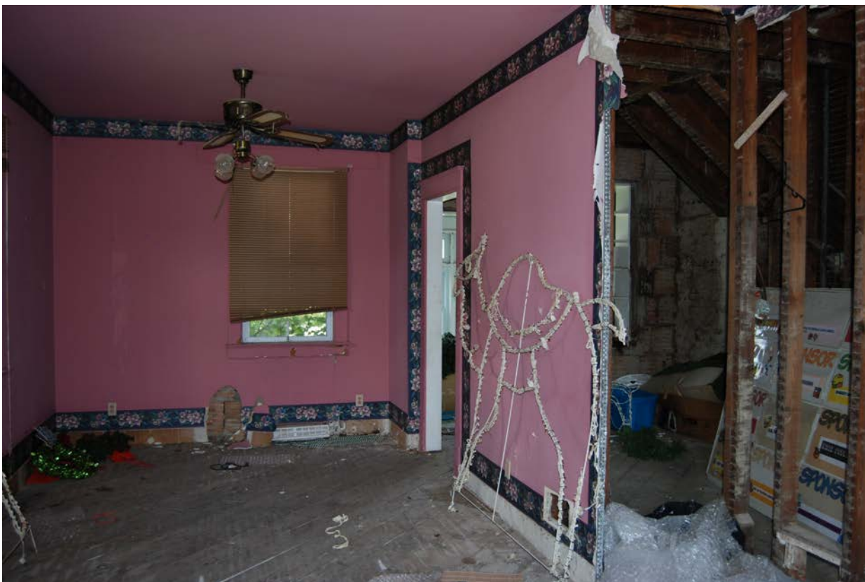
Living room looking toward east in northern unit