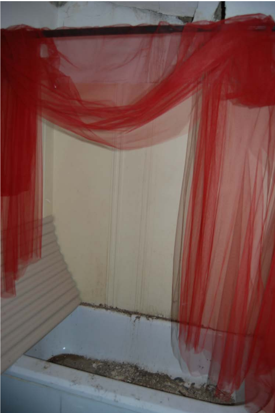
Second floor bath (southern unit)