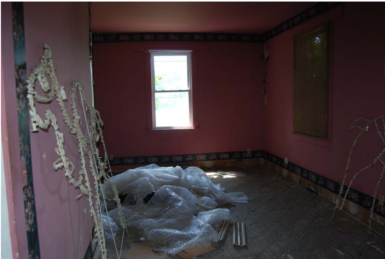
Living room looking toward river in northern unit