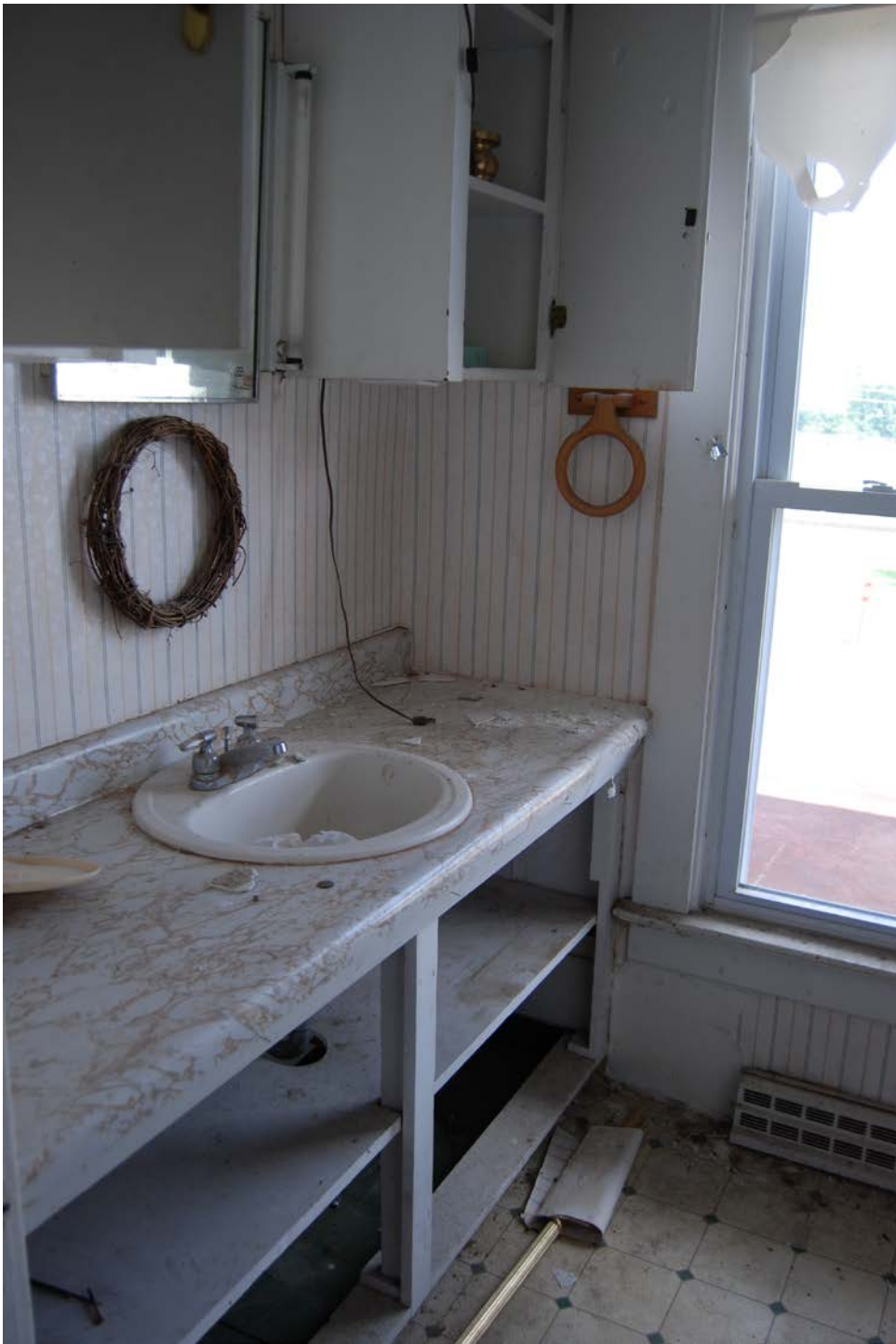
Bathroom facing east in northern unit