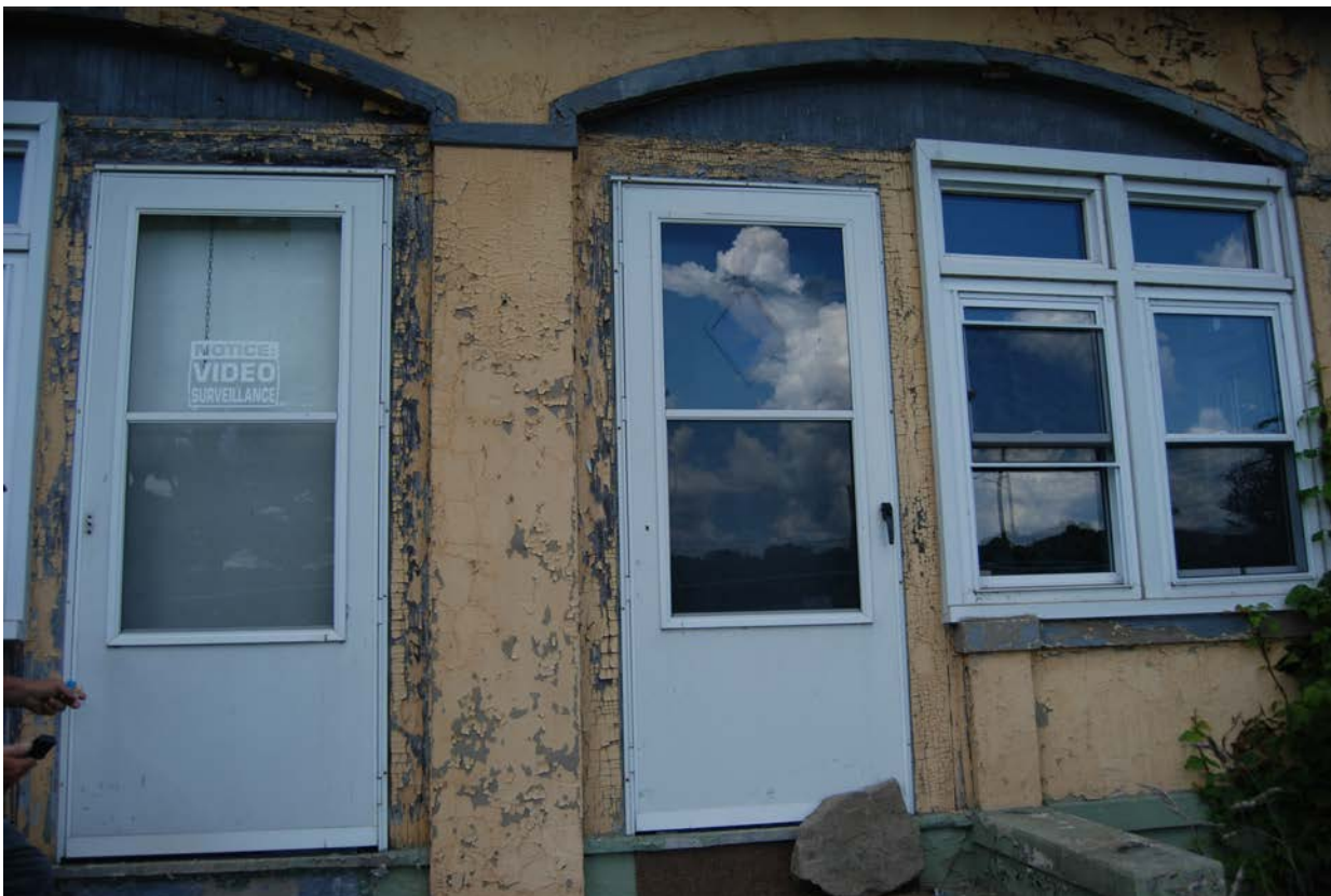
East porch (enclosed at a later date unknown)