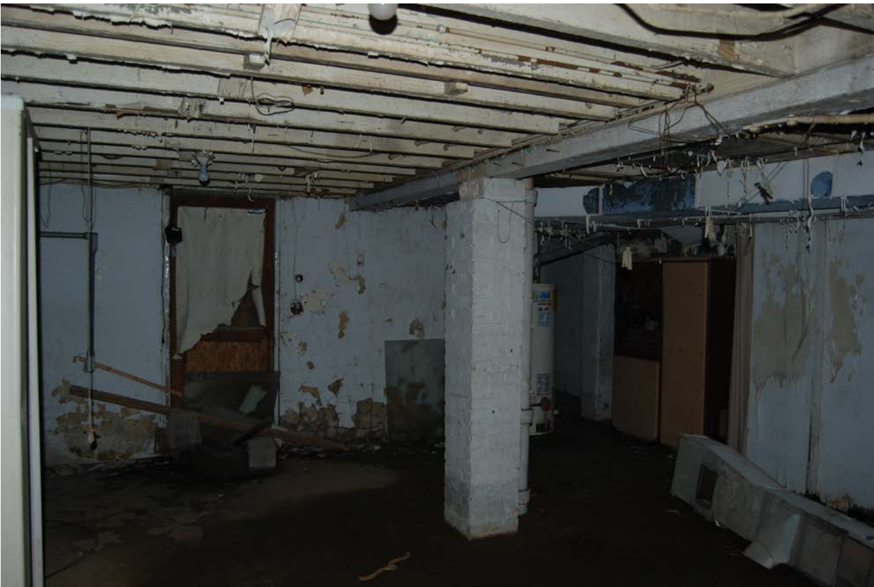
East wall of basement in northern unit