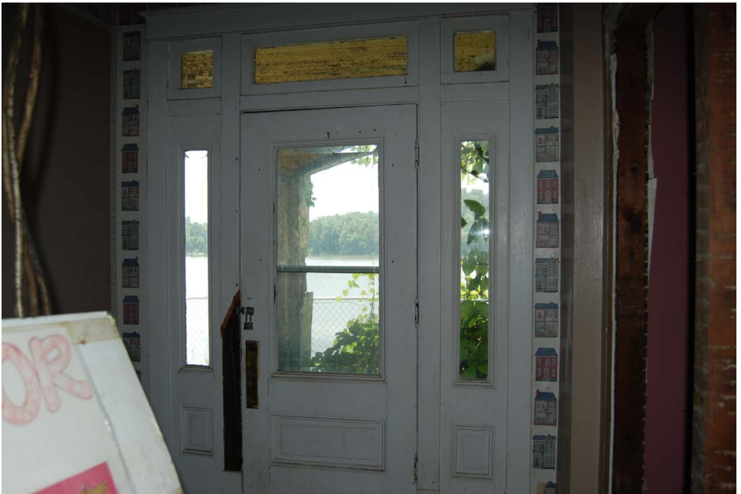
Northern unit doorway facing river.