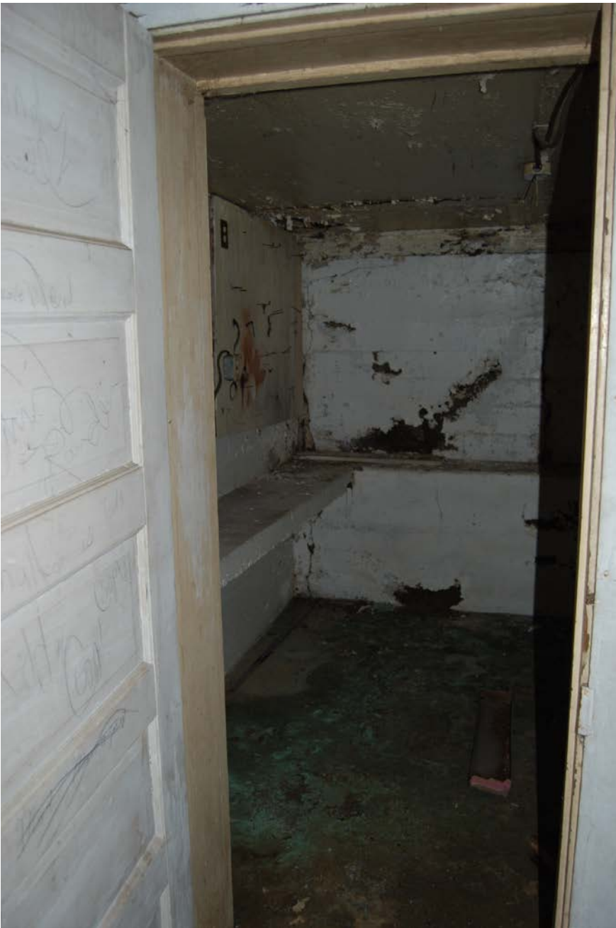
Storage room in basement under the river facing porch (northern unit)