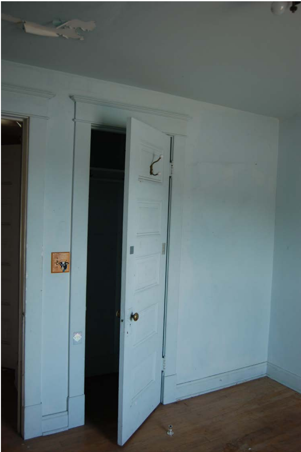
Bedroom 2 facing river in northern unit