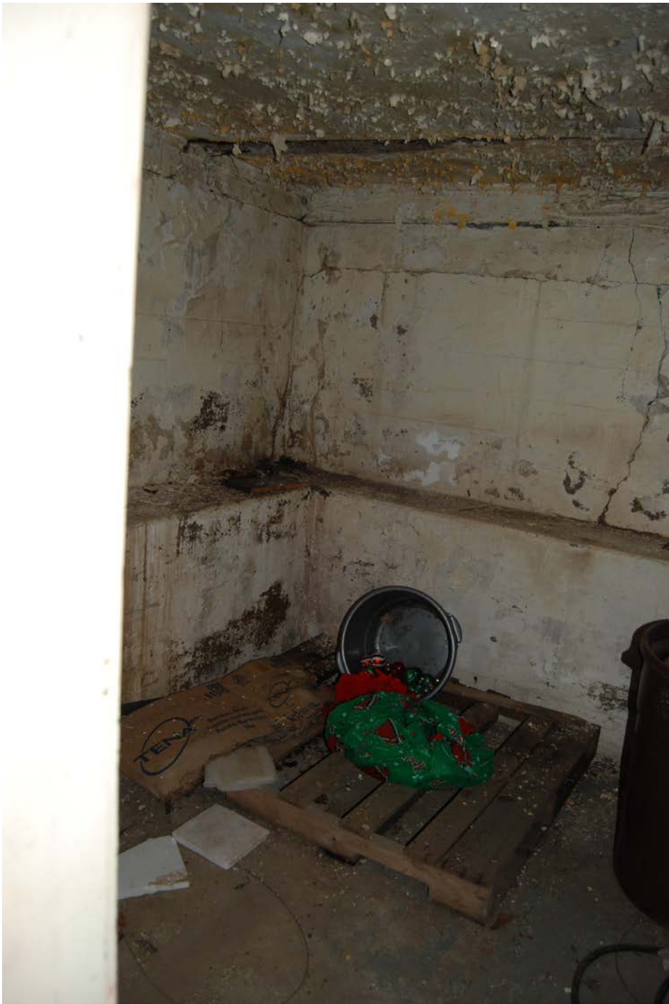
Basement storage under the westward facing porch in southern unit