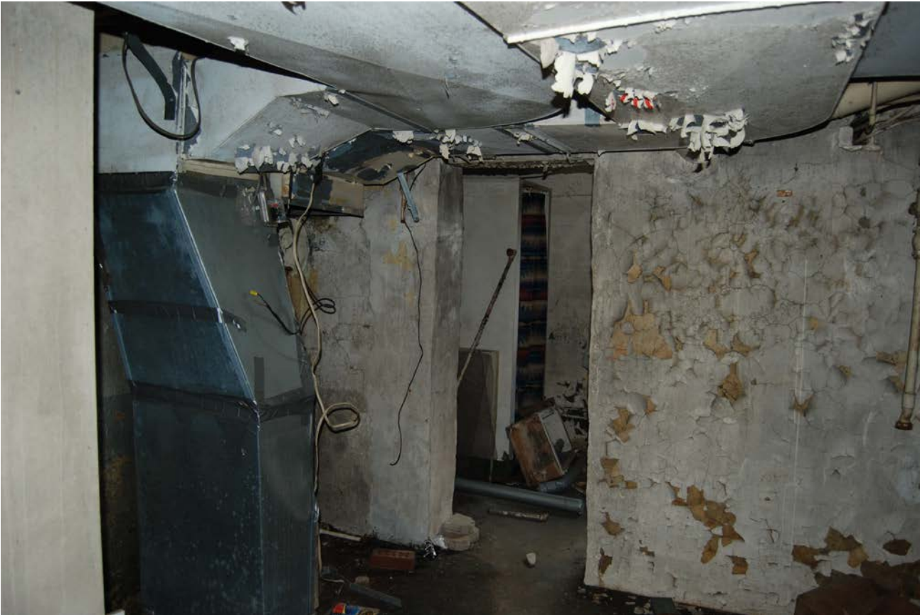
Basement southern unit facing street