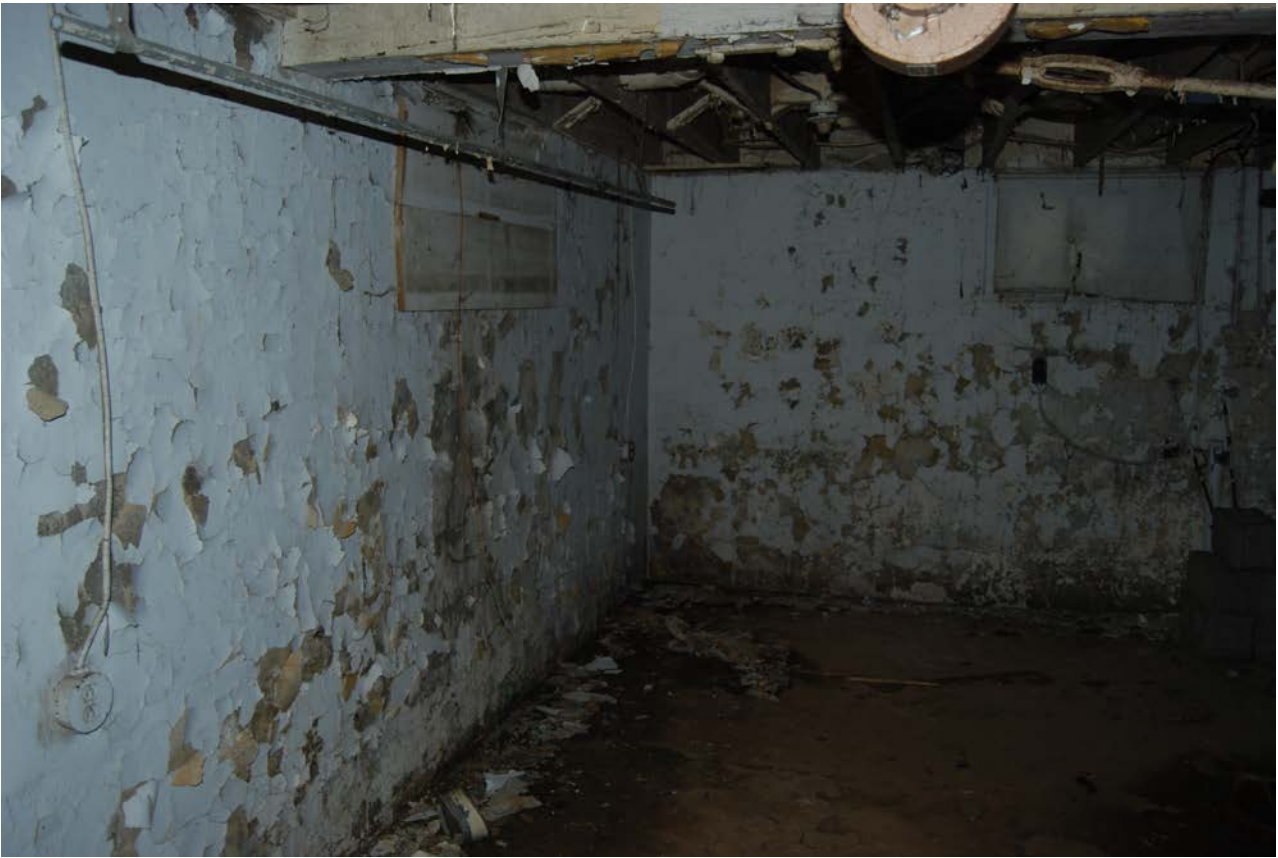
North wall of basement in northern unit