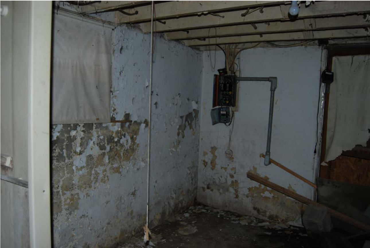
West wall in basement in northern unit