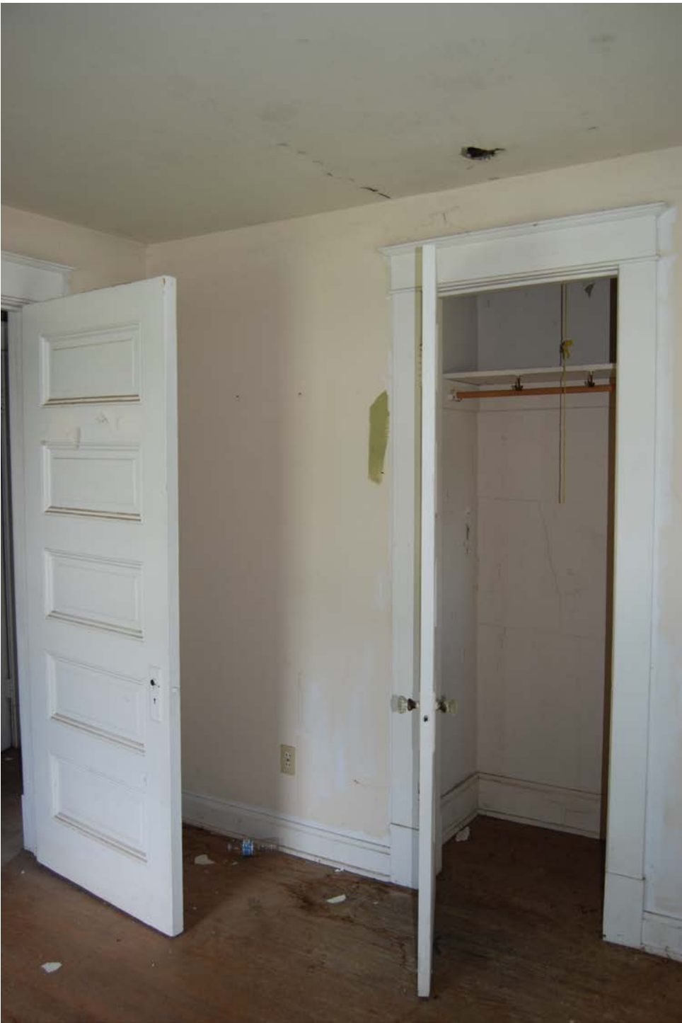
Bedroom 2 facing east in northern unit