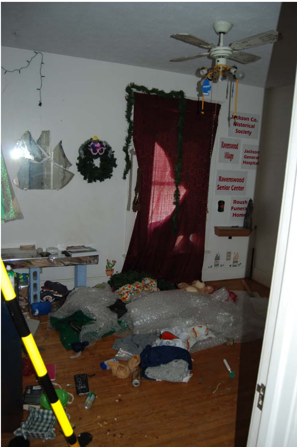
Bedroom 3 facing river southern unit