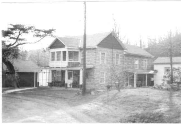
N. Front & Side View