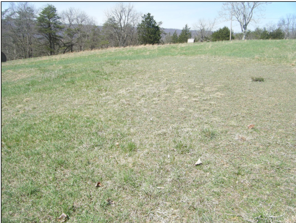
Photograph of the recorded location of 46-HM-188, looking north.