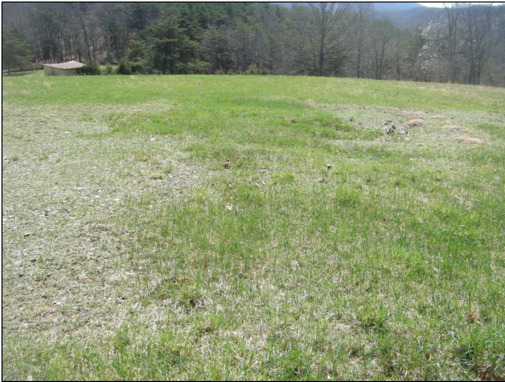
Photograph of the recorded location of 46-HM-188, looking southwest.