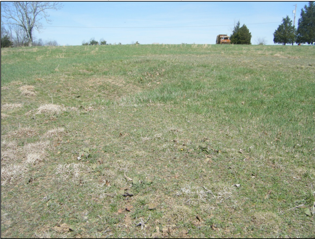
Photograph of the recorded location of 46-HM-188, looking north.